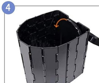
Lower The Base