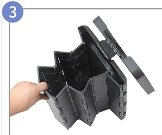
Pull Out The Side Support