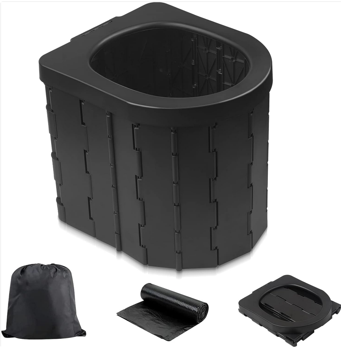
Figure 2.1: The Zinyeme Portable Folding Toilet in its compact form, shown with its carry bag and plastic waste bags.