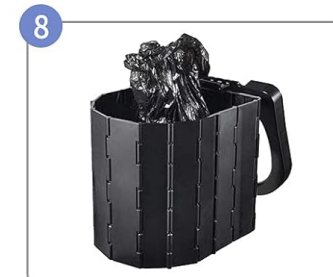
After Use, Just Tie up The Bag and Lift It Out for Disposal Keep Clean After Use