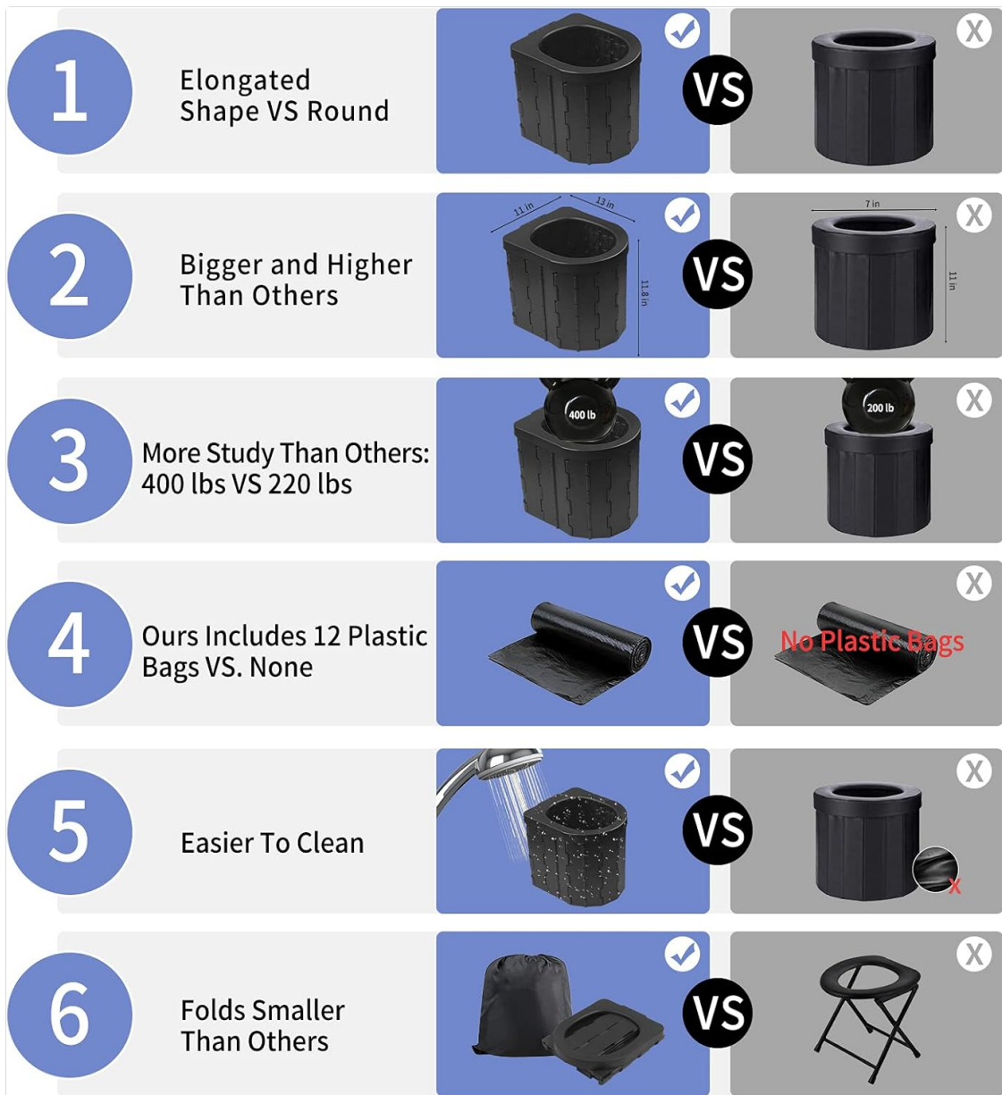
Figure 6.1: Illustration of the portable toilet being cleaned with water, highlighting its easy-to-clean design.