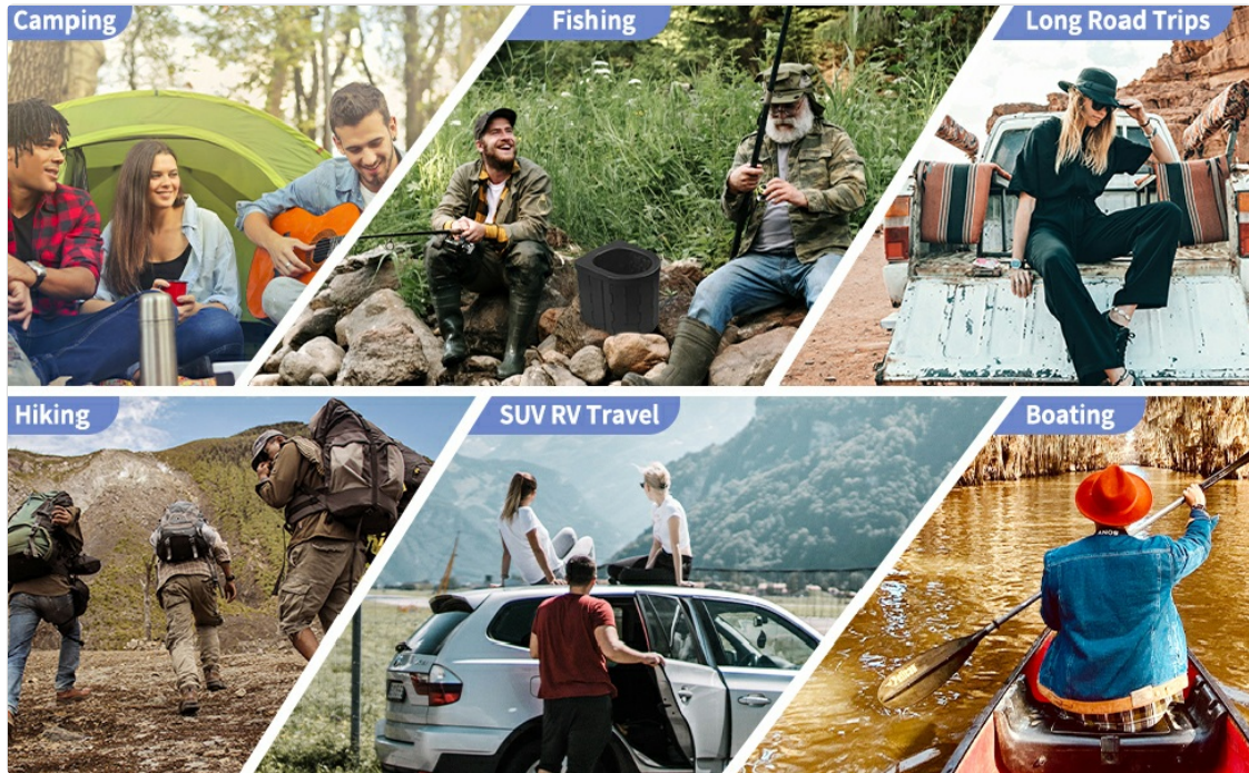
Figure 10.1: The portable toilet's versatility for camping, fishing, and other outdoor activities.