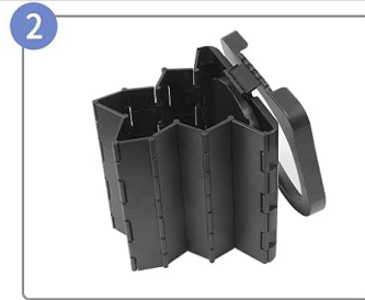
Unfold The Side Support