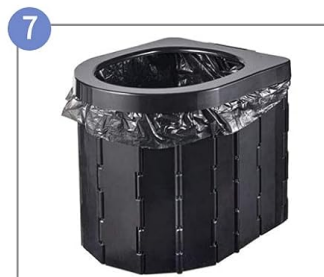
Cover The Toliet Lid and Make Sure The Garbage Bag is Pressed down