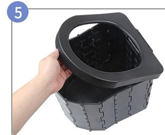
Put Down The Seat