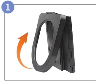
Turn Over The Seat Cover