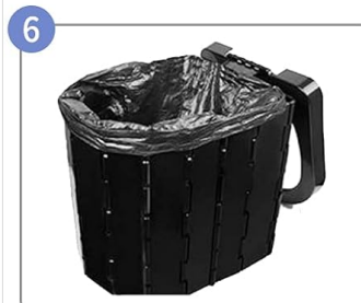
Put The Garbage Bag on The Bracket and Make Wure It is Covered All Around