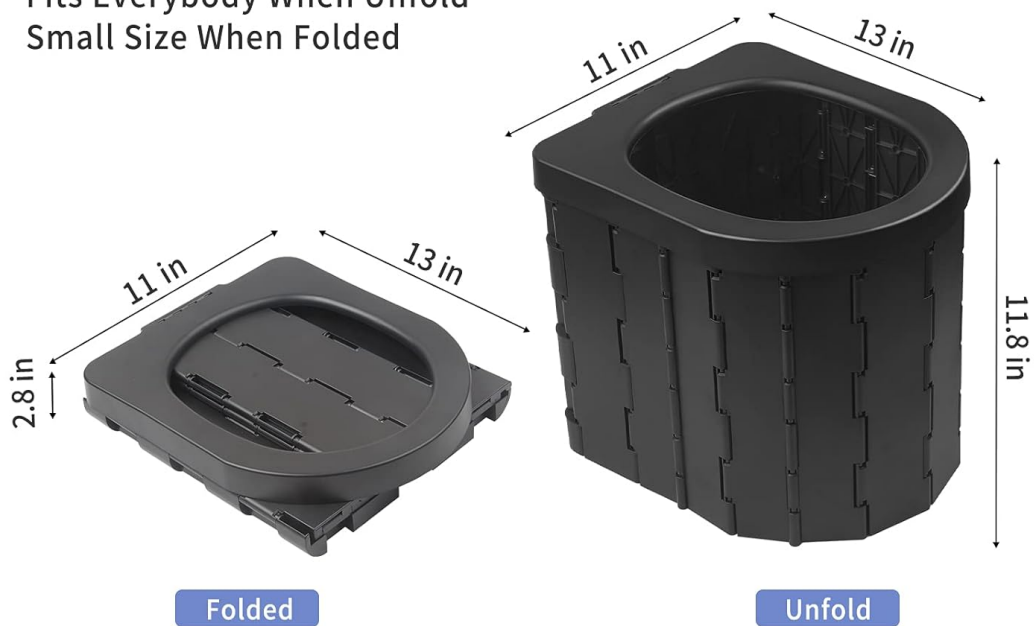
Figure 9.1: Dimensions of the Zinyeme Portable Folding Toilet when folded and unfolded.

Fits Everybody When Unfold Small Size When Folded