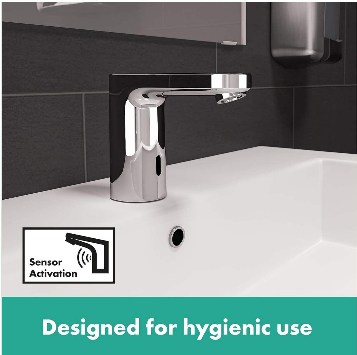
Image: Sensor activation for hygienic use.