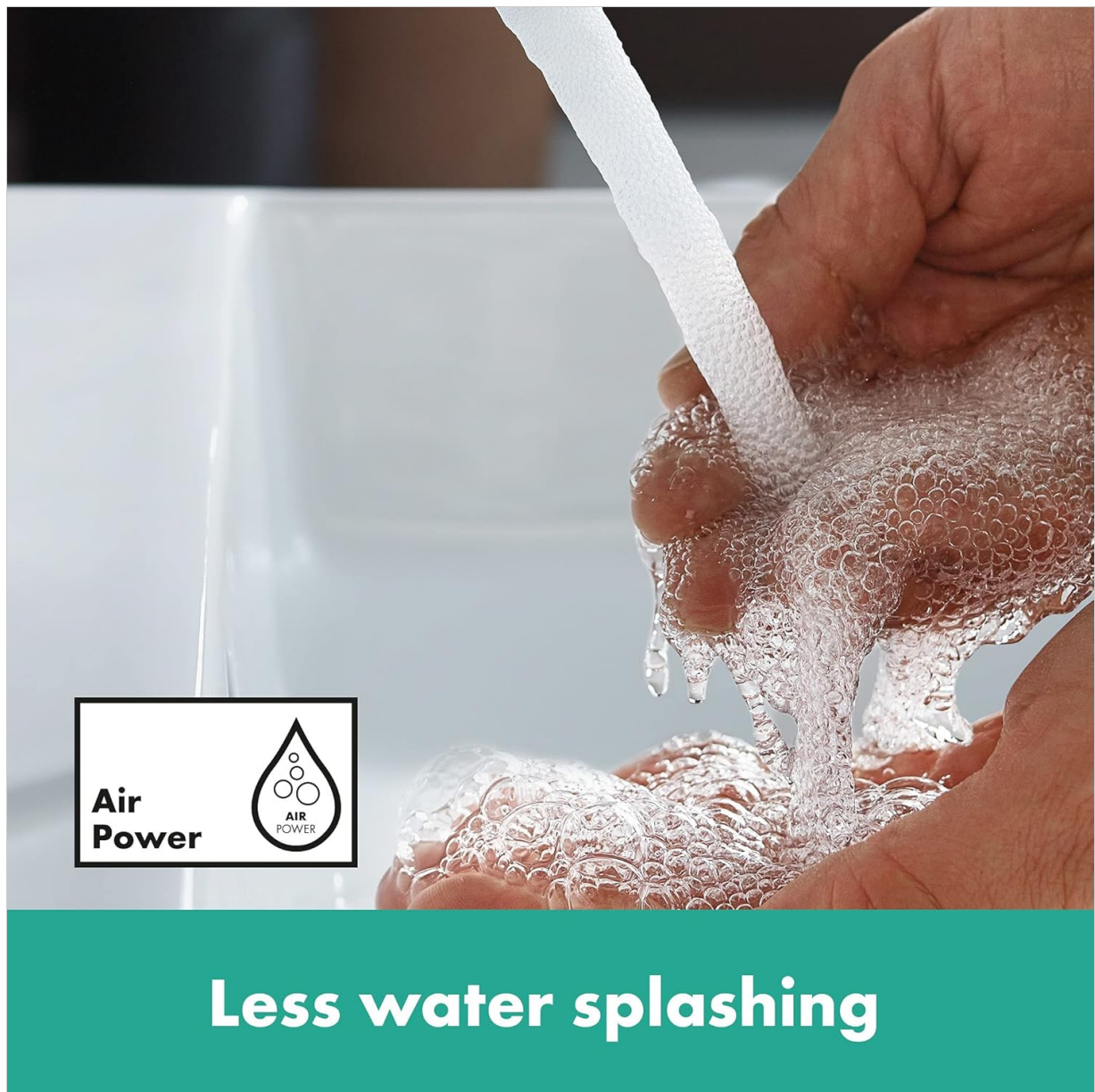
Image: AirPower technology for less water splashing.