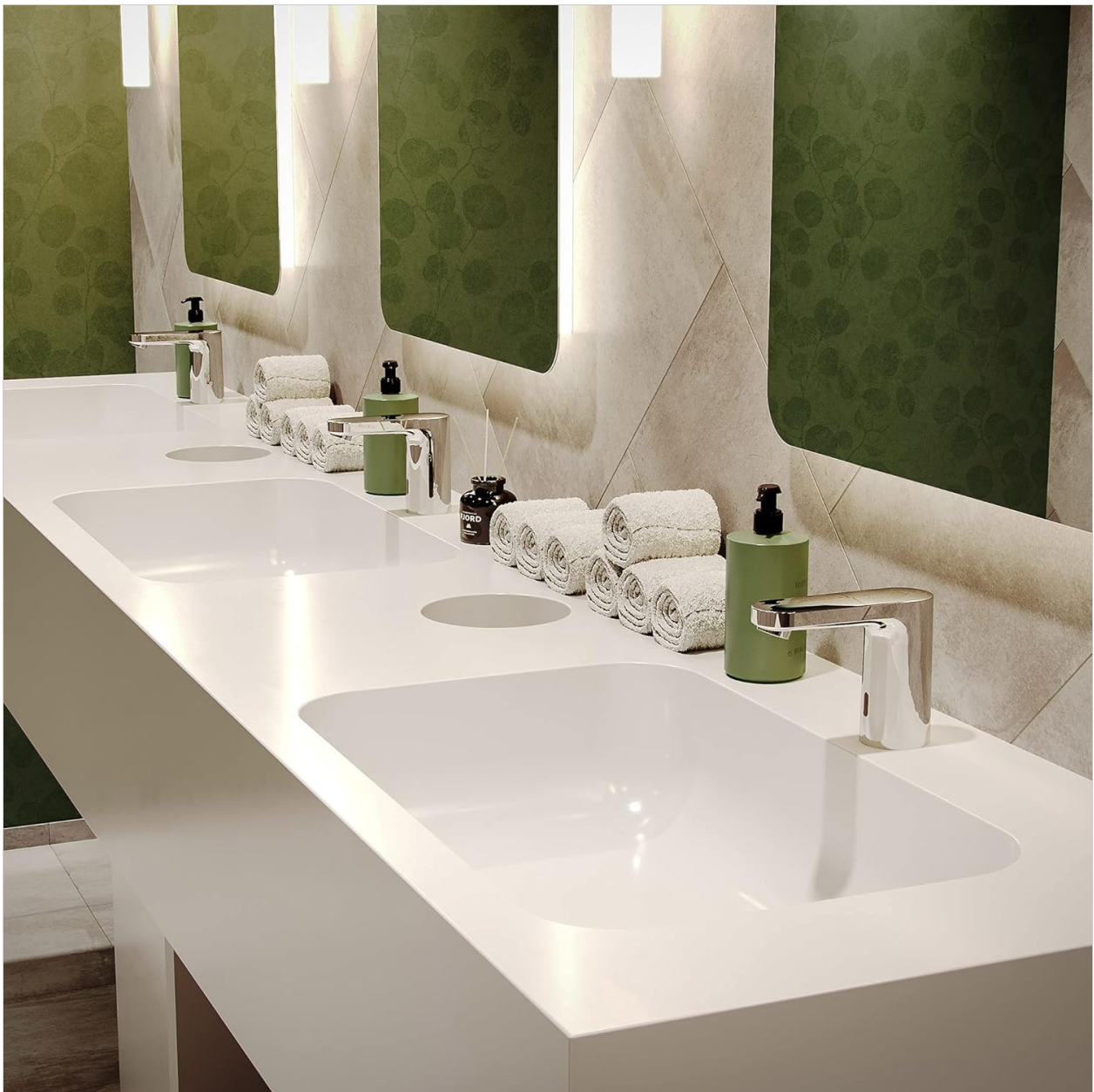
Image: Hansgrohe Vernis Blend electronic basin mixer in a public restroom setting.