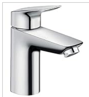
Figure 3: Visual representation of easy installation. The mixer is designed for straightforward mounting.