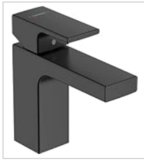
Figure 5: AirPower technology ensures less water splashing for a comfortable experience.