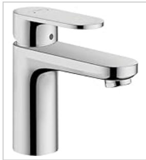
Figure 7: The durable ceramic cartridge ensures smooth and precise control.