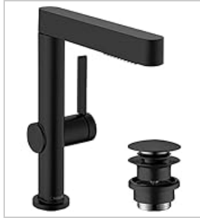
Figure 6: EcoSmart technology helps save water and money by optimizing flow.