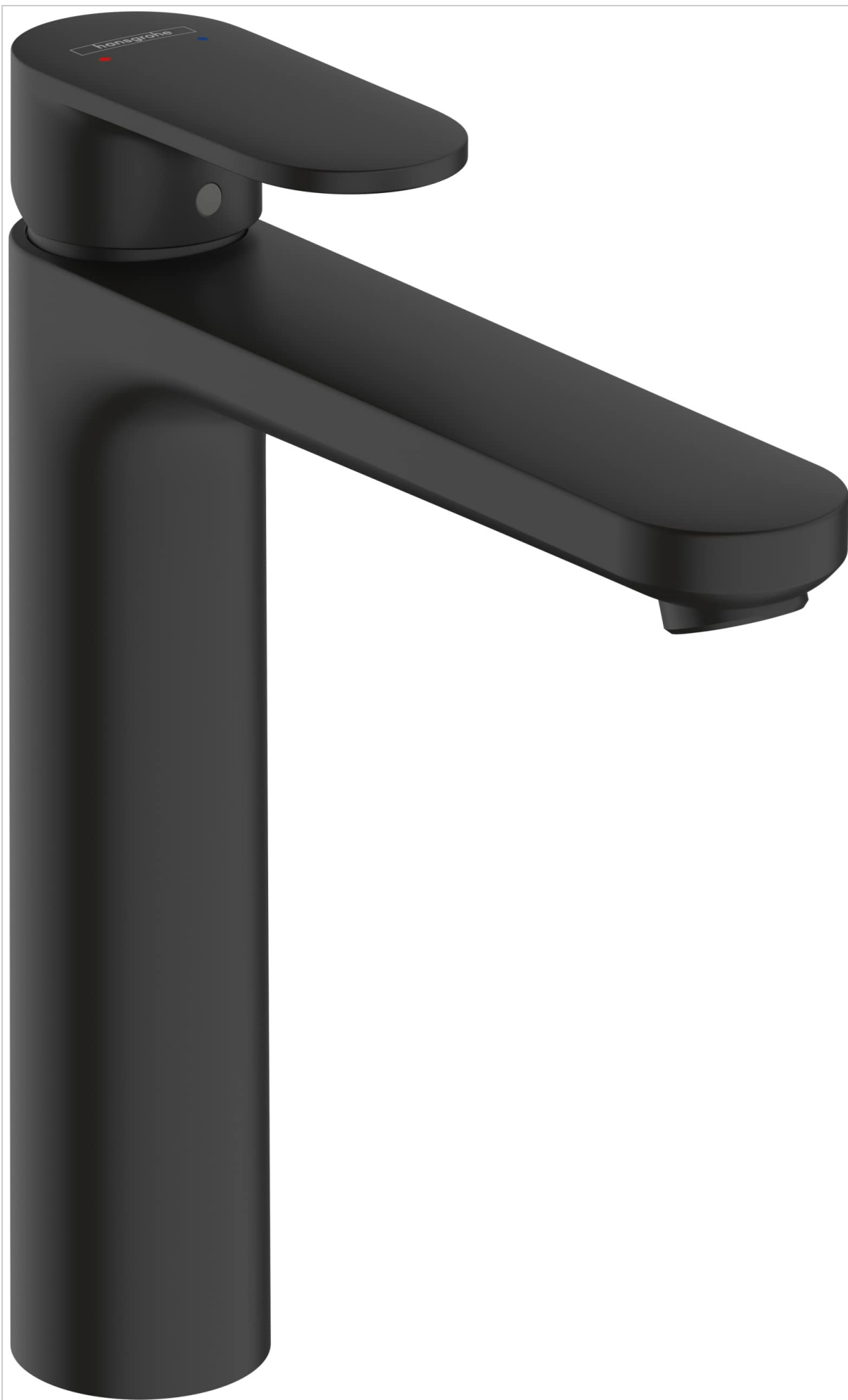
Figure 1: Hansgrohe Vernis Blend 190 Lavabo Mixer in Matte Black.