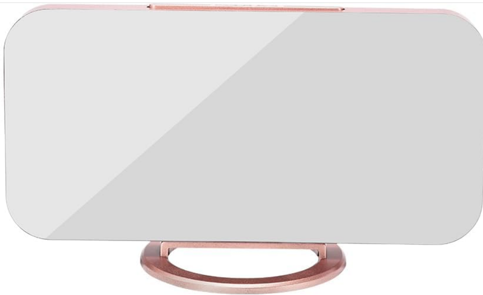
1 X Digital Alarm Clock