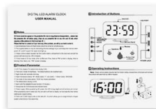
1 X User Manual