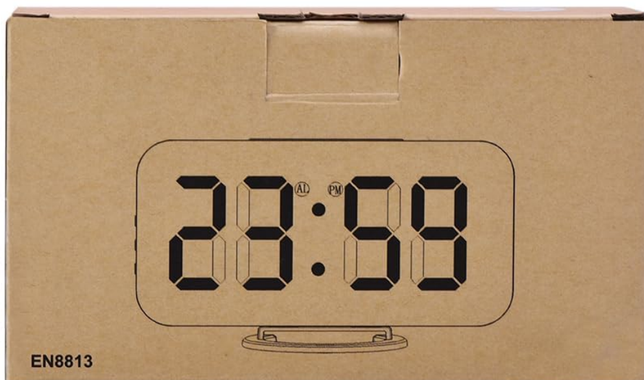
1 X Packing box