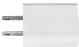
1 X Power Adapter