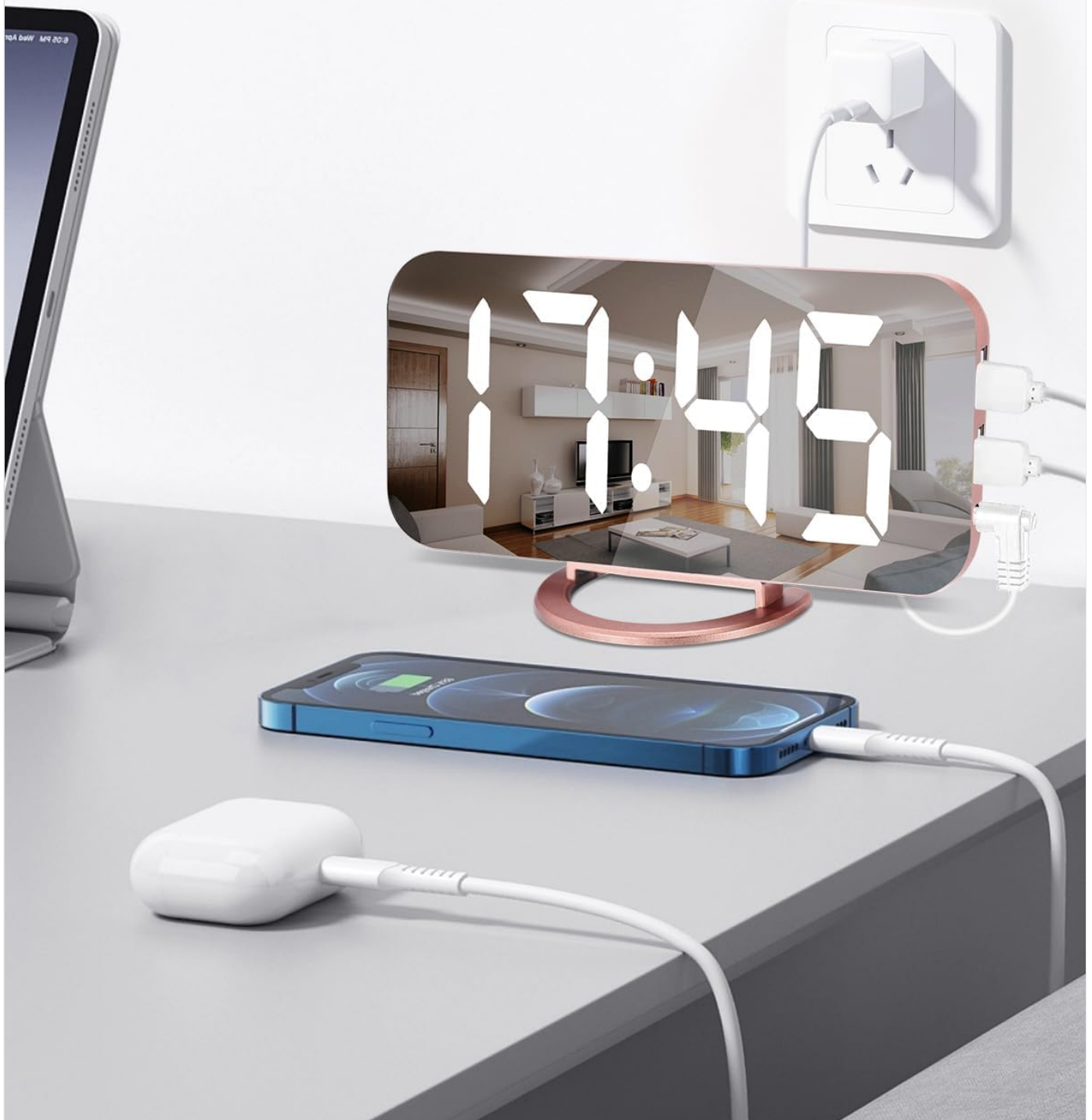
Image: The digital alarm clock on a desk, with a smartphone and wireless earbuds charging via its dual USB ports. The clock display shows "17:45".