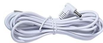
1 X USB Power Cable

Image: A visual representation of the Poeroa Digital Alarm Clock package contents, including the clock itself, its packaging box, power adapter, CR2016 battery, user manual, and USB charging cable.