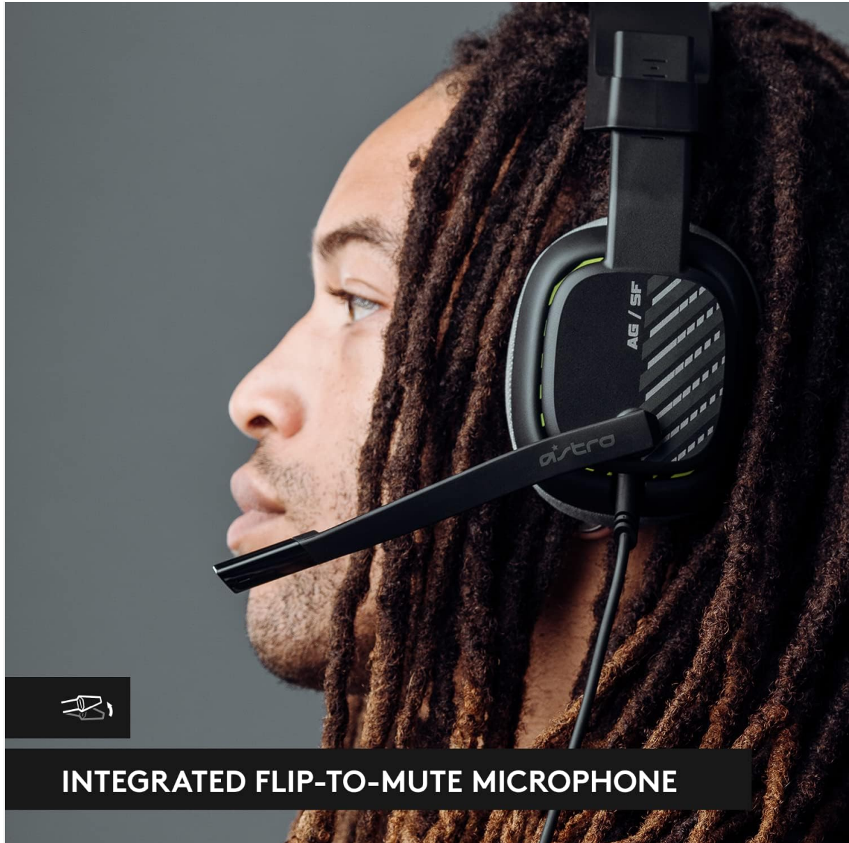
Image: A user demonstrating the flip-to-mute microphone feature on the ASTRO A10 Gen 2 Headset.

The integrated boom microphone features a flip-to-mute function. To activate the microphone, lower the boom arm into the speaking position. To mute the microphone, simply flip the boom arm upwards until it clicks into the vertical position. This provides quick and convenient privacy.