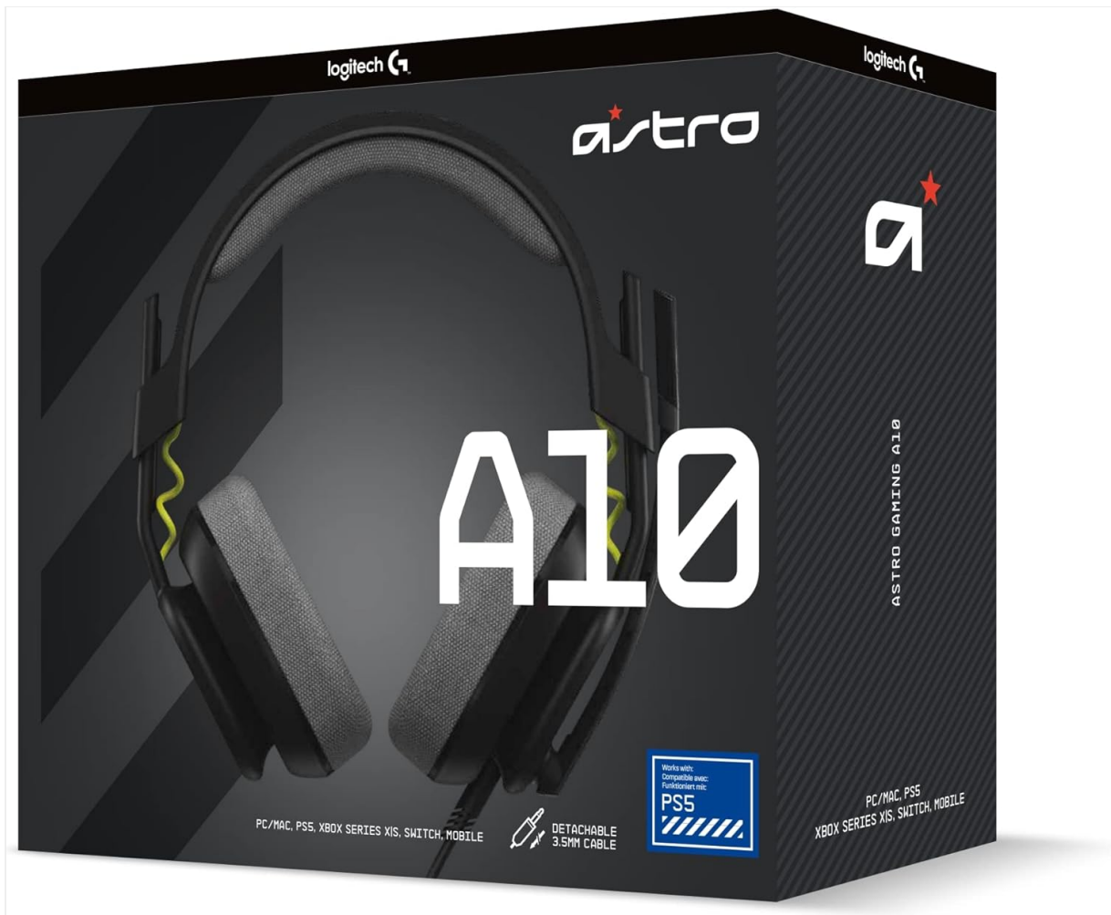
Image: The ASTRO A10 Gen 2 Headset box, indicating the included headset and cables.