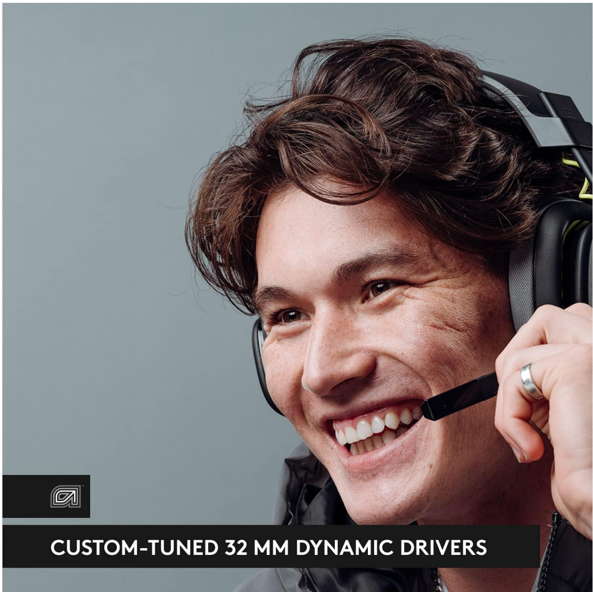
Image: Close-up of the ASTRO A10 Gen 2 Headset highlighting the custom-tuned 32mm dynamic drivers.