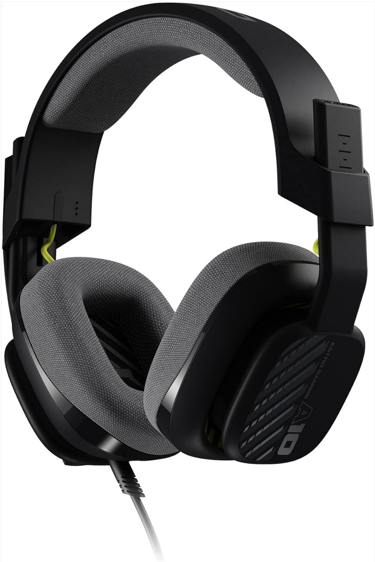
Image: The removable headphone cable with in-line volume control, ready for connection.