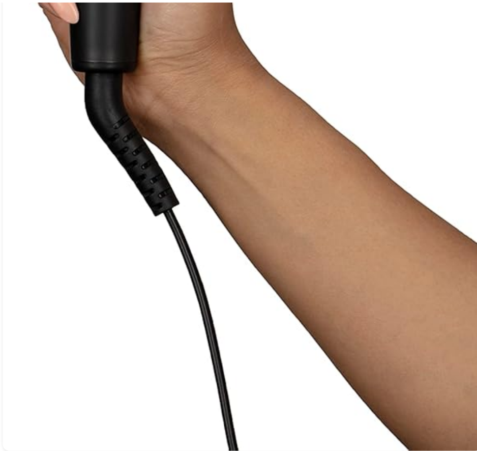
Image: A user holding the curling wand, highlighting the digital display and cool tip.