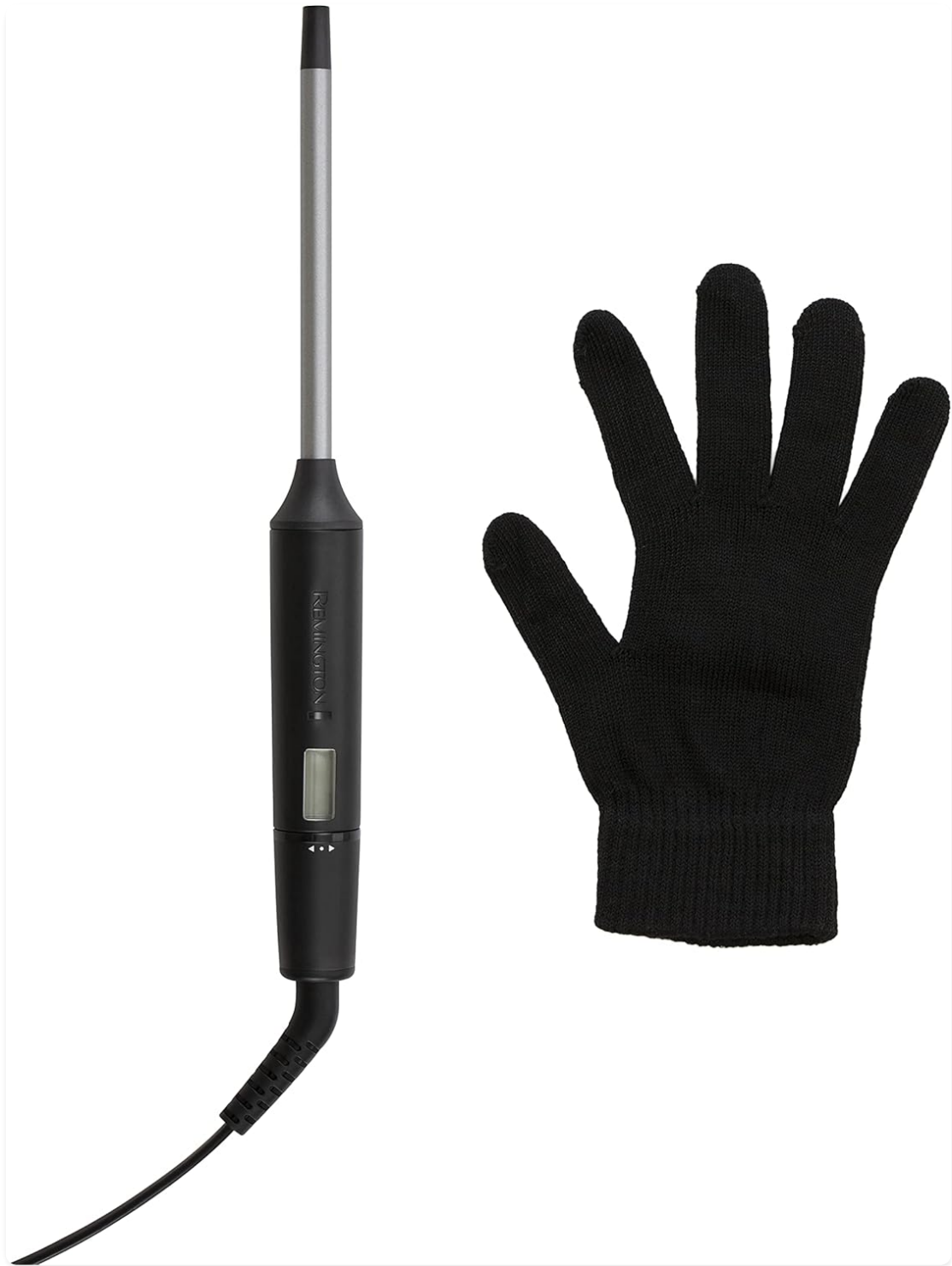
Image: The curling wand alongside the included heat-resistant glove, ready for use.