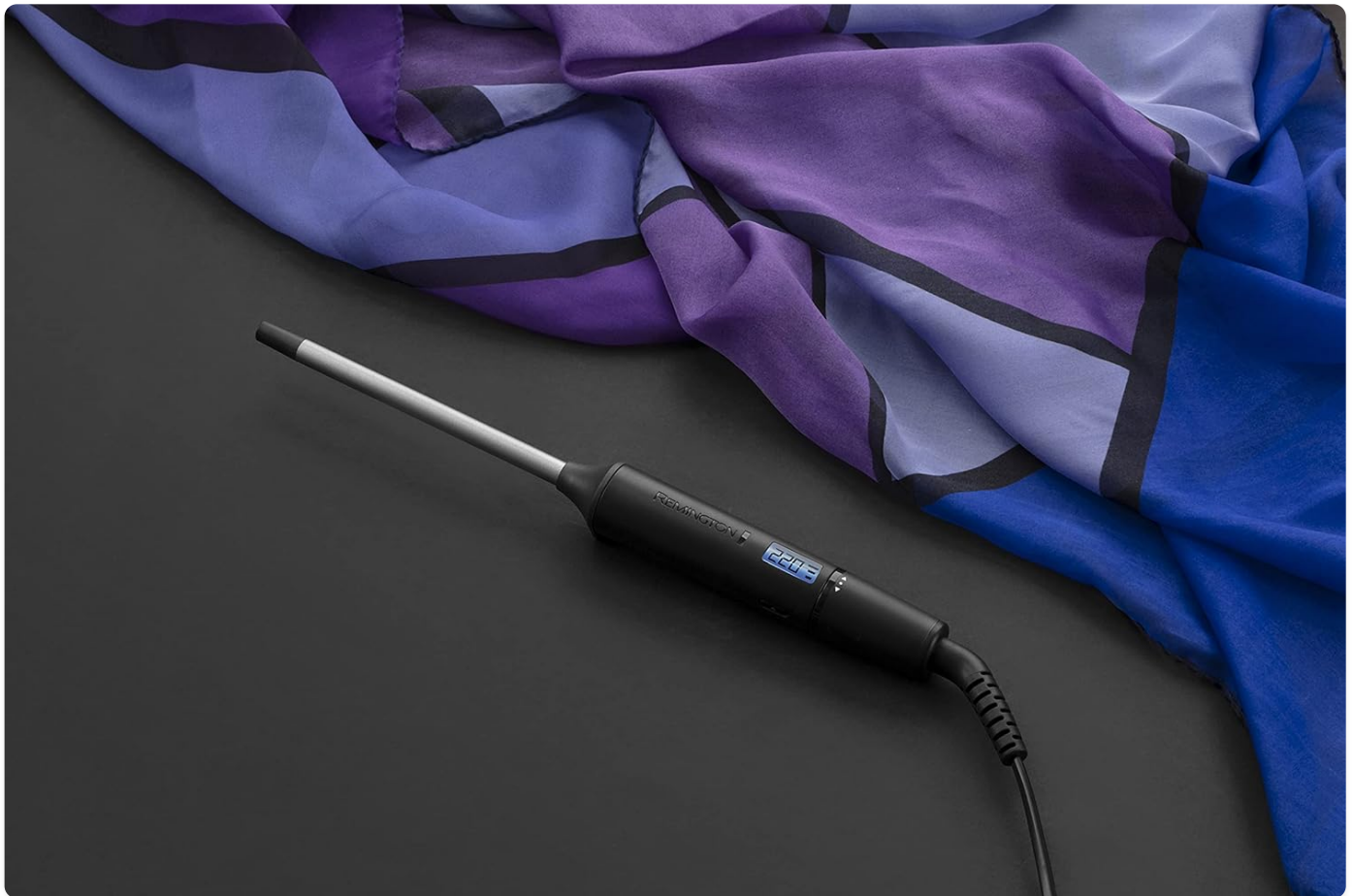
Image: The Remington Pro Tight Curl Wand CI6X10, showcasing its sleek design and digital display.

Heats up in just 30 seconds. Includes an on/off button, temperature adjustment dial, cool tip, universal voltage, and a swivel cord for ease of use. Automatic shut-off after 60 minutes for enhanced safety.