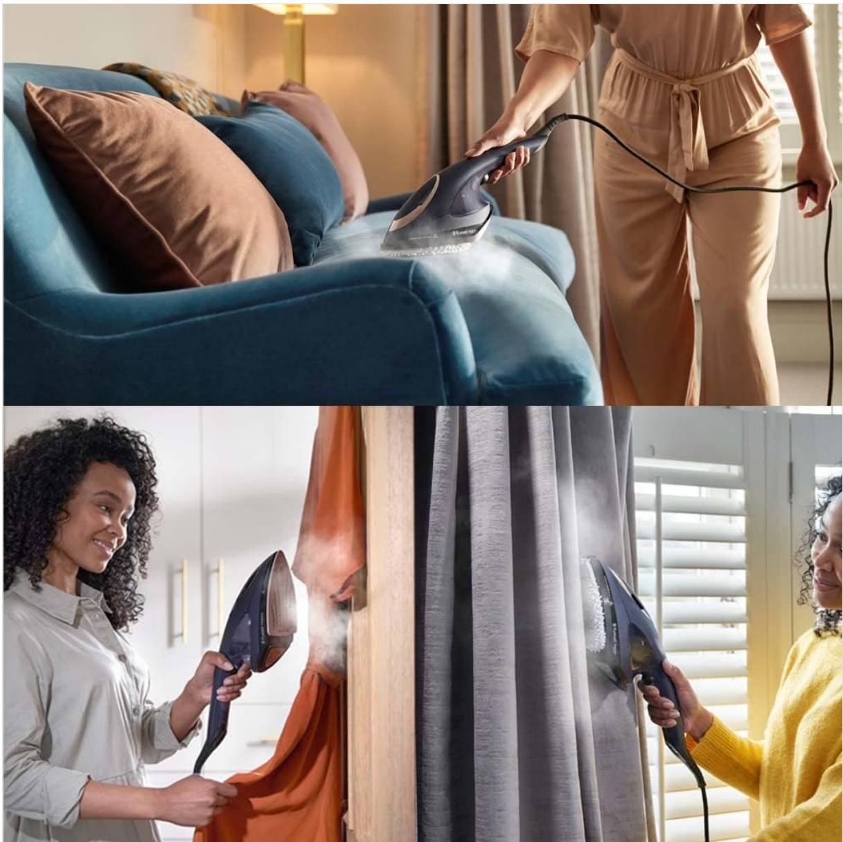
Image: A user demonstrating the vertical steaming function on both a sofa and curtains, highlighting the versatility of the Steam Genie for various household fabrics.