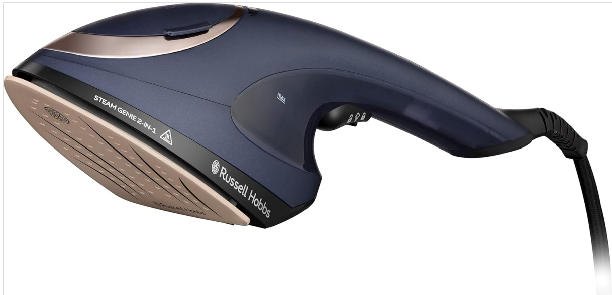
Image: The Russell Hobbs Steam Genie 2-in-1 Handheld Steamer and Iron, showcasing its ergonomic design and soleplate.

Familiarize yourself with the components of your Steam Genie 2-in-1 appliance.