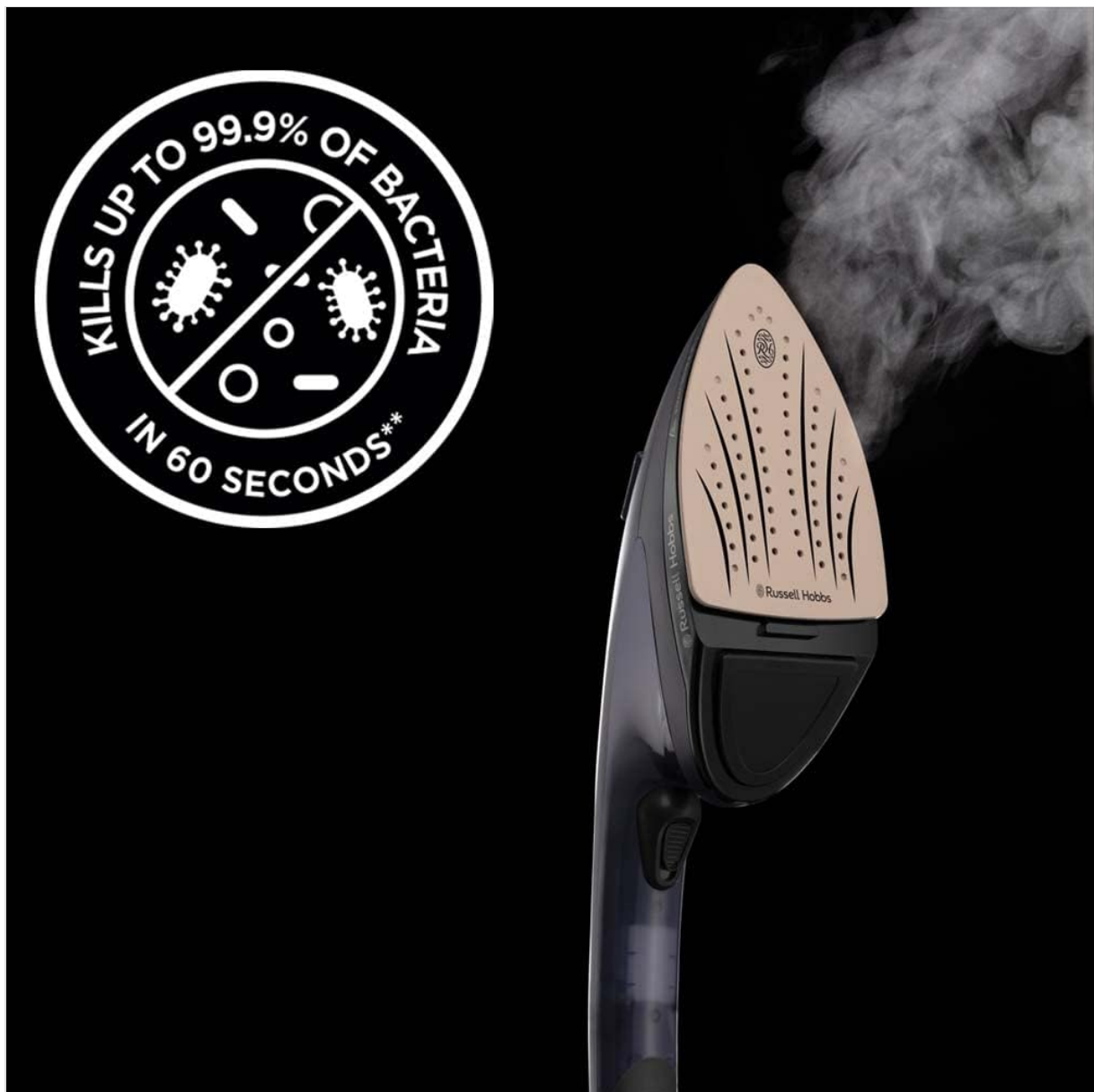
Image: A graphic icon illustrating the product's ability to kill up to 99.9% of bacteria in 60 seconds, emphasizing its sanitizing capability.