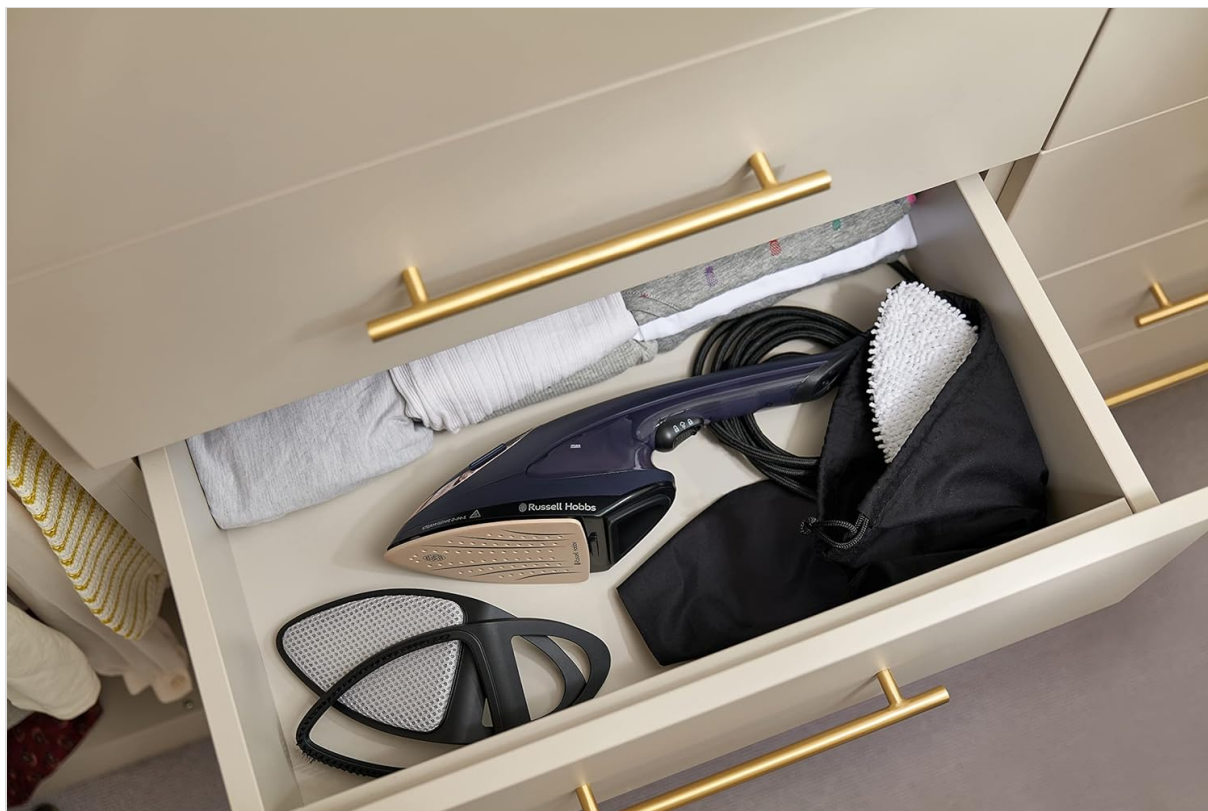
Image: The Steam Genie 2-in-1, along with its accessories and storage bag, neatly organized inside a drawer, demonstrating its compact storage capabilities.

Once cooled and emptied, store the appliance and its accessories in the provided heat-resistant storage bag (H) in a dry, safe place.