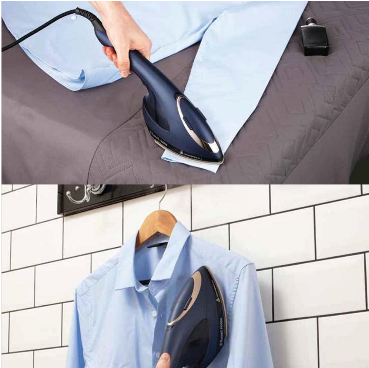
Image: A user demonstrating both horizontal ironing on a flat surface and vertical steaming of a hanging shirt, illustrating the 2-in-1 functionality.