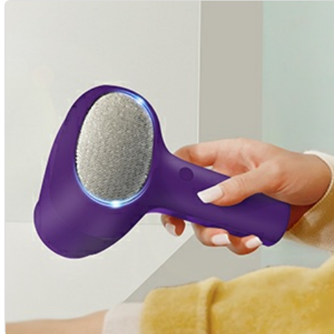
Figure 4: The built-in anti-static brush helps remove extra fuzz, lint, and pet hair, providing a complete fabric care solution.