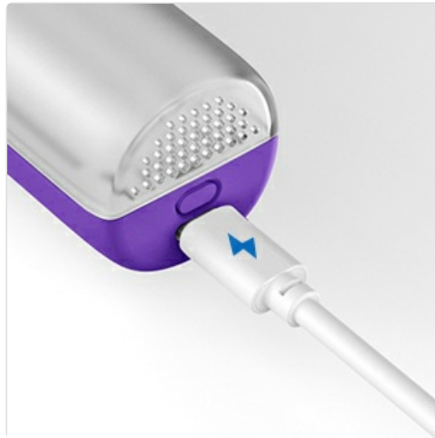
Figure 1: USB-C charging port on the VASSON Fabric Shaver. The device is rechargeable, eliminating the need for frequent battery replacement.

cable to the charging port located at the bottom of the handle and plug the other end into a compatible USB power source. The indicator light will show charging status. A full charge takes approximately 2 hours.