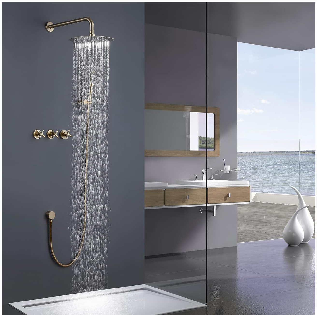
Image 5.1: The shower system in operation, showcasing the rain shower head.