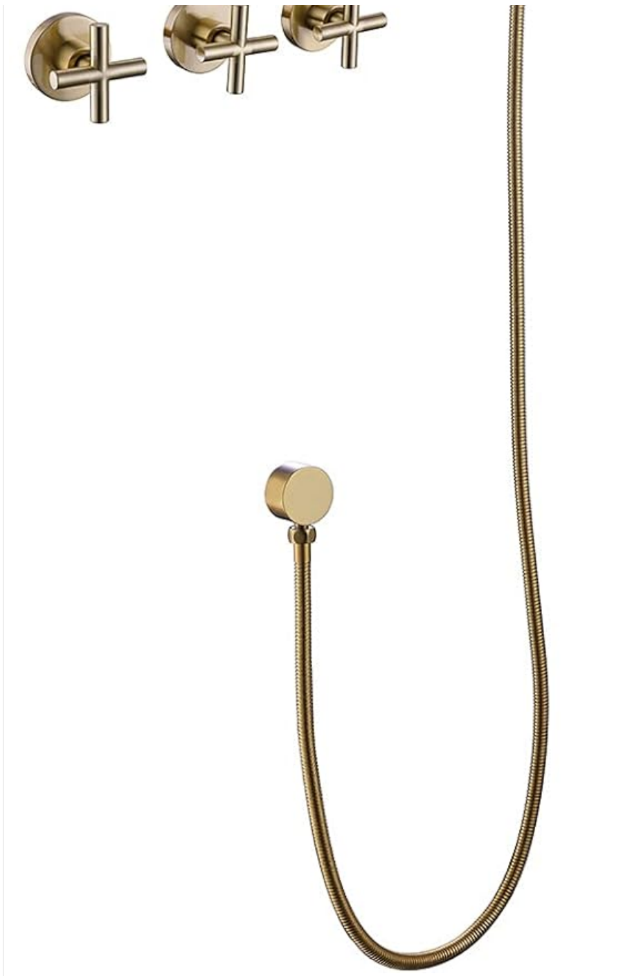
Image 1.1: Overview of the RBROHANT Gold Shower System components.