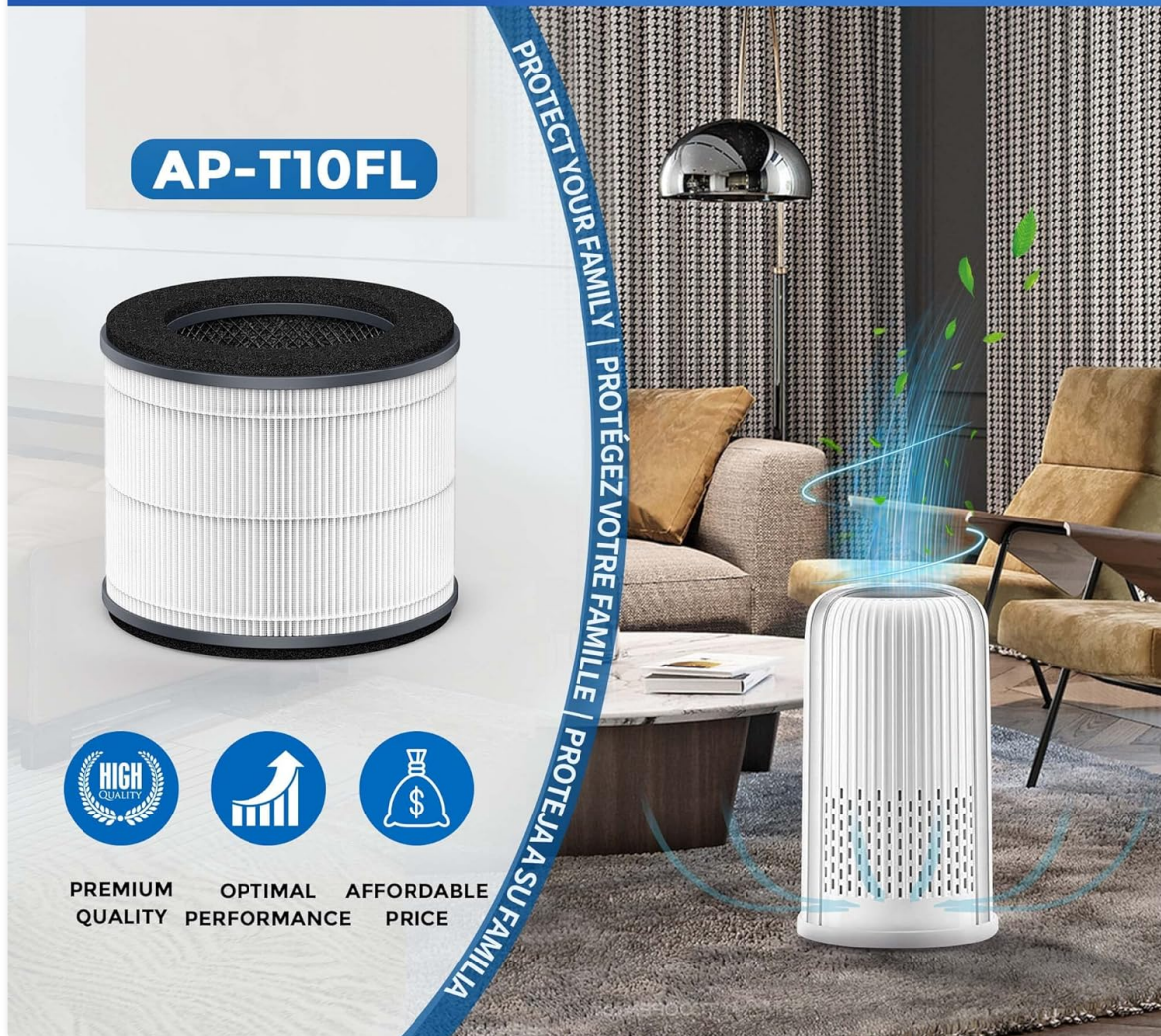
Image: The DAJDAH AP-T10FL replacement filter shown alongside compatible Homedics AP-T10-WT and AP-T10-BK air purifiers, highlighting its perfect compatibility.

Your browser does not support the video tag.