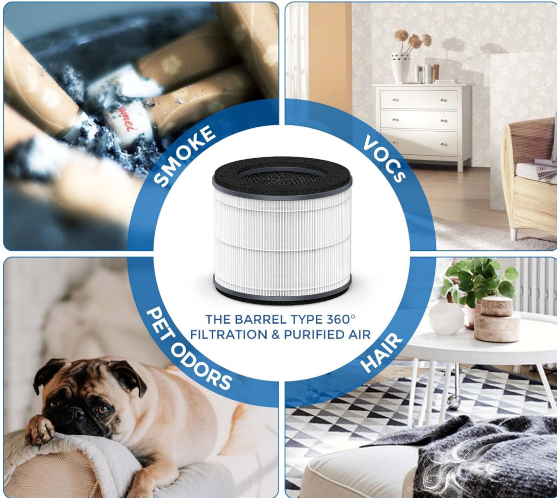
Image: Visual representation of the filter's effectiveness in removing common indoor air pollutants such as smoke, VOCs, pet odors, and hair.