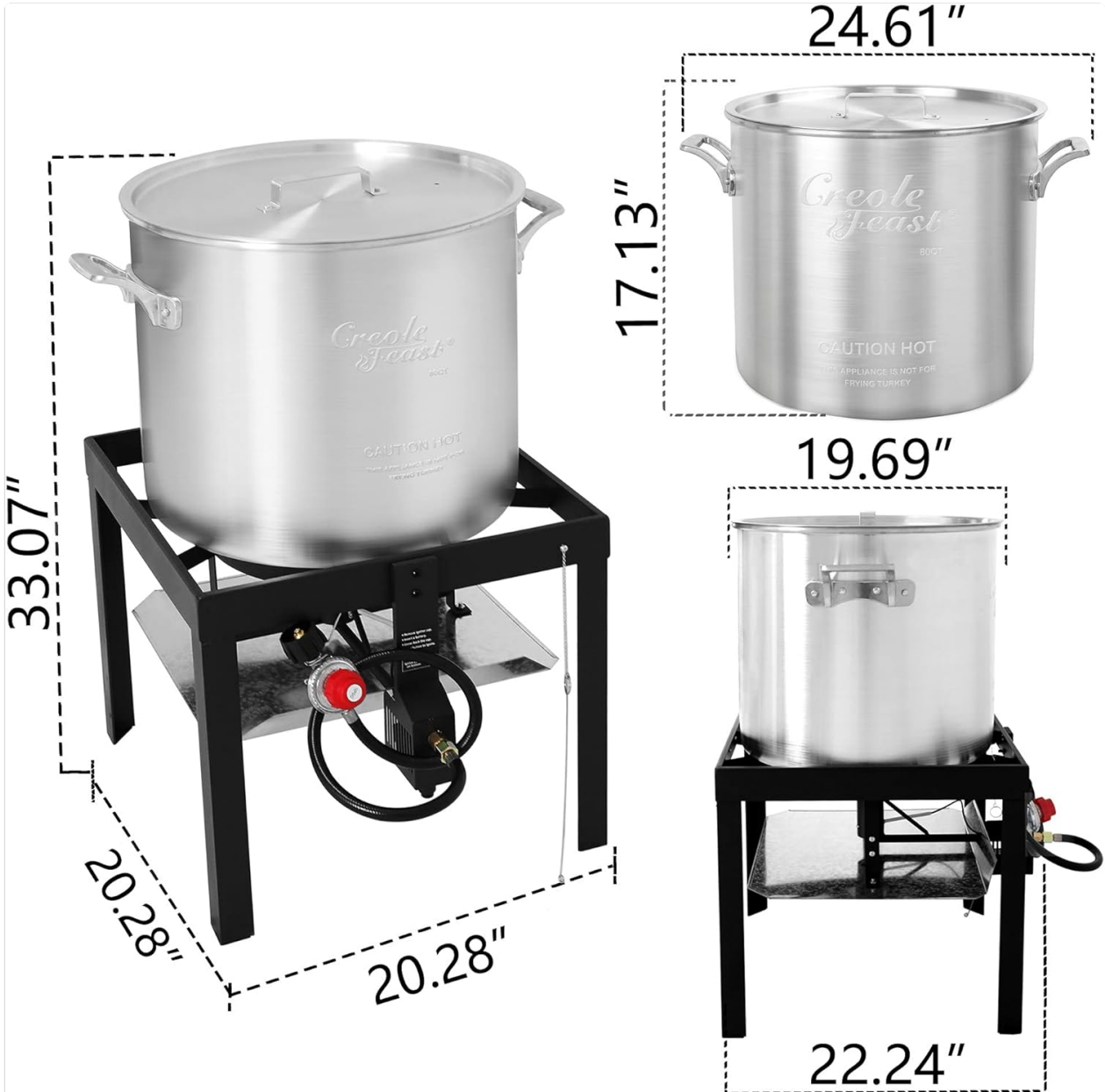
Figure 7: Product dimensions.