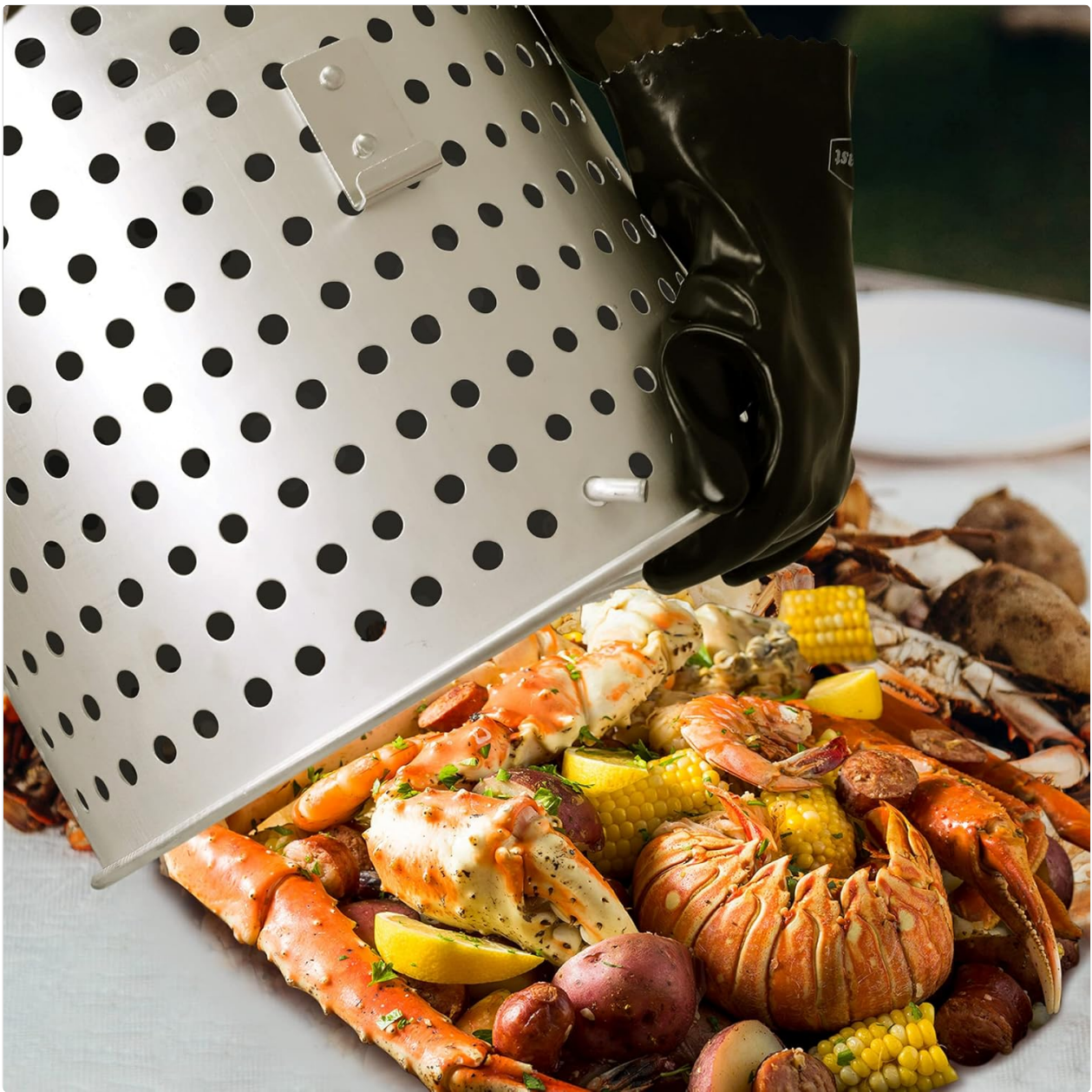
Figure 6: Draining and serving cooked seafood.