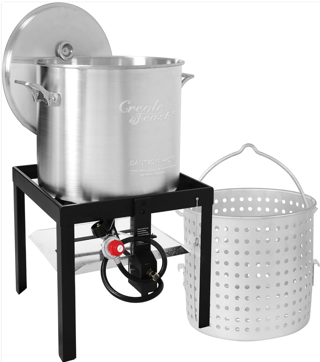
Figure 1: Creole Feast SBK0801 80 Qt Seafood Boiling Kit components.