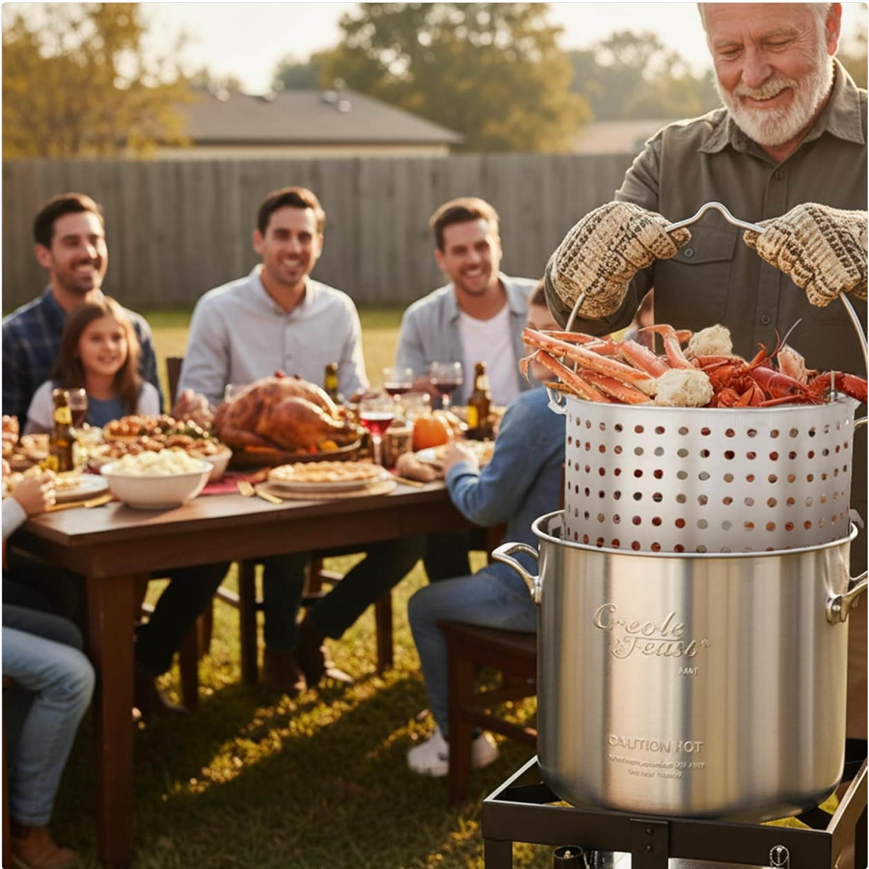
Figure 5: Lifting the basket after boiling.