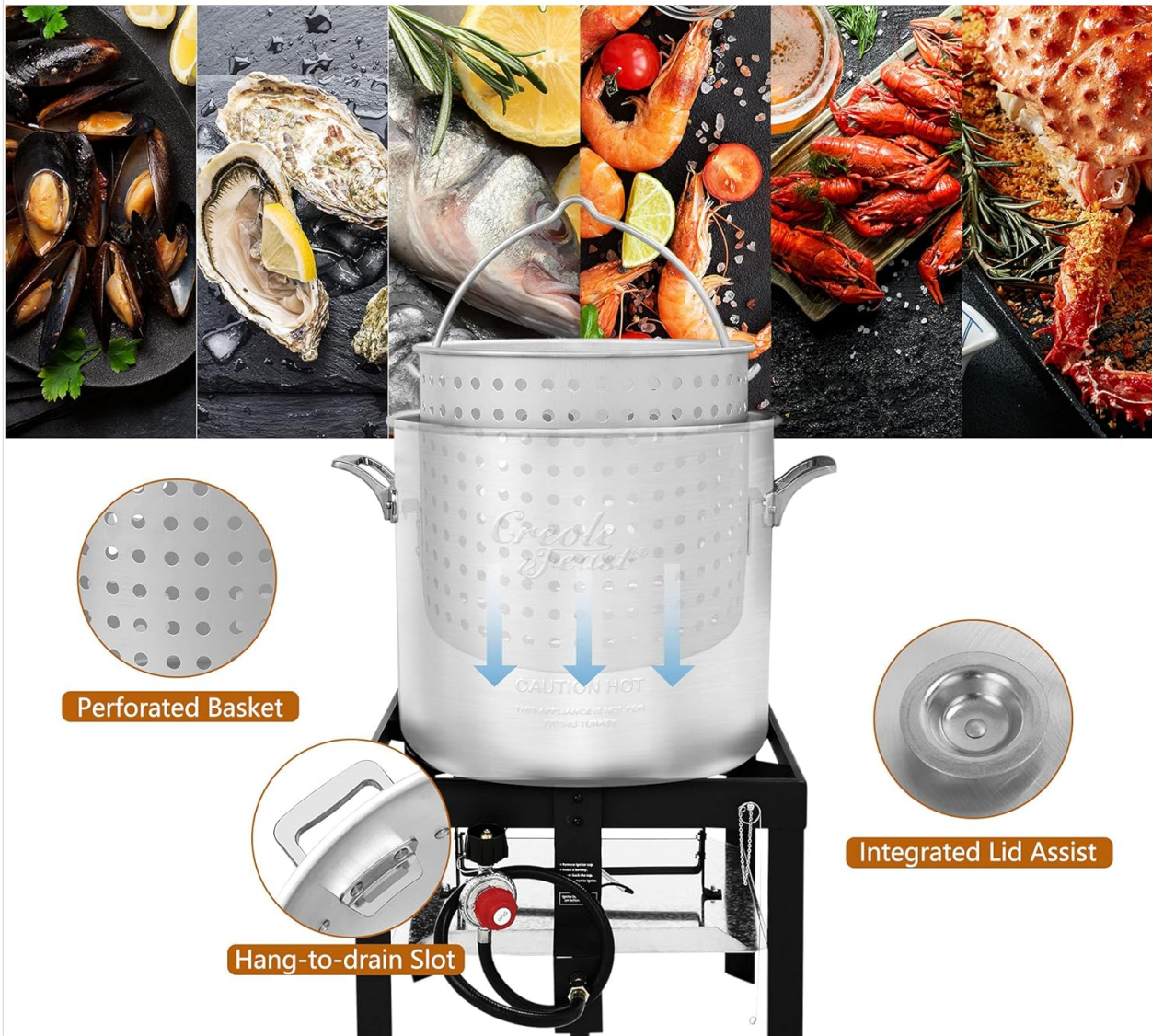
Figure 2: Key features and components of the boiling kit.