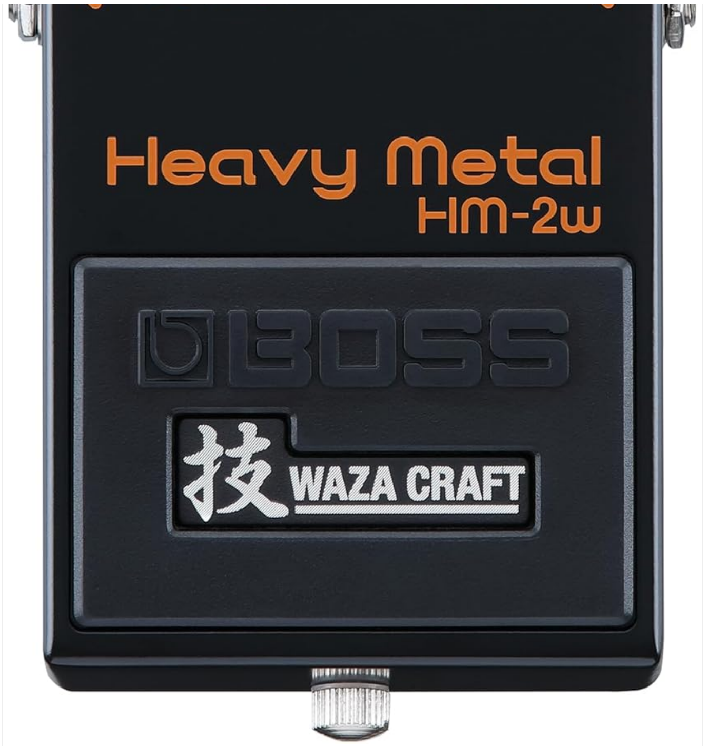
Image: Front view of the BOSS HM-2W Heavy Metal Guitar Effects Pedal, showcasing its black casing and orange control knobs.