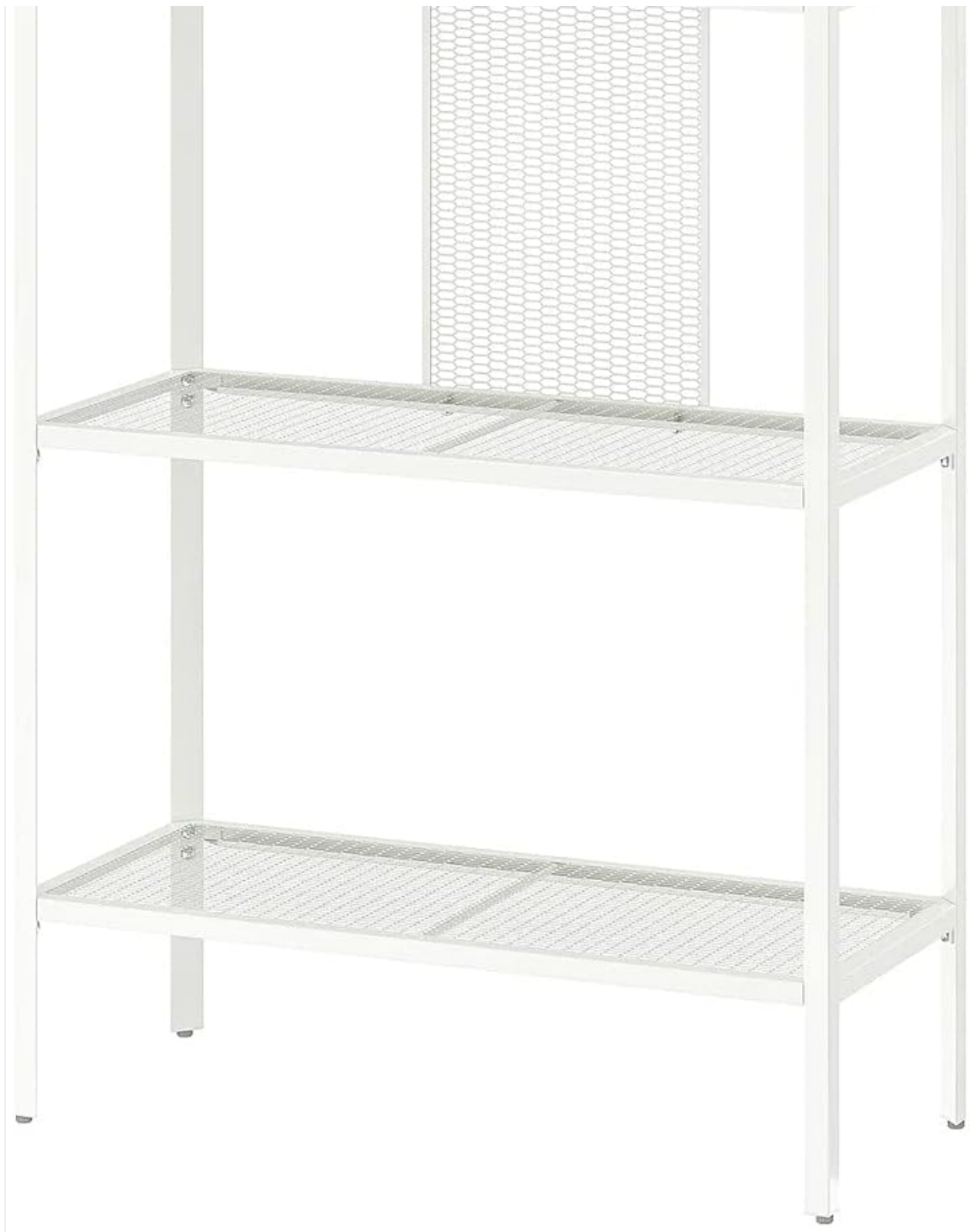
Figure 2: Fully assembled IKEA BAGGEBO Shelf Unit in white, showcasing its metal frame and mesh shelves. This image provides a visual reference of the completed product.