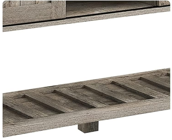
Middle Support Leg Prevents Sagging