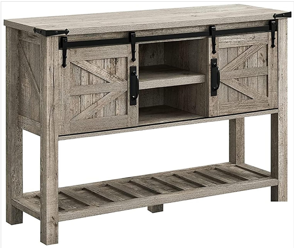
Figure 2.1: Front view of the assembled OKD Farmhouse Console Entryway Table.