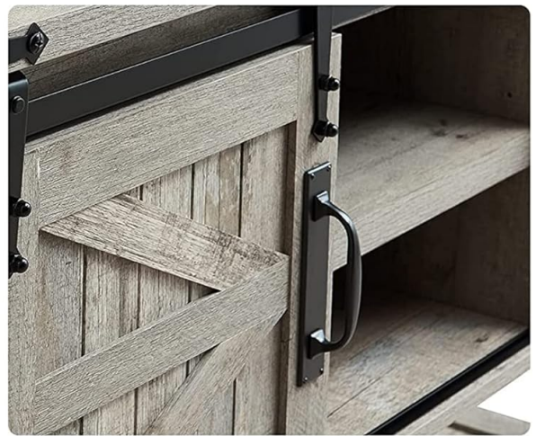
Powder Coated Metal Handle