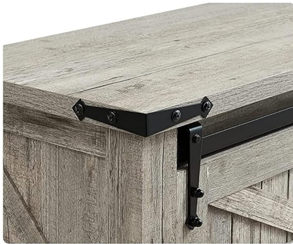
Metal Corner Decoration