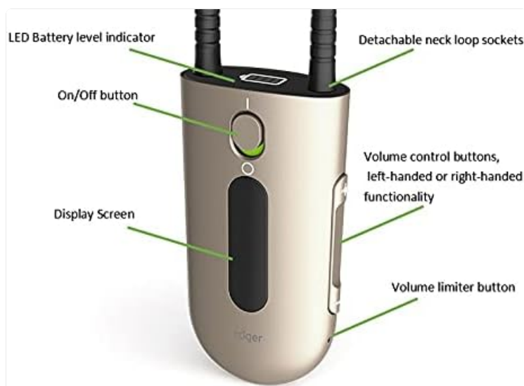
Figure 1: Detailed view of the Roger NeckLoop Receiver's controls and indicators.

Locate the On/Off button on the device. Press and hold the button for a few seconds until the LED indicator illuminates (for power on) or turns off (for power off). The LED will indicate the device's status.