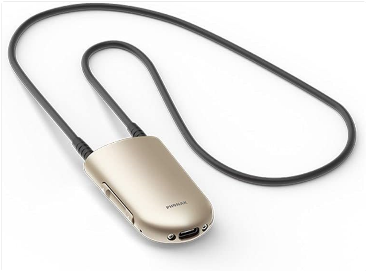
Figure 2: The Phonak Roger NeckLoop Receiver with its neck loop.