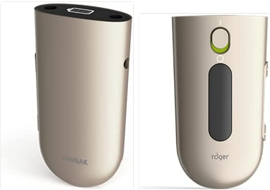
Figure 3: Additional views of the Roger NeckLoop Receiver.