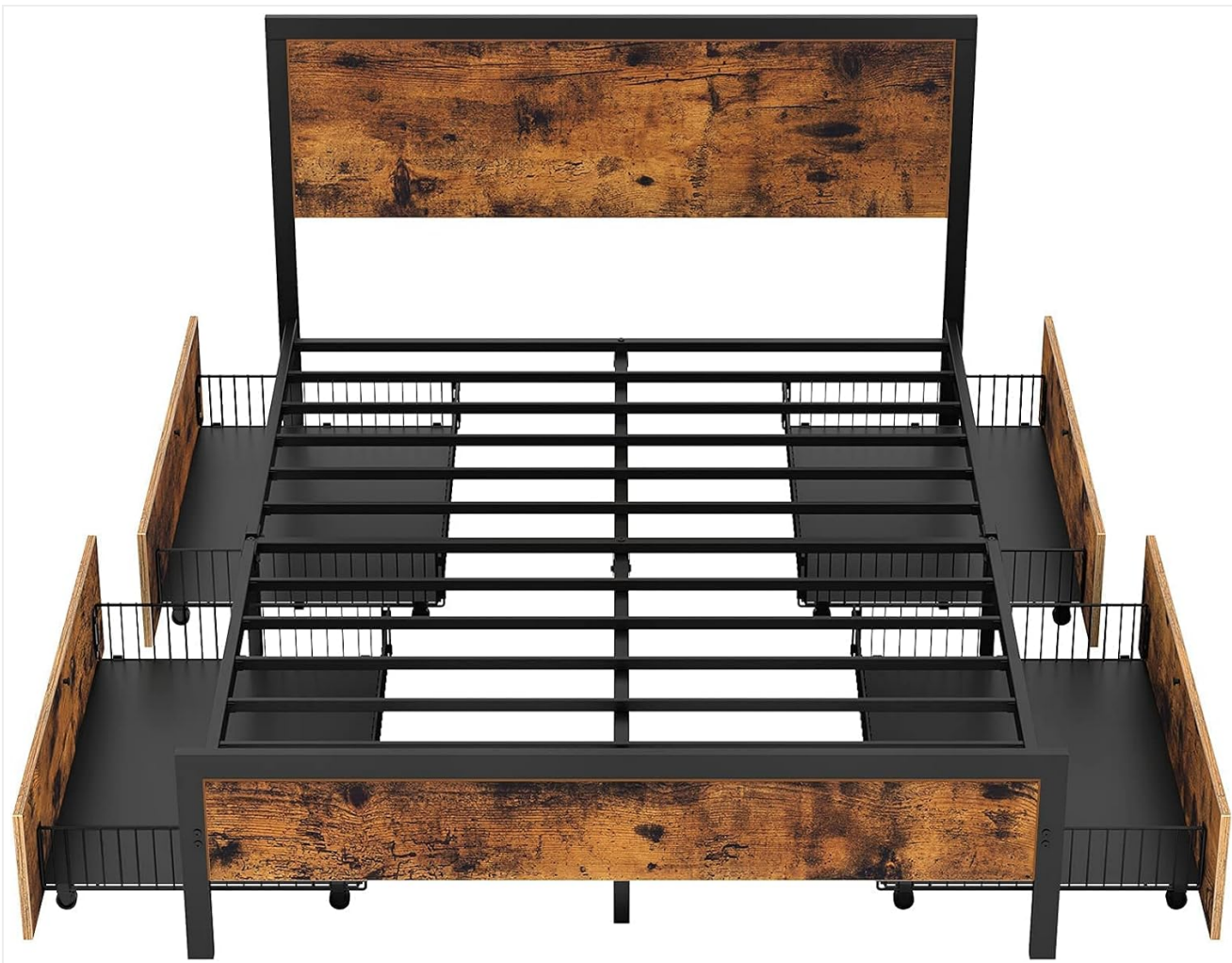
Figure 1: Fully assembled Rolanstar Queen Size Bed Frame with 4 drawers.

The Rolanstar Queen Size Bed Frame is engineered to provide robust support for your mattress without the need for a box spring. Its design incorporates a rustic brown particle board headboard and footboard, complemented by a black powder-coated metal frame. Key features include: