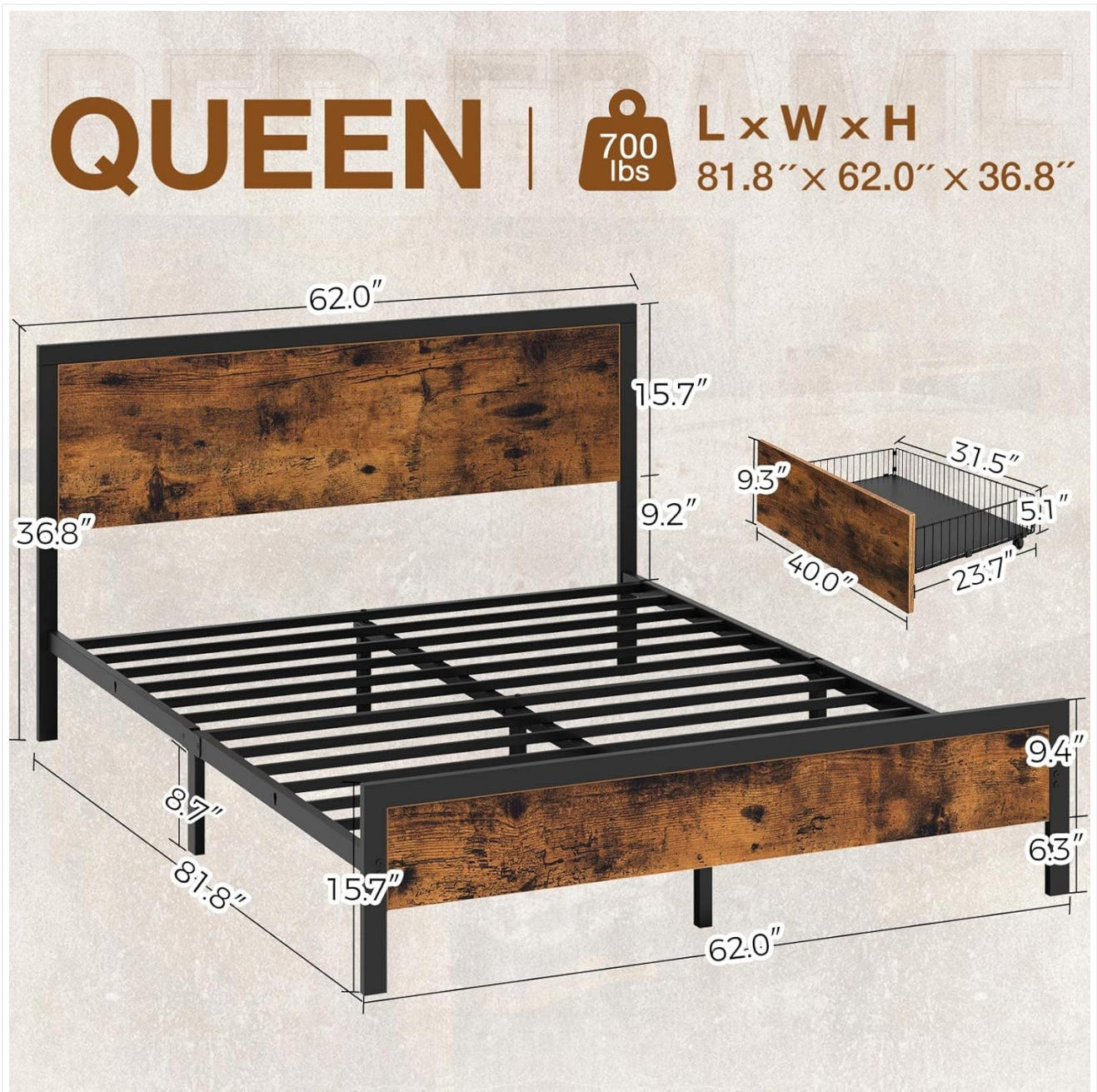
Figure 3: Bed frame with one storage drawer pulled out, showcasing the ample storage space.