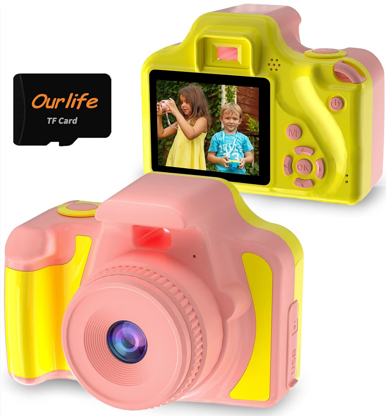
Image: Front and back view of the Ourlife Kids Camera in pink and yellow, alongside an Ourlife TF Card.