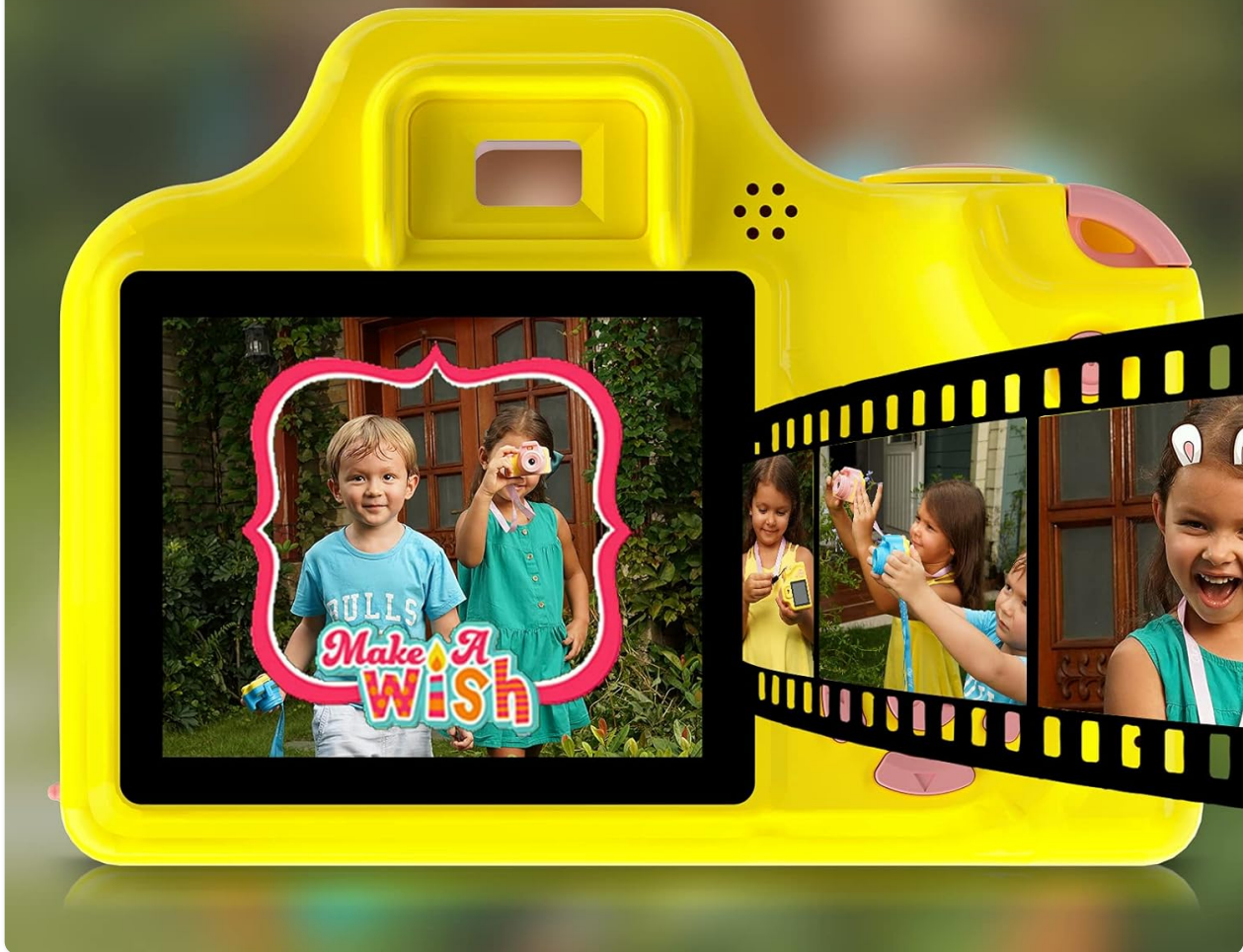
Image: The camera screen showcasing a photo of two children with a 'Make A Wish' frame applied, illustrating the funny frames feature.