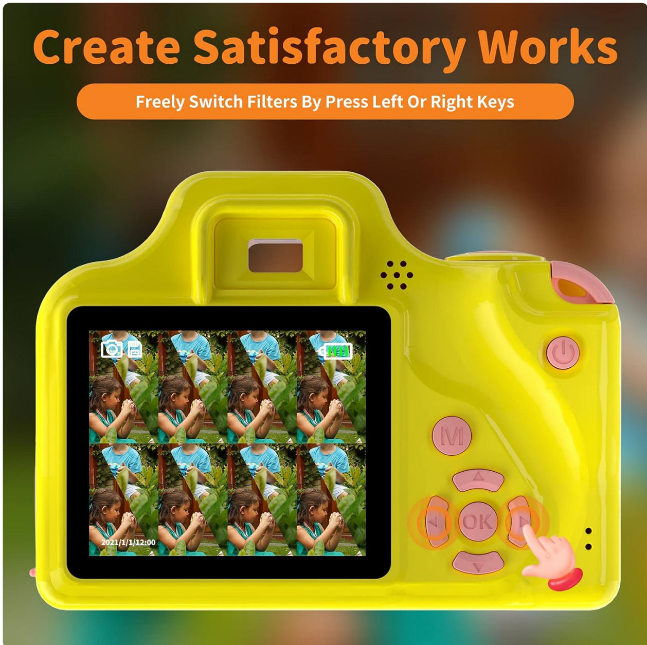
Image: The camera screen showing a grid of images with various filters applied, demonstrating the creative effects.

While in photo mode, use the left and right navigation buttons to cycle through 8 special effects filters and 10 funny frames. These effects are applied in real-time on the screen.