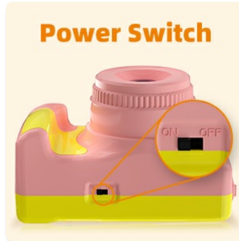
Image: Close-up view of the camera's bottom, highlighting the power switch.

Before first use, locate the battery protection switch at the bottom of the camera. Slide it to the 'ON' position. Then, fully charge the camera using the provided USB cable. The charging port is located on the side of the camera.