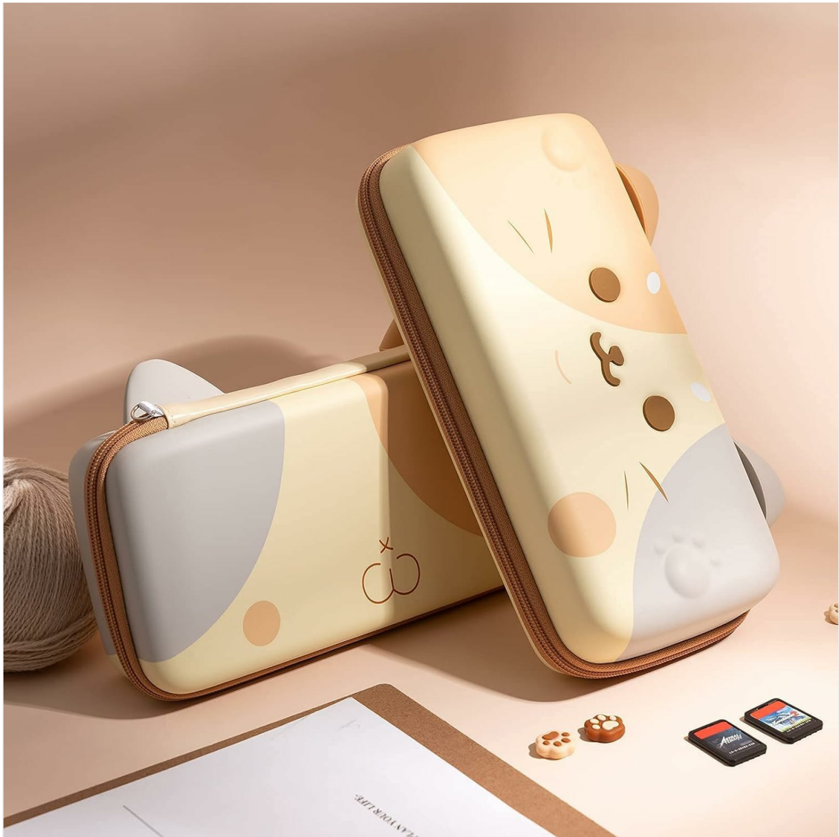
Figure 6: Back view of the case, showing the smooth surface for easy cleaning.