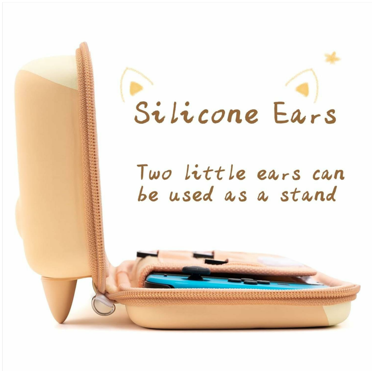
Figure 2: The case opened, revealing the console compartment and game card slots.