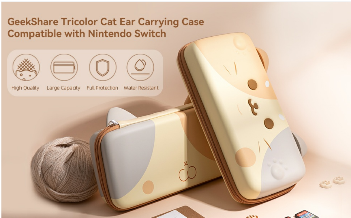
Figure 5: The case demonstrating the use of its cat ears as a stand.