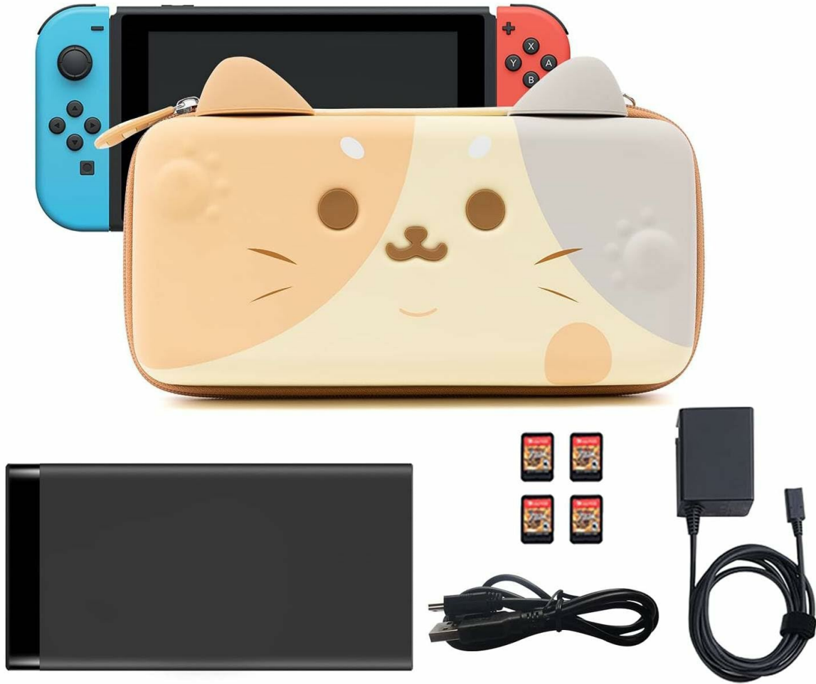
Figure 3: The case demonstrating its capacity to hold a console, game cards, and various accessories.