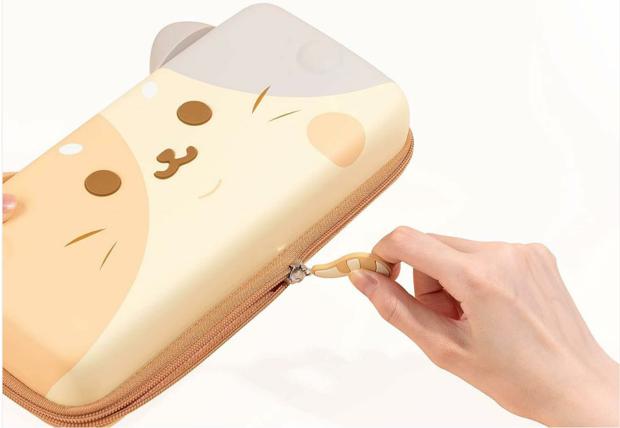
Figure 4: Detail of the cat tail zipper pull.