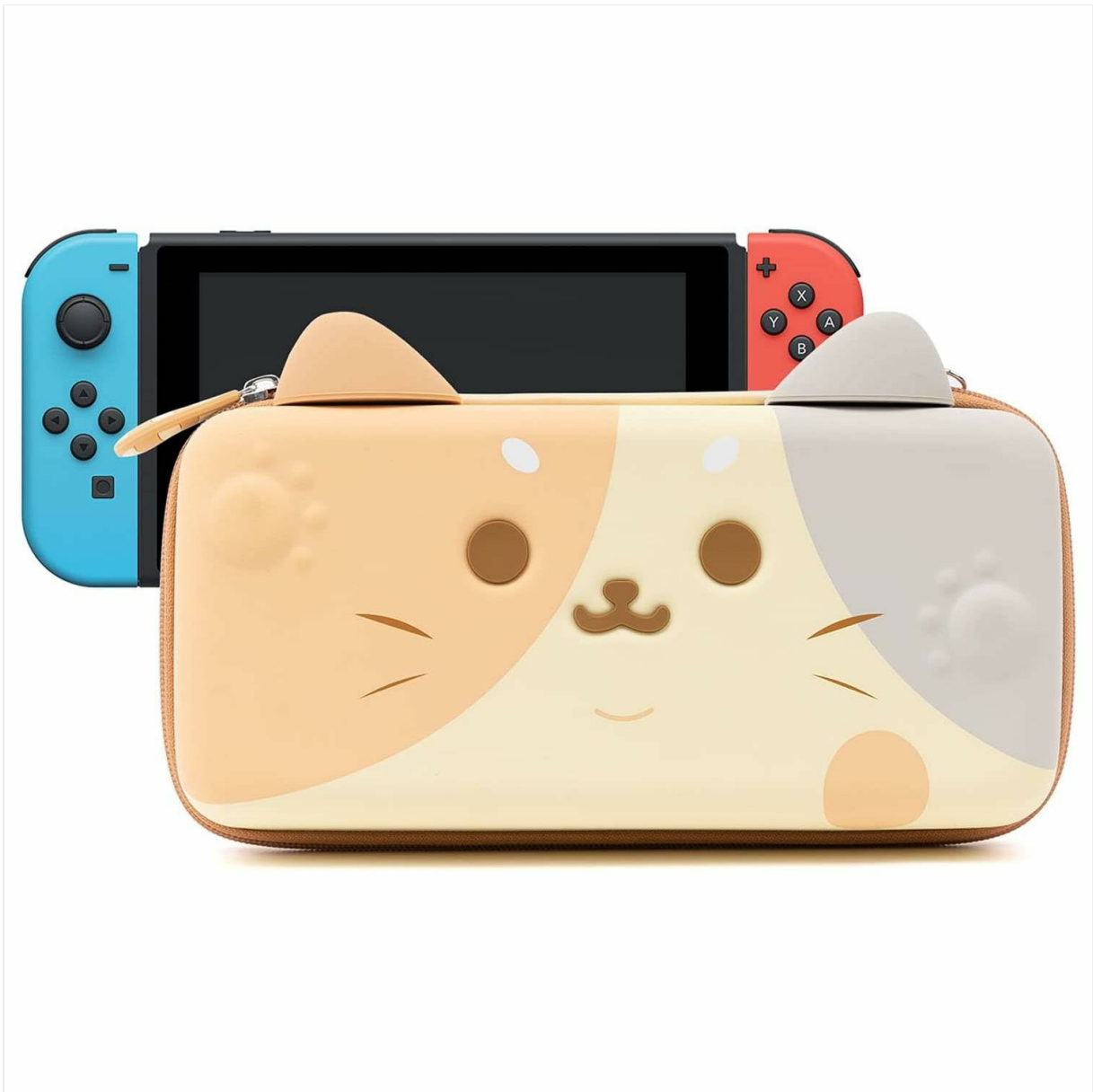
Figure 1: Front view of the GeekShare Cat Ears Carry Case.