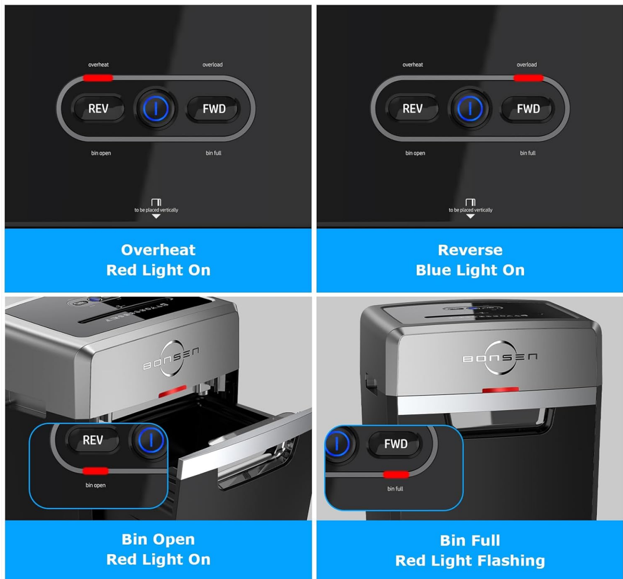
Image: Close-up of the BONSEN S3105 control panel showing Power On, Forward, Reverse buttons and LED indicators for Overheat, Overload, Bin Open, and Bin Full.