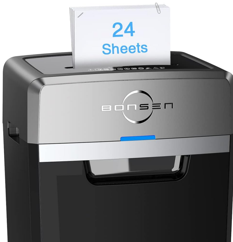
Image: Illustration of the BONSEN S3105 shredding various materials including paper, junk mail, staples/clips, CDs, and credit cards, highlighting its 24-sheet capacity.