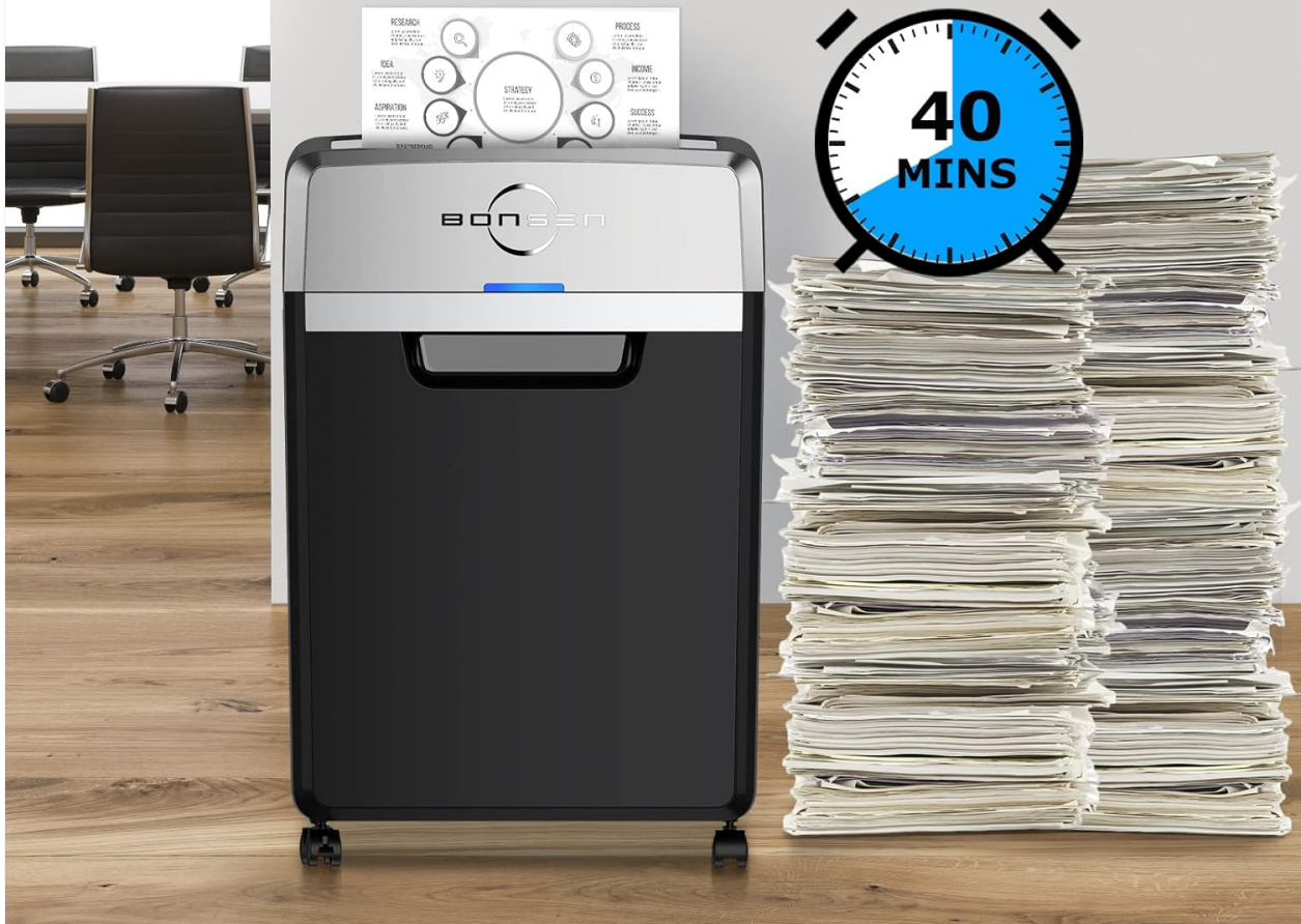
Image: The BONSEN S3105 shredder in an office setting, with an infographic indicating 40 minutes of continuous shredding time, capable of shredding over 5200 sheets.

Over 5200 sheets of A4 paper can be shredded in 40 minutes