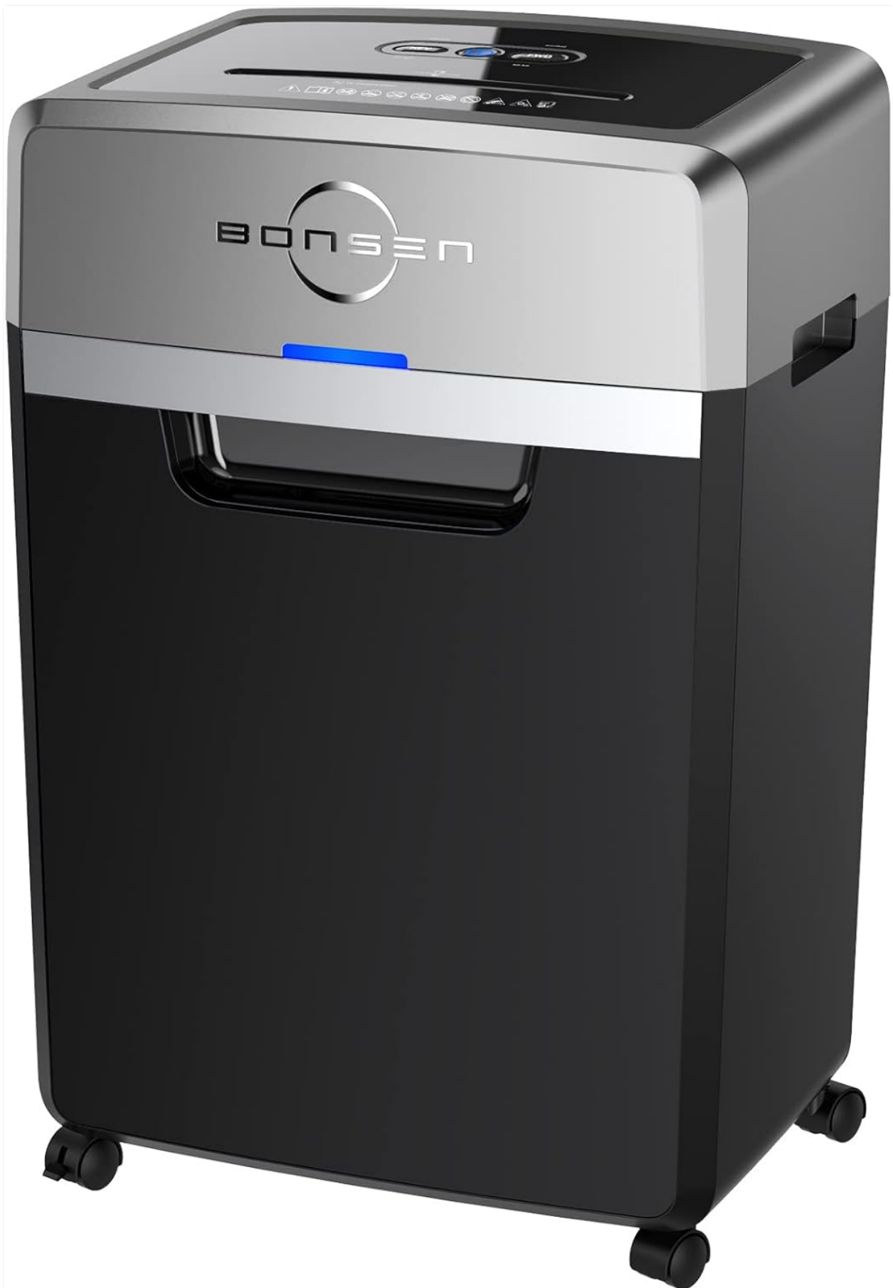
Image: The BONSEN S3105 Heavy Duty Paper Shredder, a black and silver unit with casters.