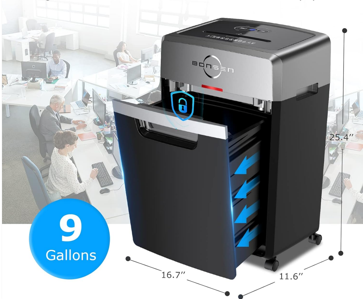
Image: The BONSEN S3105 shredder with its 9-gallon pull-out bin extended, illustrating its large capacity and ease of emptying.

9 gallons wastebasket can hold 650 sheets of A4 paper