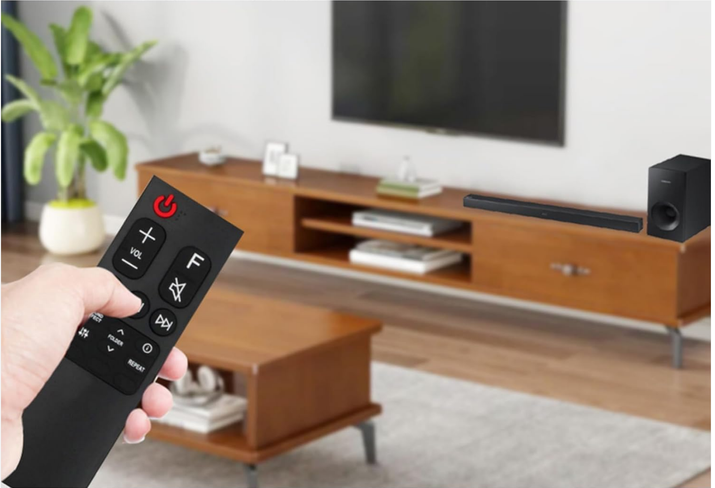
Figure 4.1: Illustrative image of the remote control being used in a home entertainment setup with an LG Sound Bar. This demonstrates the typical usage scenario.