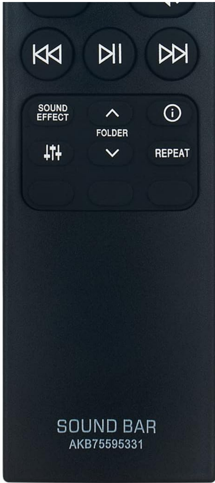
Figure 2.1: Front view of the AKB75595331 Replacement Remote Control. This image shows the remote's layout with all buttons clearly visible, including power, volume, playback, and function buttons.