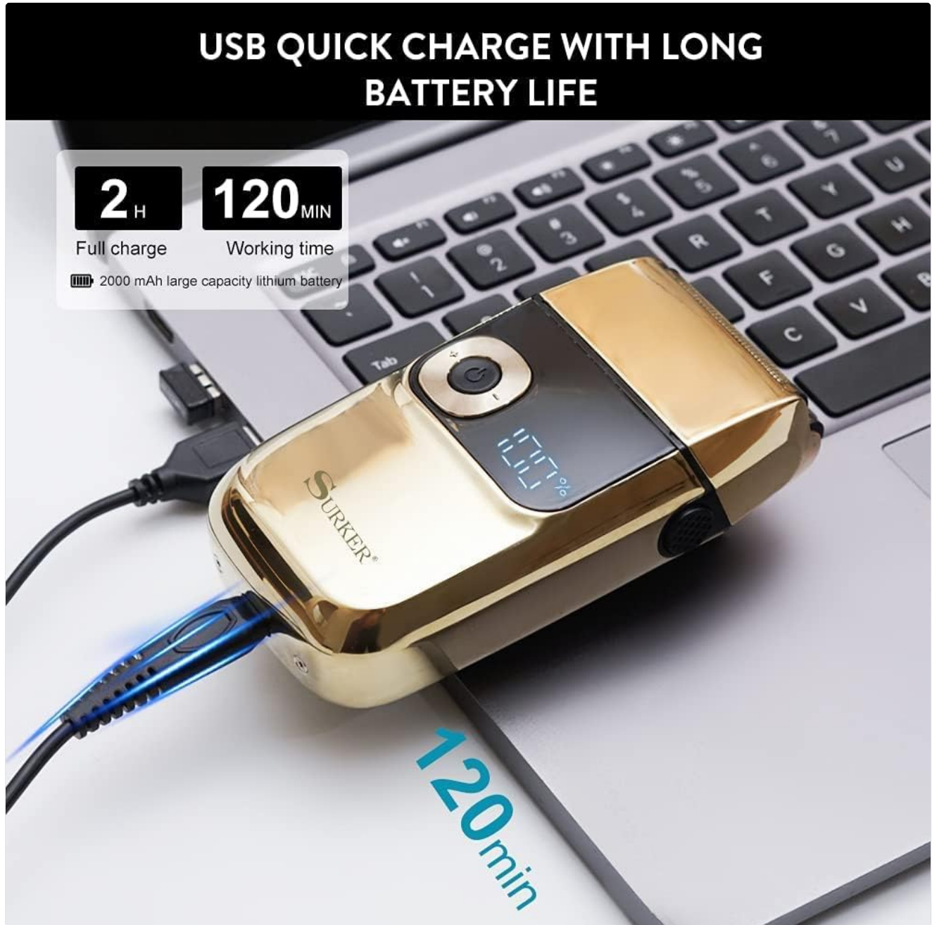
Image: The shaver being charged via USB, illustrating the quick charge capability.

Before first use, fully charge the shaver. Connect the USB charging cable to the shaver's charging port and plug the other end into a compatible USB power source (e.g., computer, wall adapter).