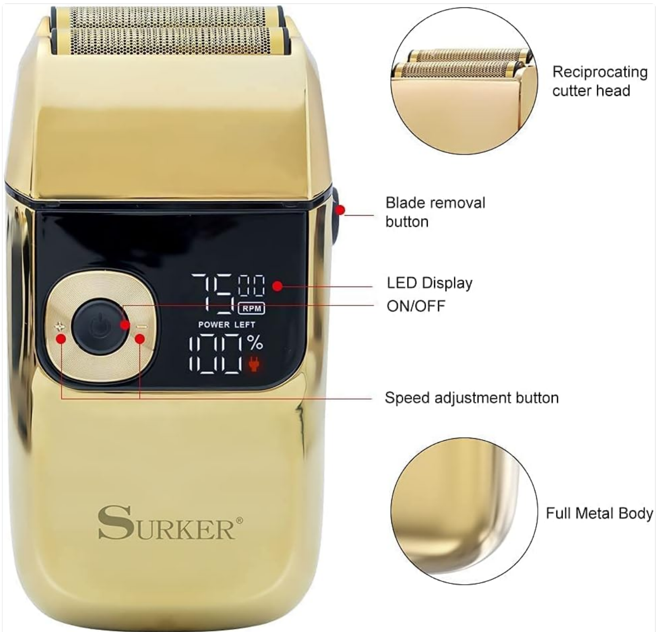
Image: Annotated diagram showing the key components of the shaver.