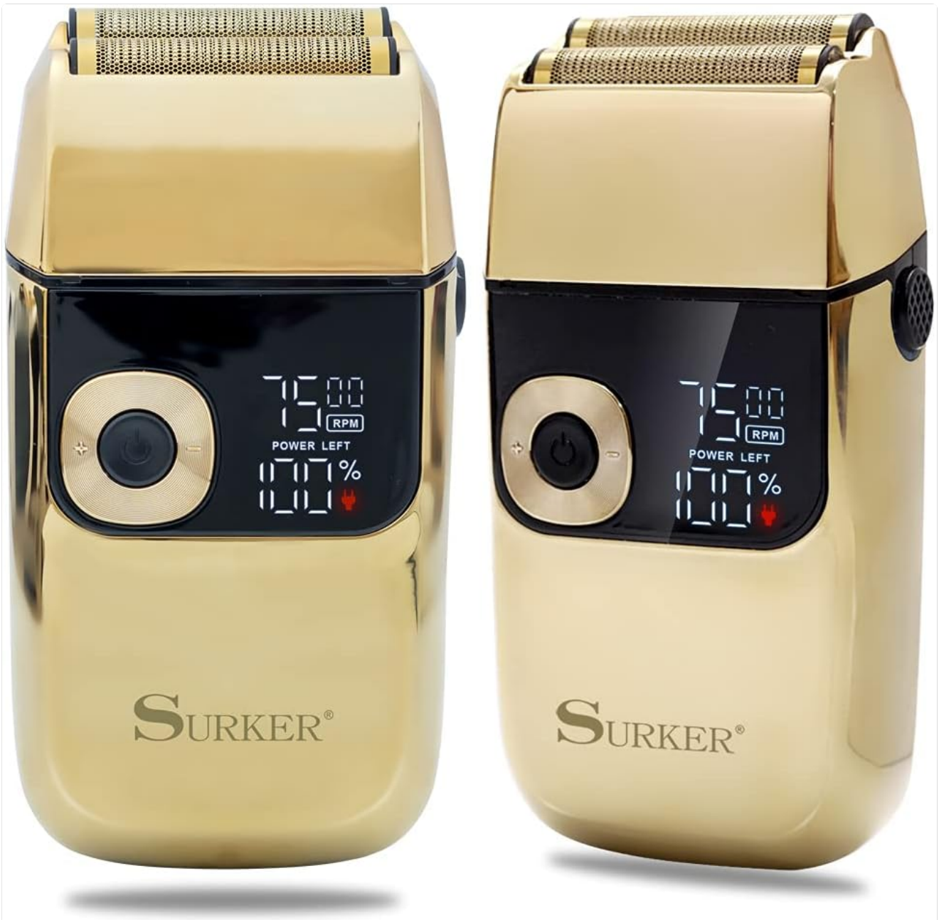
Image: Front view of the Surker Electric Shaver, highlighting its sleek design and digital display.