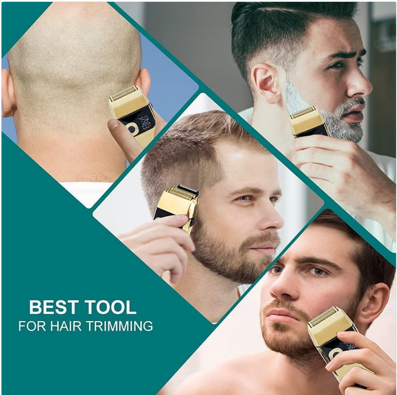
Image: Examples of the shaver's versatile use for head and facial hair trimming.