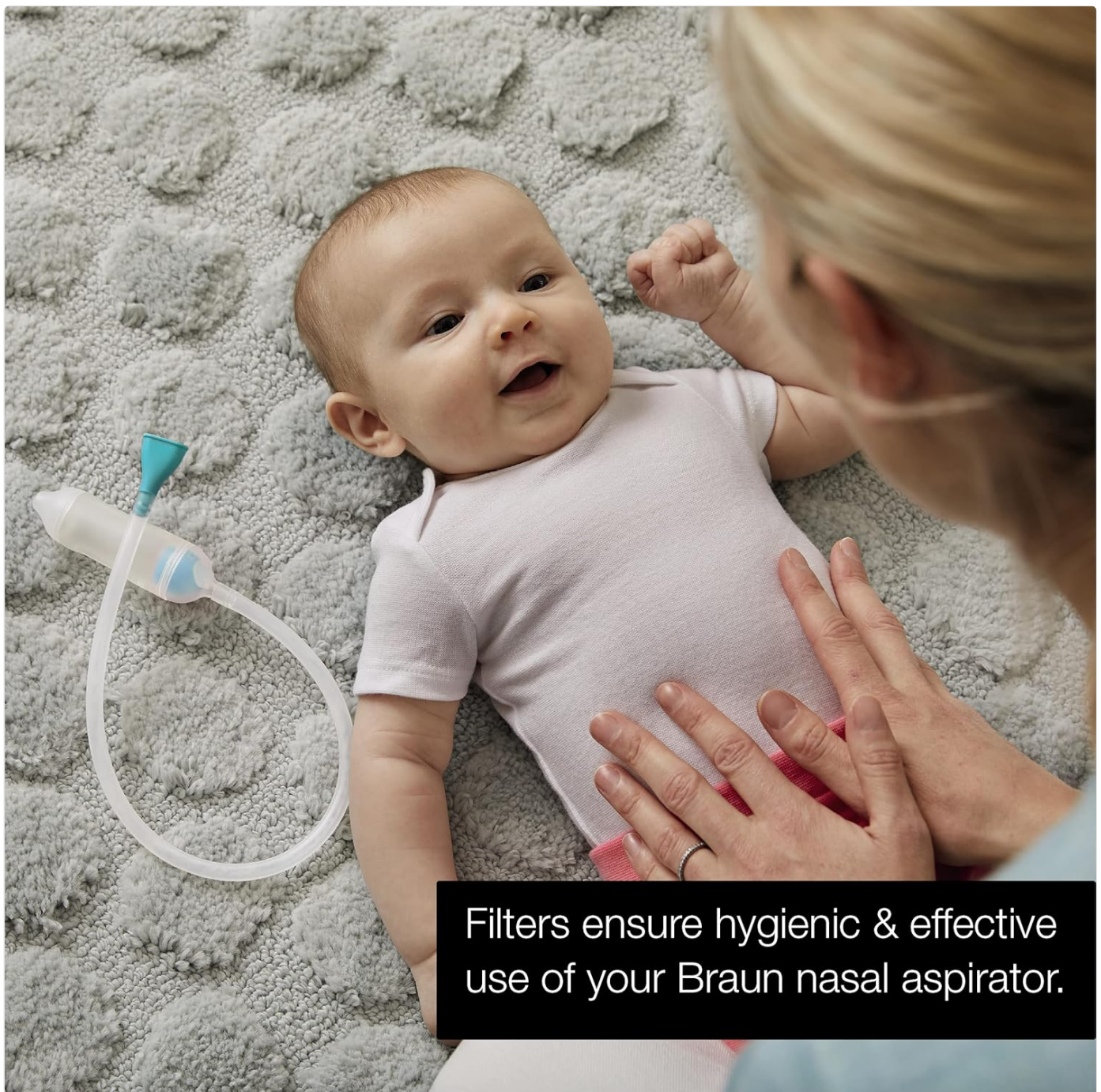
Image: Baby with Braun nasal aspirator, showing filter function. This image illustrates how the filters ensure hygienic and effective use of the Braun nasal aspirator by capturing mucus.