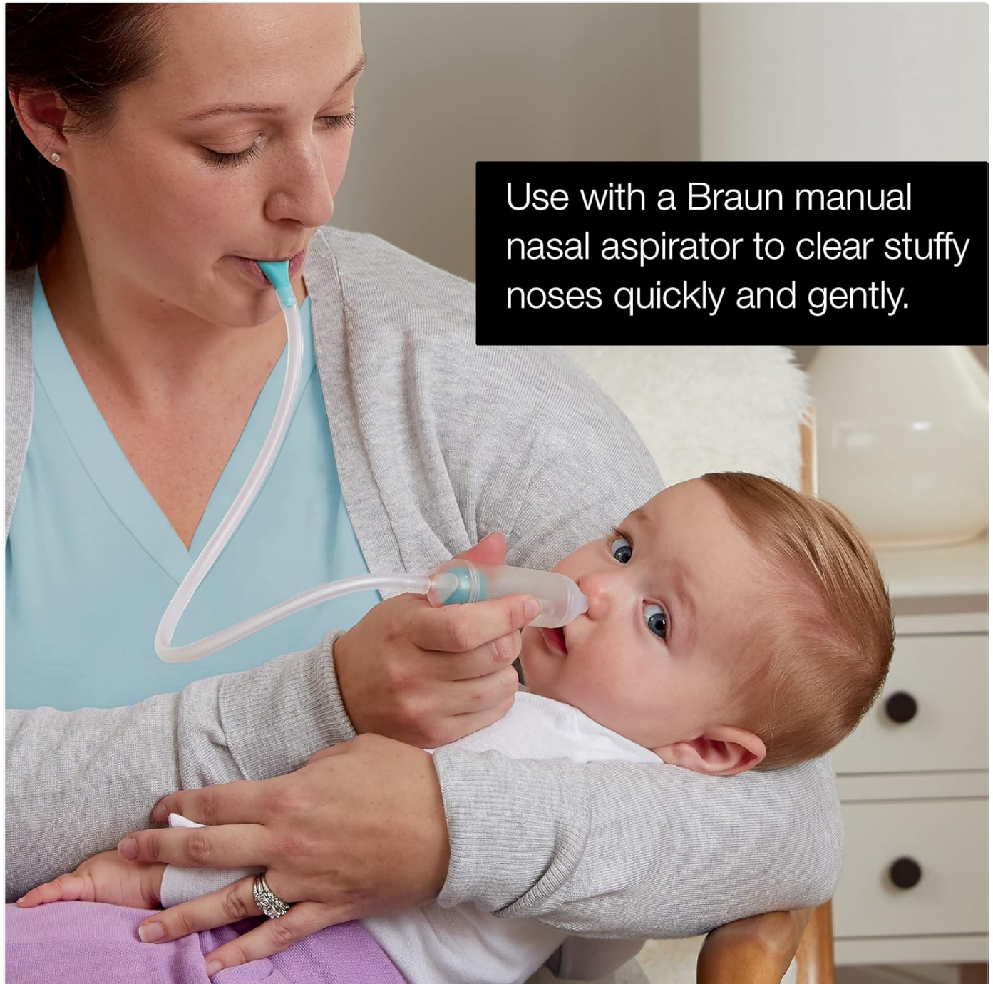
Image: Mother using Braun manual nasal aspirator on baby. This image shows a mother gently using the Braun manual nasal aspirator to clear her baby's stuffy nose, demonstrating the product in action.