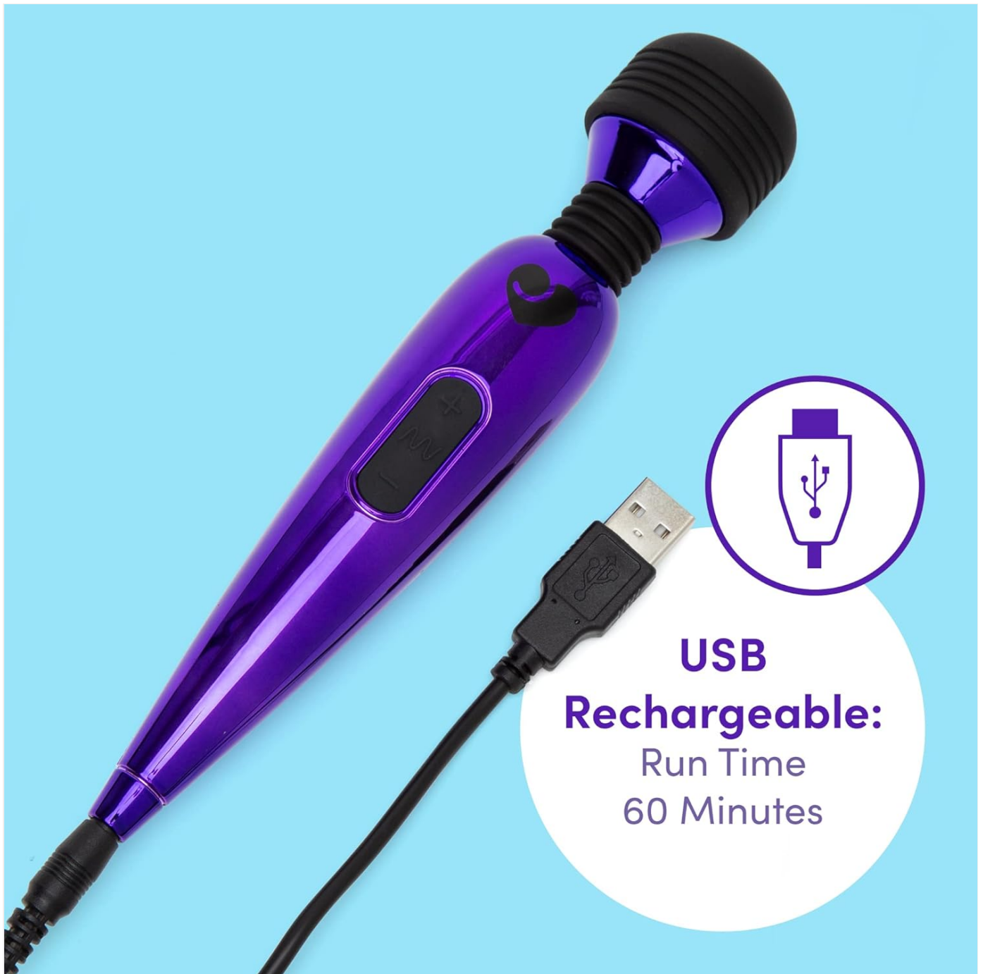
Image 3.1: The purple massage wand shown with its USB charging cable connected, illustrating the charging process.