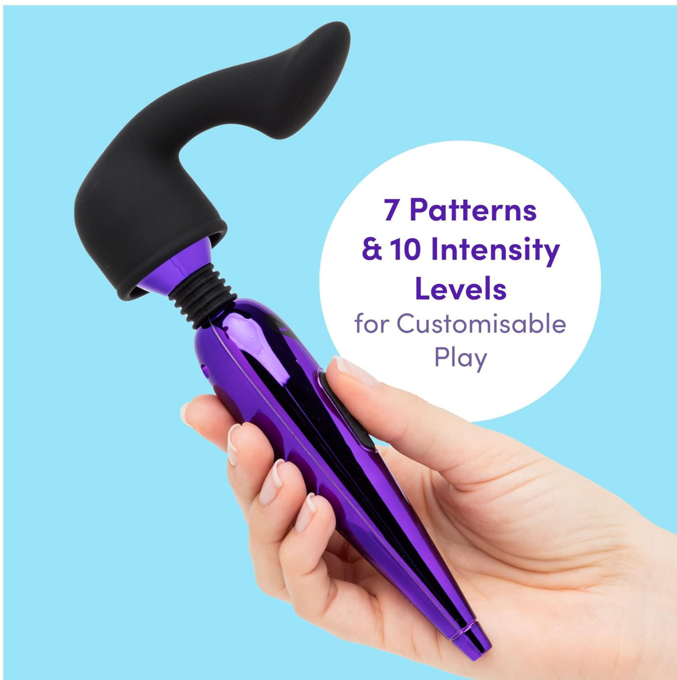
Image 4.1: A hand demonstrating how to hold the massage wand with an attachment, highlighting the control buttons.