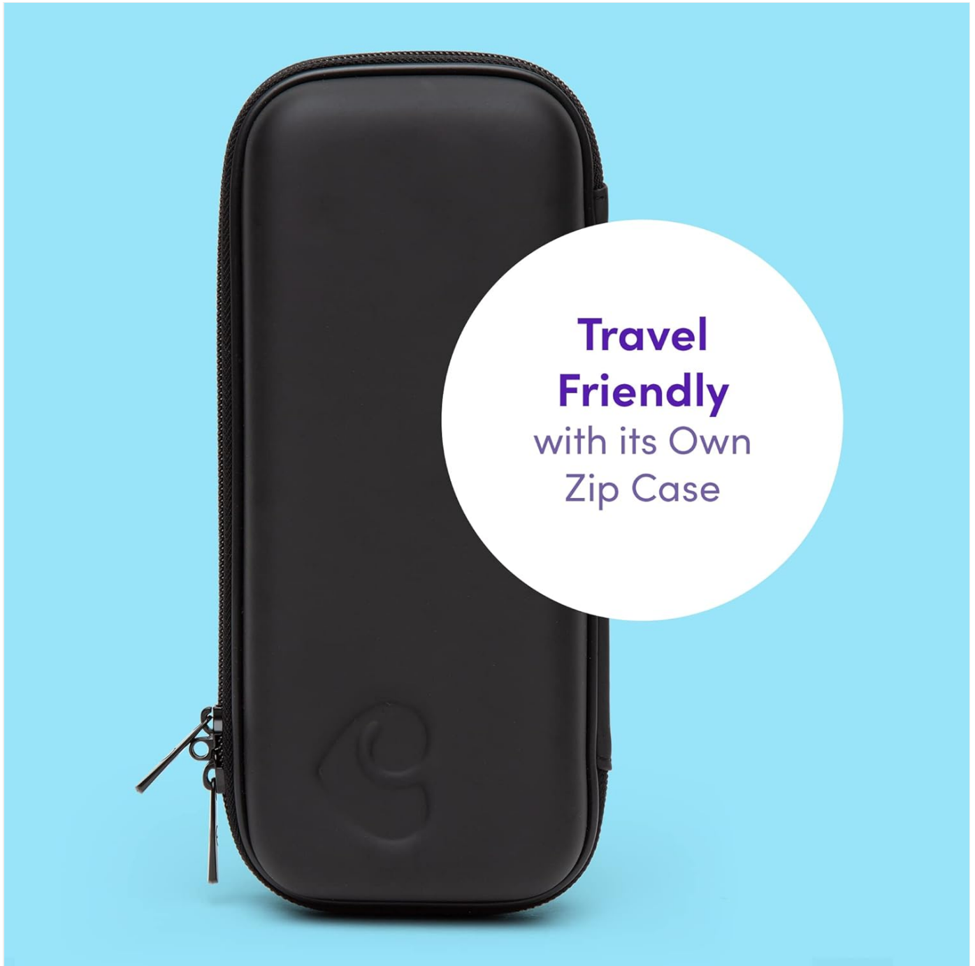
Image 7.1: The black zip travel case provided with the kit, ideal for storage and transport.