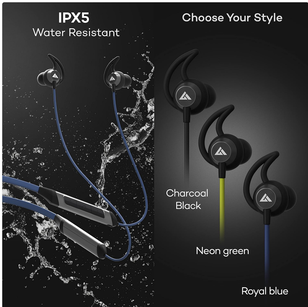
Figure 5: IPX5 water resistance for durability during active use.