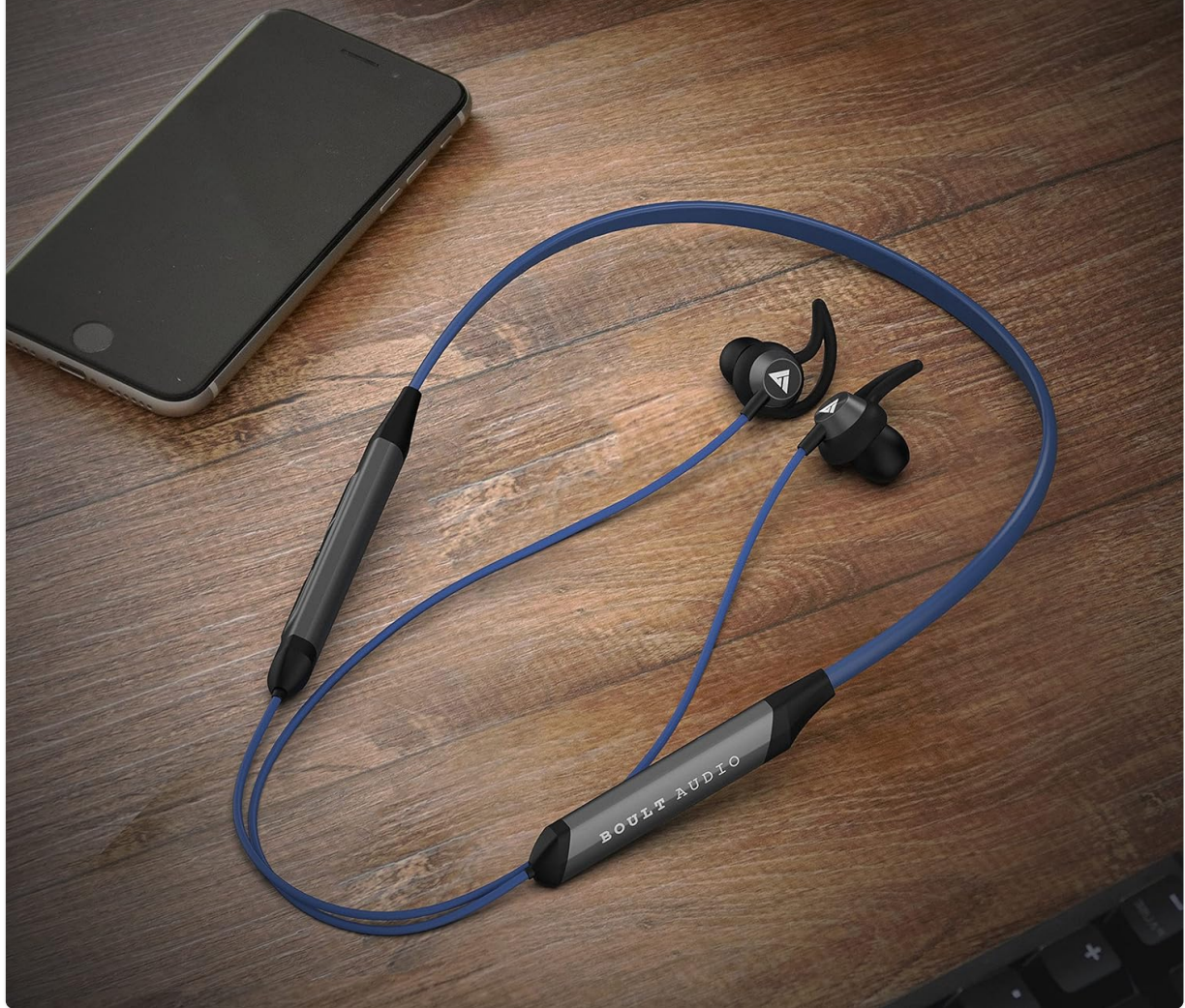
Figure 4: Ergonomic design for all-day wear.