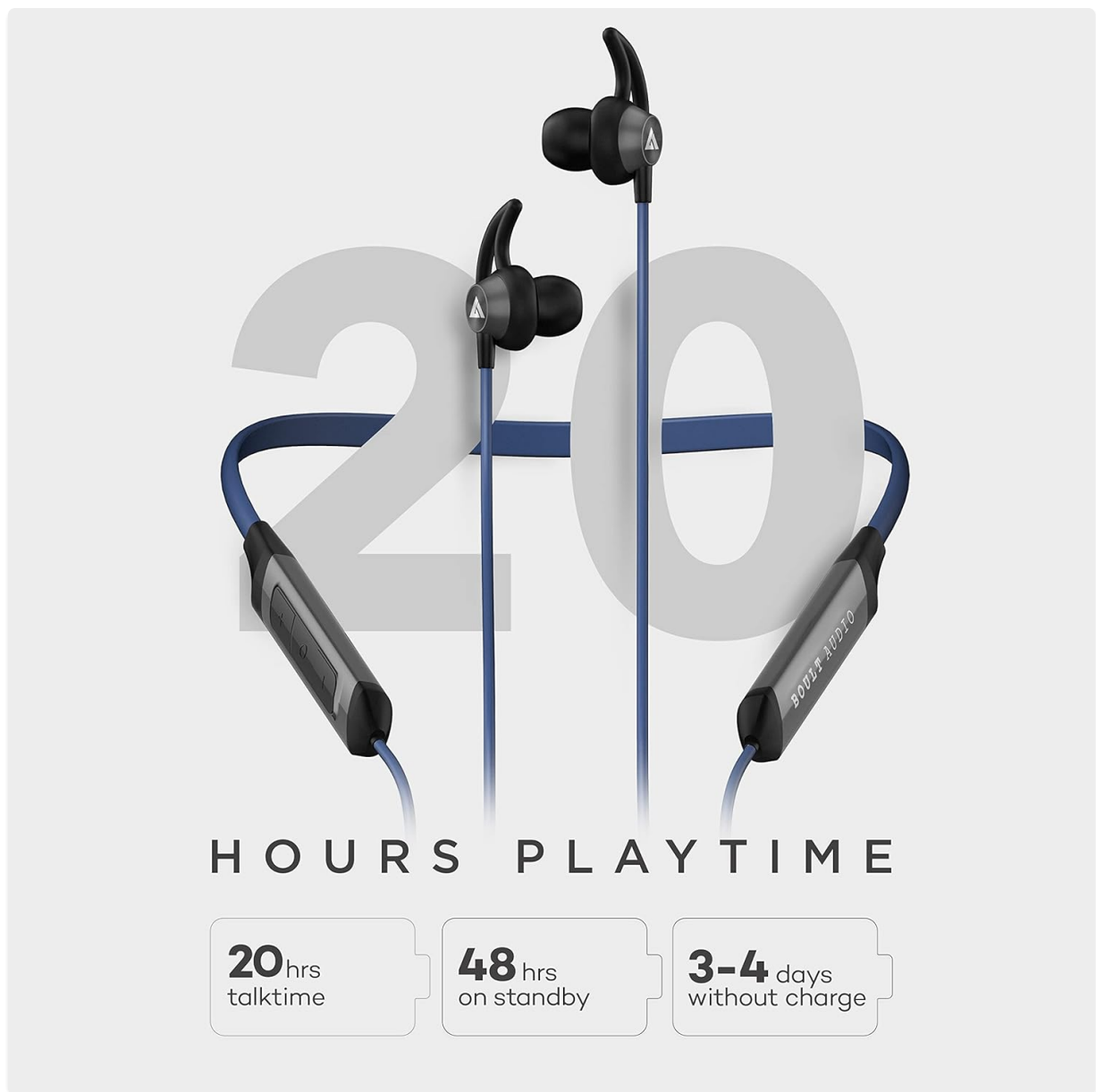
Figure 2: Battery life details for the GOBOULT Audio ProBass Qcharge earphones.