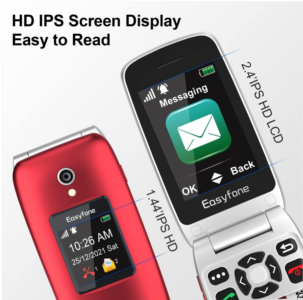
Image: The Easyfone Prime-A1 Pro phone is shown both open and closed, with callouts indicating the 2.4-inch main HD IPS LCD and 1.44-inch external HD IPS displays.