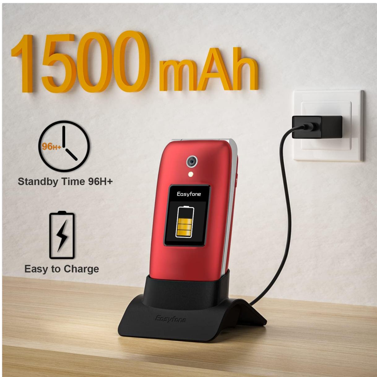
Image: The Easyfone Prime-A1 Pro phone is placed in its charging dock, connected to a wall charger. Text indicates 1500mAh battery and 96+ hours standby time.