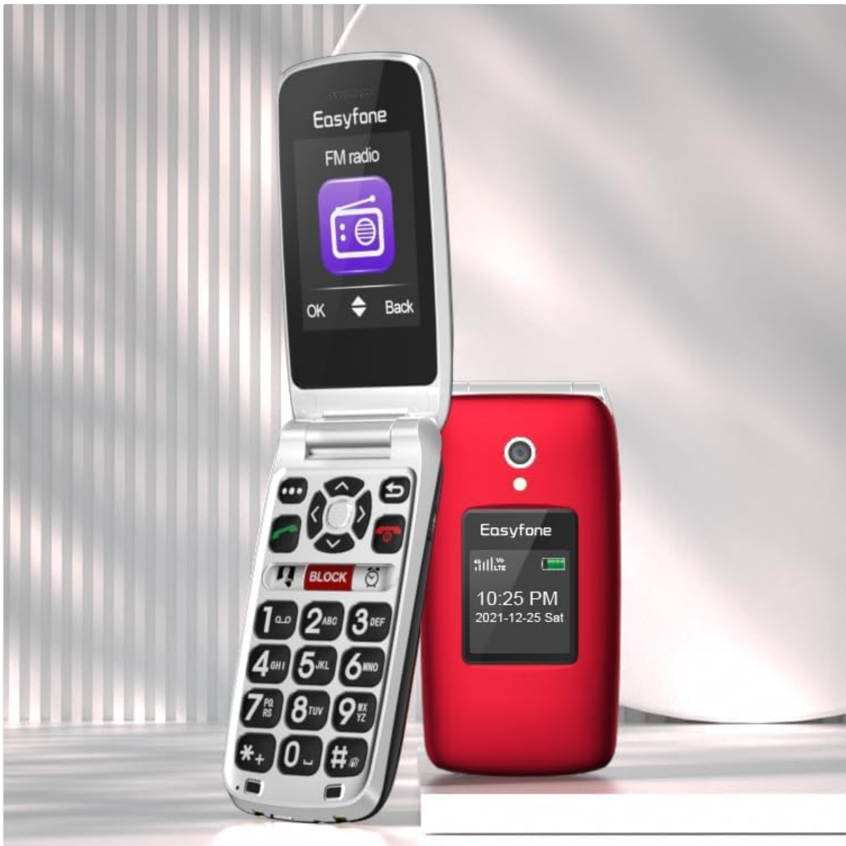
Image: The Easyfone Prime-A1 Pro phone is open, showing the main display with the FM radio application interface.