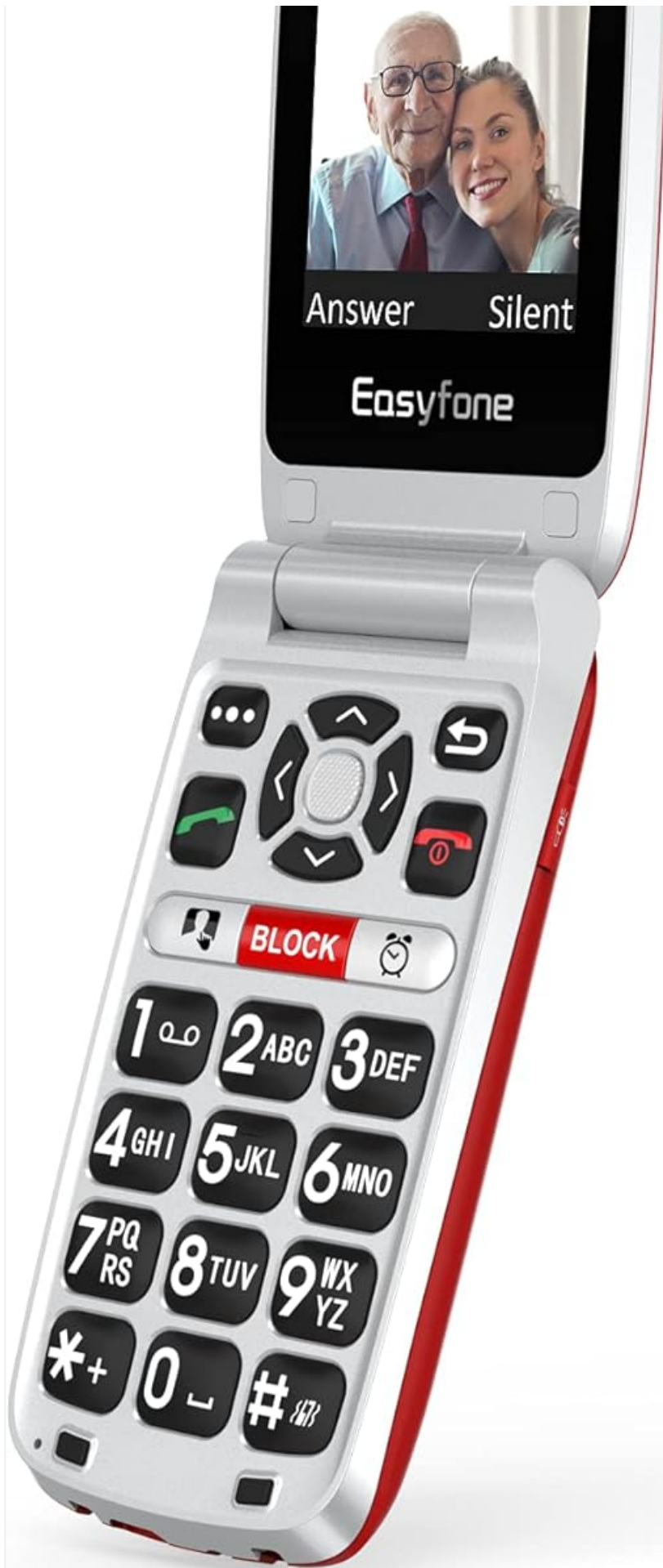
Image: The Easyfone Prime-A1 Pro phone is open, displaying an incoming call with a contact photo and the name 'Emma'. Options to 'Answer' or 'Silent' are visible.