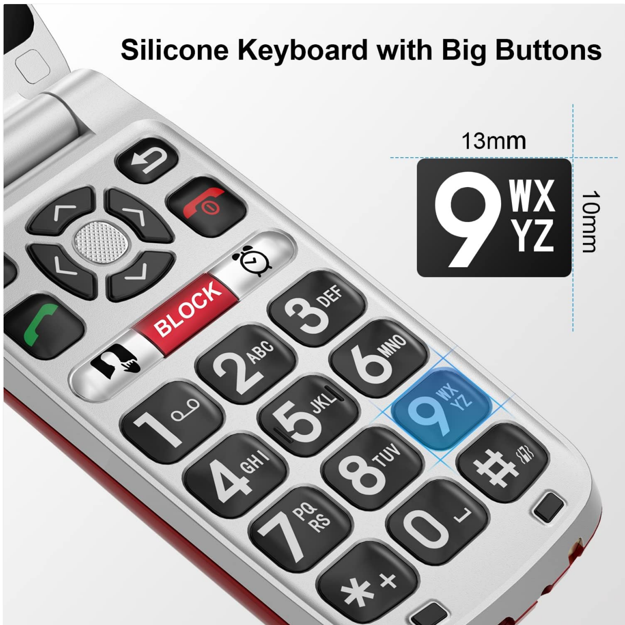
Image: A close-up view of the Easyfone Prime-A1 Pro's silicone keyboard, emphasizing the large, clearly labeled buttons for easy use.