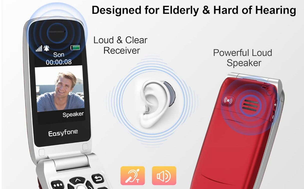
Image: The Easyfone Prime-A1 Pro phone is open, displaying a call screen with a speaker icon. A diagram next to it illustrates the loud and clear receiver and powerful loud speaker, emphasizing hearing aid compatibility.