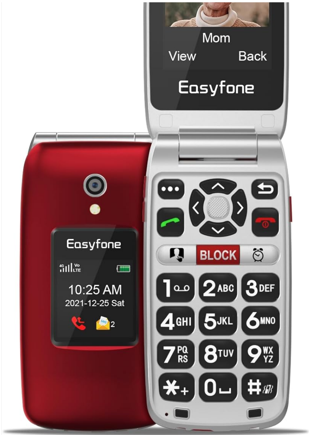
Image: The Easyfone Prime-A1 Pro phone is open, showing the main display with a speed dial contact. A photo of 'Mom' is displayed along with her name and the speed dial number.