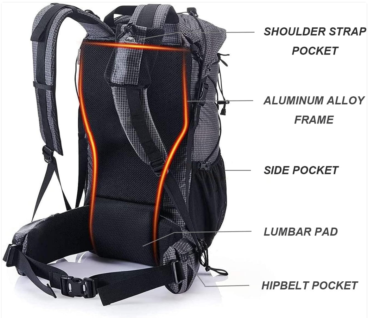
Image: Close-up of the backpack's back panel, detailing the aluminum alloy frame, shoulder strap pockets, lumbar pad, and hipbelt pockets.