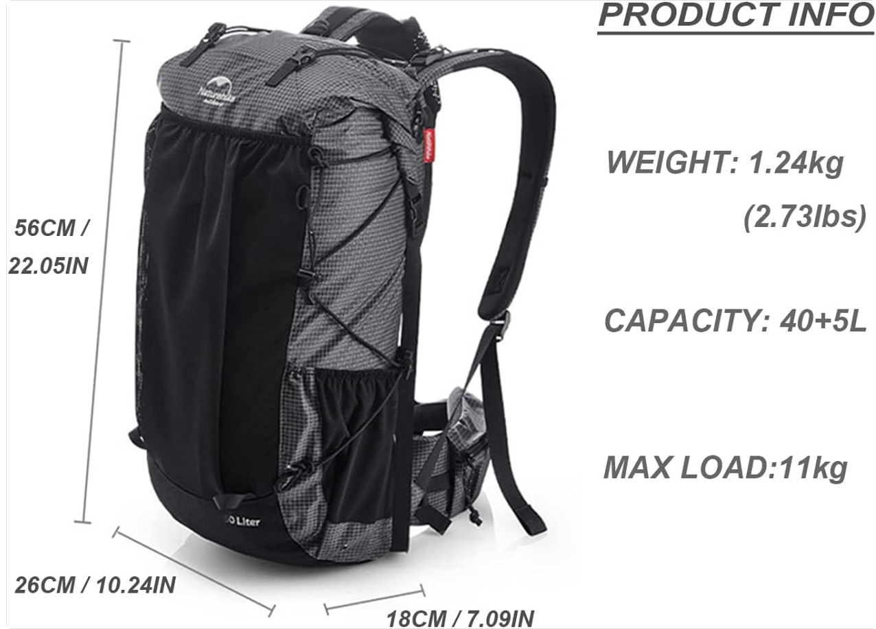
Image: Overview of the Naturehike Rock Series 45L Backpack, highlighting its dimensions (56cm height, 26cm width, 18cm depth), weight (1.24kg / 2.73lbs), capacity (40+5L), and maximum load (11kg).