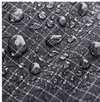
Image: A close-up shot of water droplets beading on the backpack's fabric, illustrating its water-repellent properties.