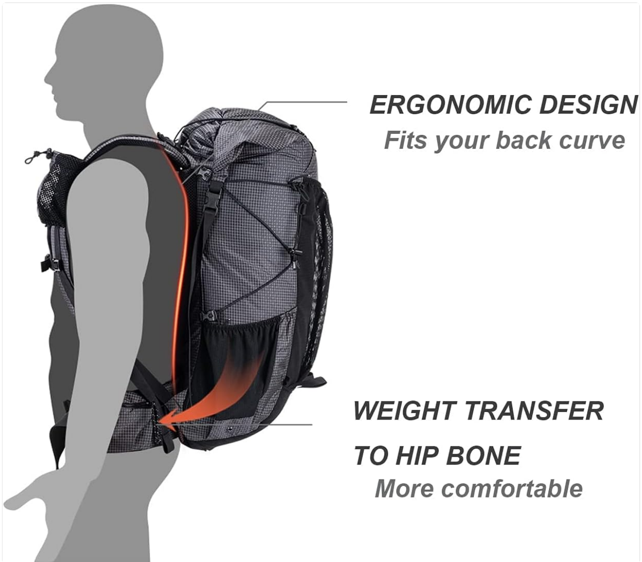
Image: Diagram illustrating the ergonomic design of the backpack, showing how it fits the back curve and transfers weight to the hip bones for improved comfort.