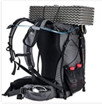
Image: A sleeping pad attached to the exterior of the backpack, showcasing its external carrying capabilities.