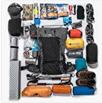
Image: An overhead view displaying a variety of camping gear, including a sleeping pad, tent, cooking equipment, and clothing, neatly organized within and around the backpack.