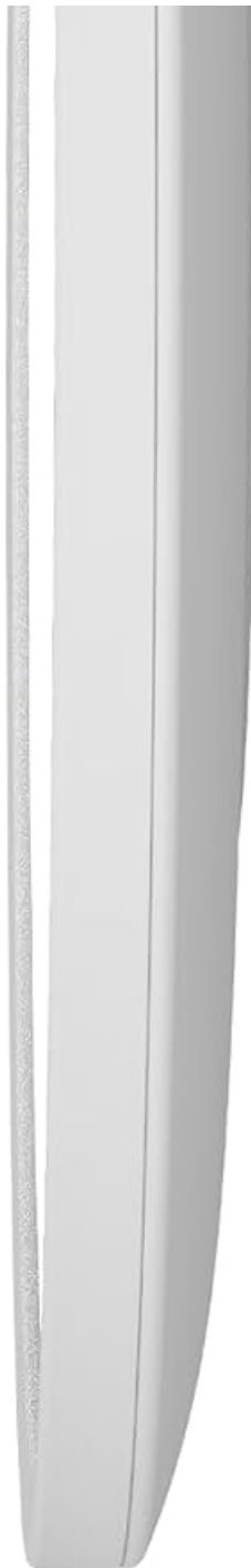
Image: Side profile of the Koda Slim LED Ceiling Light, illustrating its compact dimensions of 15 inches in diameter and 1.3 inches in thickness.