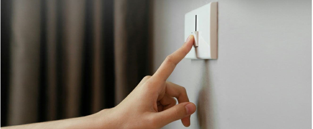
Image: A hand adjusting a standard dimmer switch, highlighting the light's compatibility with dimming controls.

Video: Koda Slim 15" LED Ceiling Light Product Features. This video showcases the key features of the light, including its slim design, brightness, adjustable color temperature, and dimming capabilities.