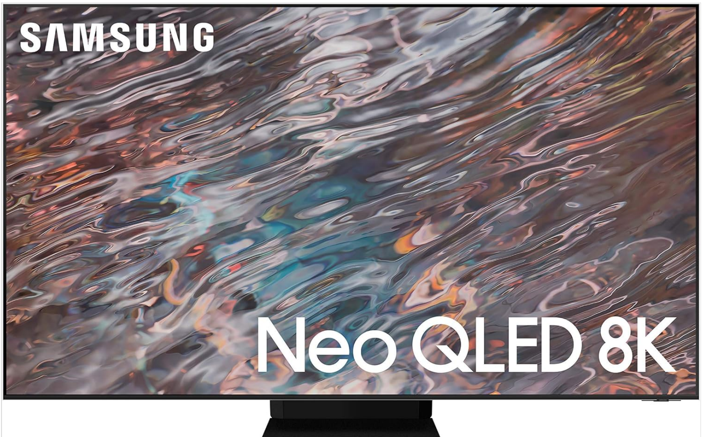
Image: Front view of the Samsung QN75QN800A 75-Inch Neo QLED 8K Smart TV, showcasing its sleek design and

This user manual provides comprehensive instructions for the setup, operation, and maintenance of your Samsung QN75QN800A 75-Inch Neo QLED 8K Smart TV. Please read this manual thoroughly before using the product to ensure safe and optimal performance. This pre-owned or refurbished product has been professionally inspected and tested to work and look like new, offering the same quality experience as a new device.