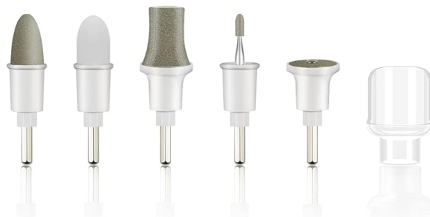
Image: Overview of the POLAMD BSR-MJQNB kit, showing the main unit, various drill bits, and charging cable.