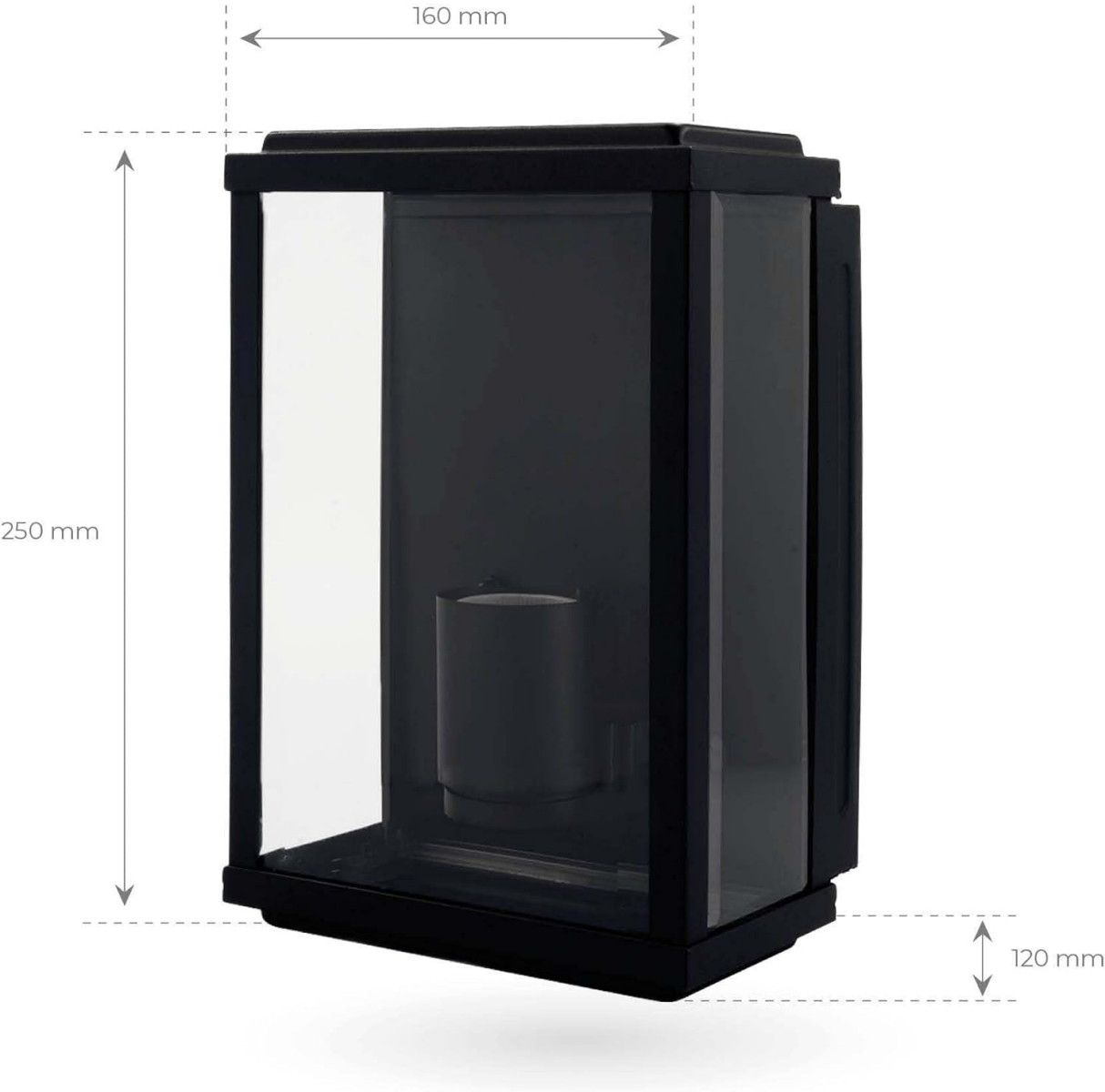
Image: Dimensional diagram of the Ledvion Lyra wall light, indicating its width, height, and depth.