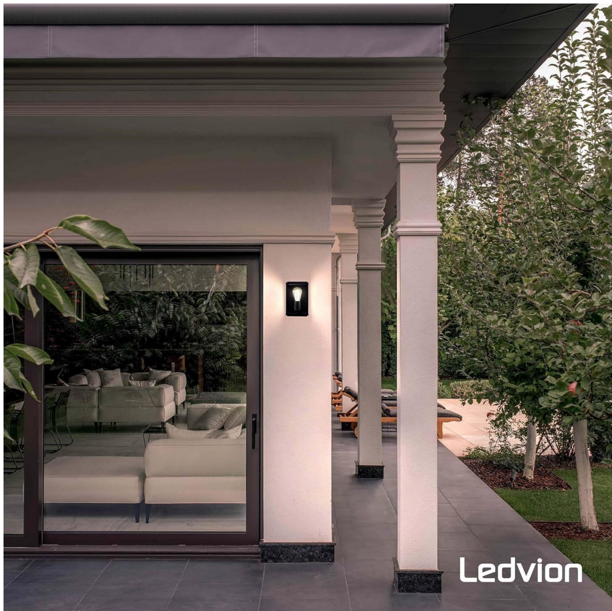
Image: The Ledvion Lyra LED Wall Light installed on an outdoor wall, providing illumination to a patio area.