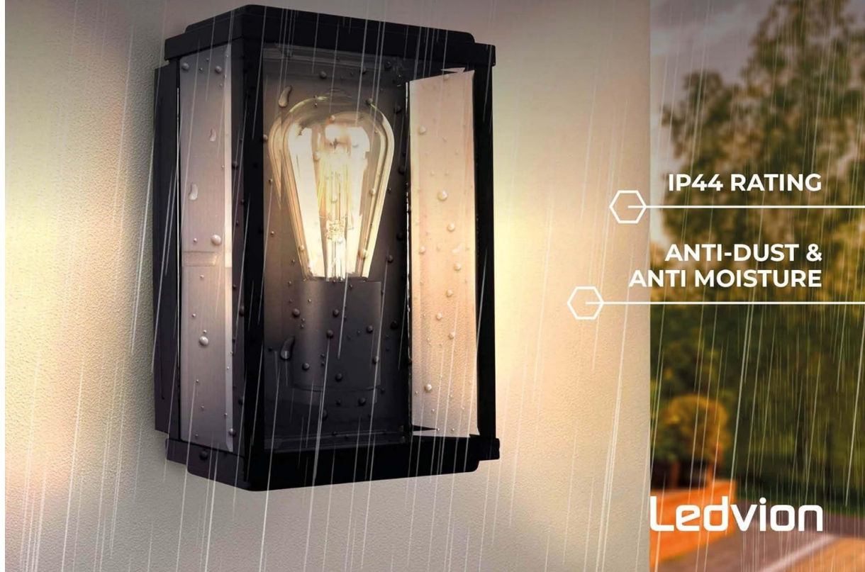
Image: The Ledvion Lyra wall light demonstrating its IP44 water and dust resistance in a simulated rainy environment.