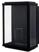
1x Wall lamp