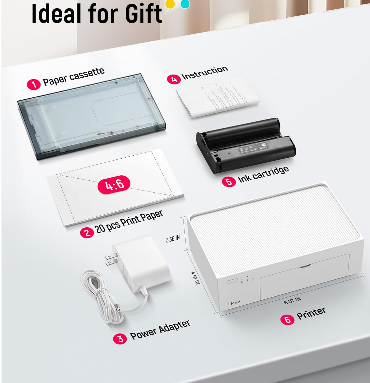
Figure 2: All essential components neatly packaged for your convenience.