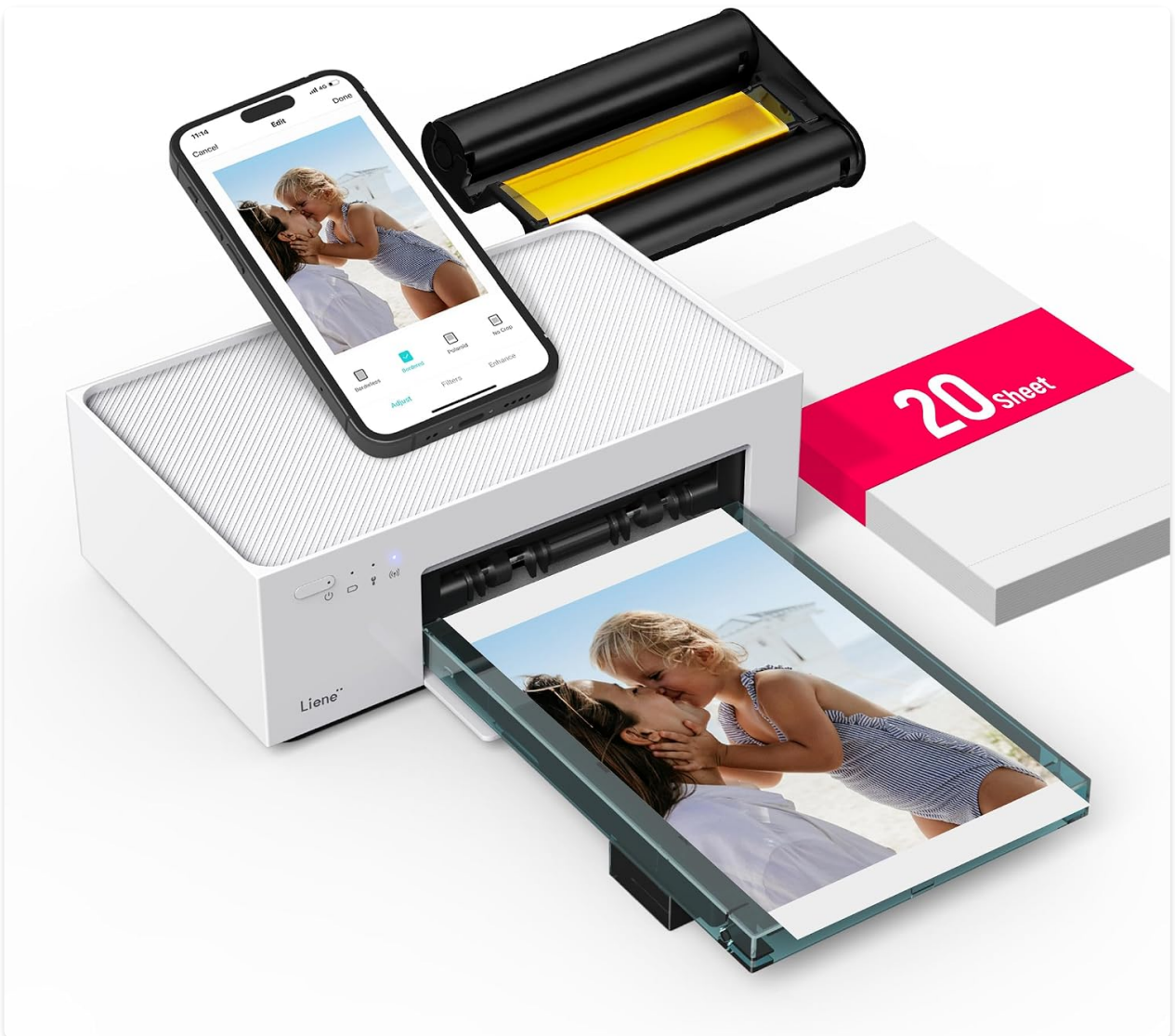
Figure 1: Liene 4x6 Photo Printer in operation, showcasing its compact design and ease of use with a smartphone.