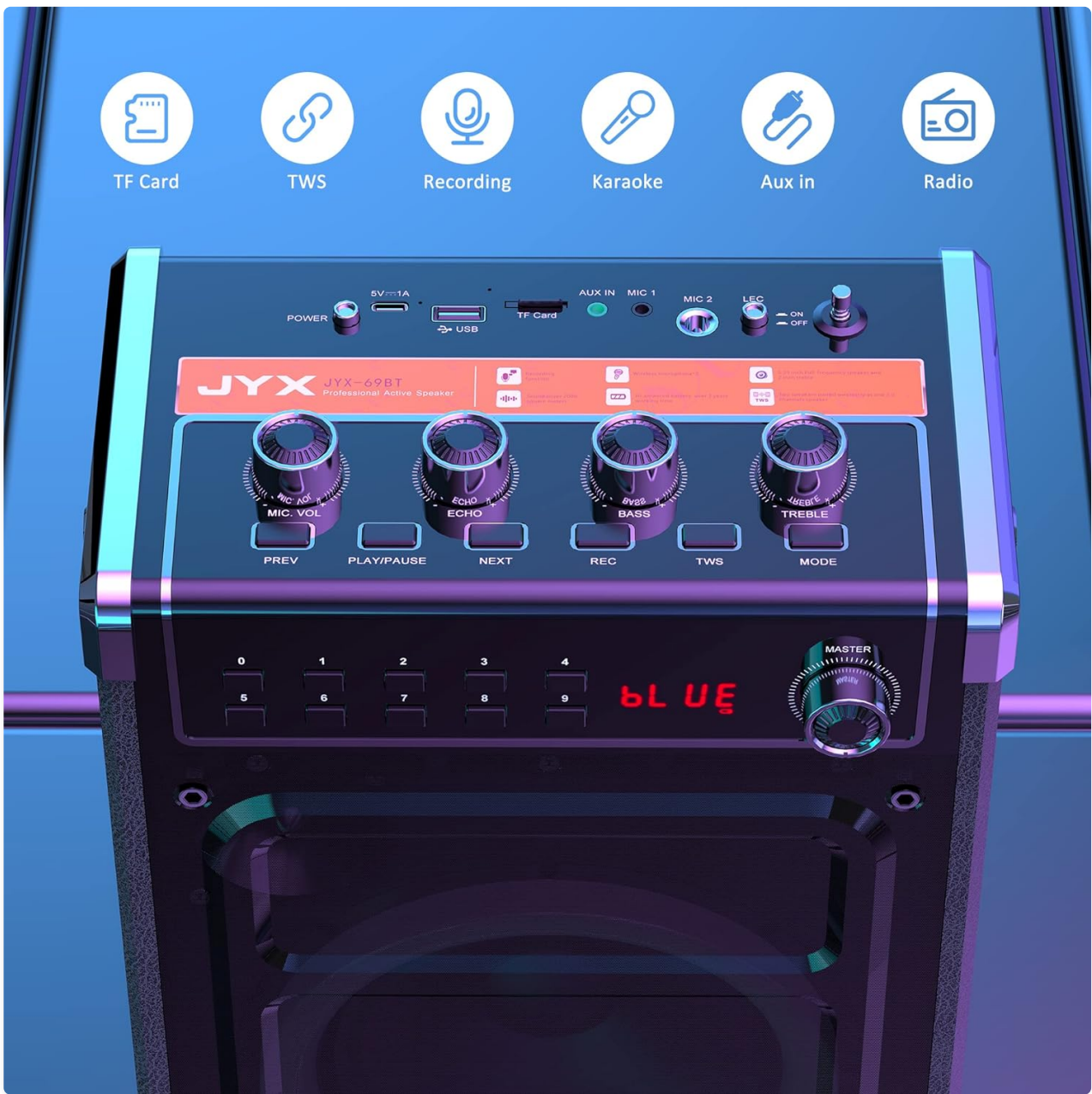
Figure 3.1: Top Control Panel.