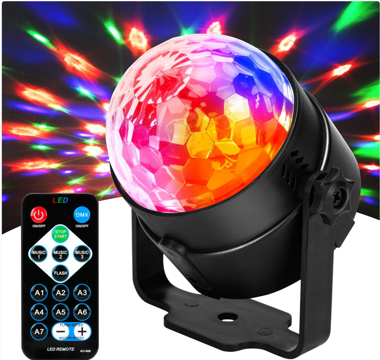
Figure 3.2: Disco Light Unit.

The disco light features multiple lighting patterns and sound-activated modes, controlled by its dedicated remote.