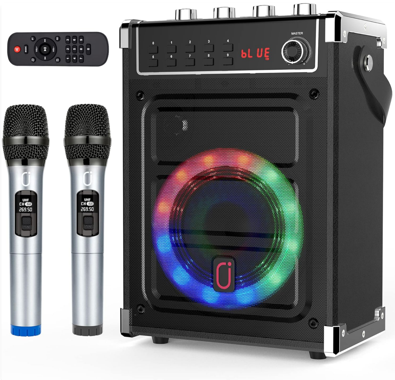
Figure 2.1: Main unit with wireless microphones and remote control.