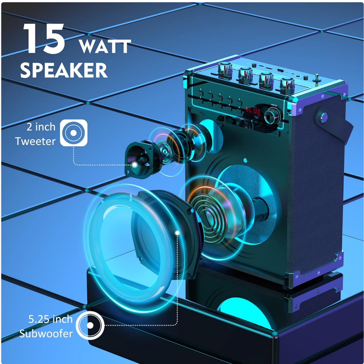
Figure 8.1: Speaker Components and Wattage.