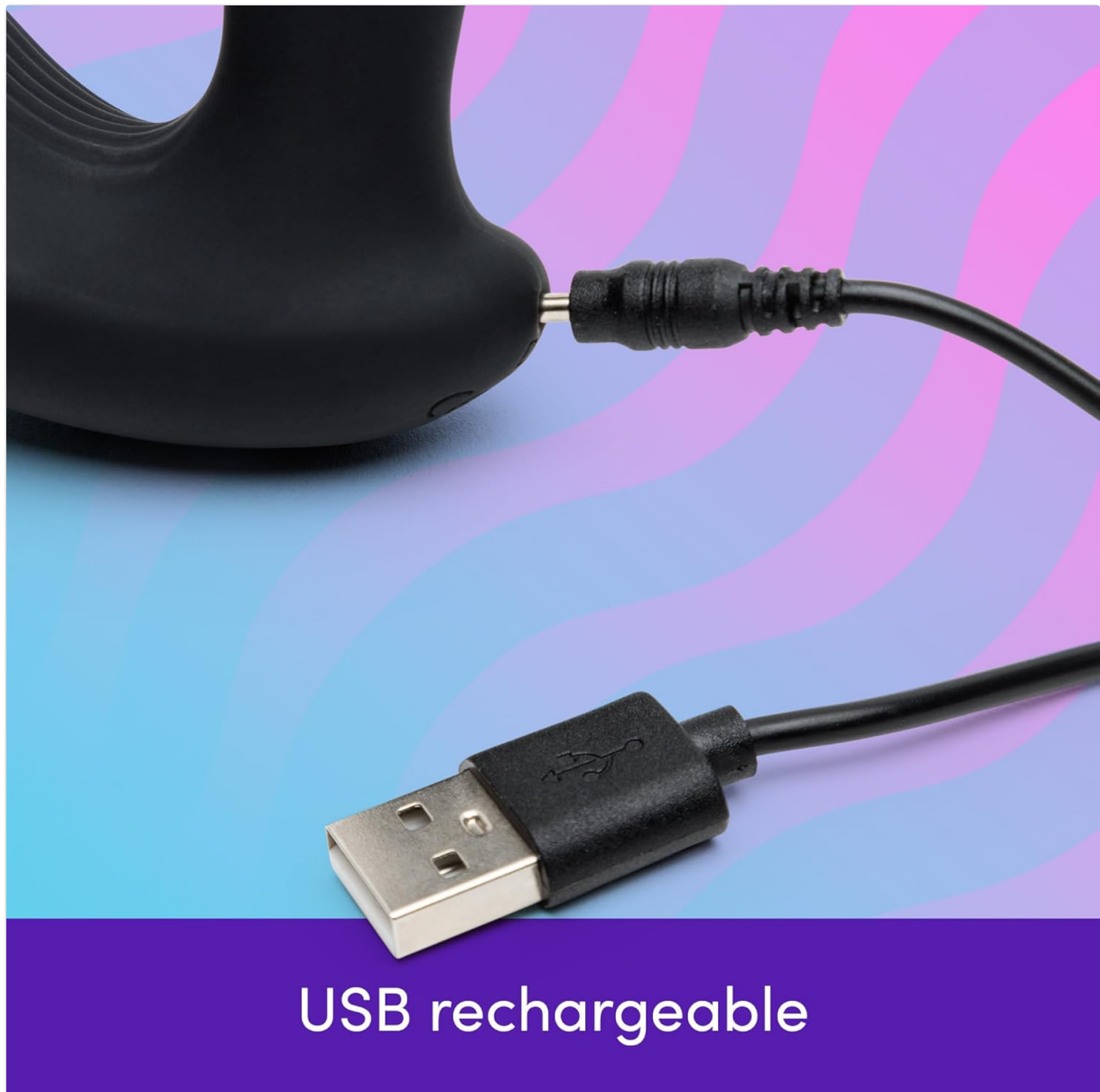
Image: The Lovehoney High Roller Prostate Massager being charged via its USB cable.

provided USB charging cable to the device and plug the other end into a USB power source (e.g., computer, USB wall adapter). The indicator light will show charging status and turn solid when fully charged.