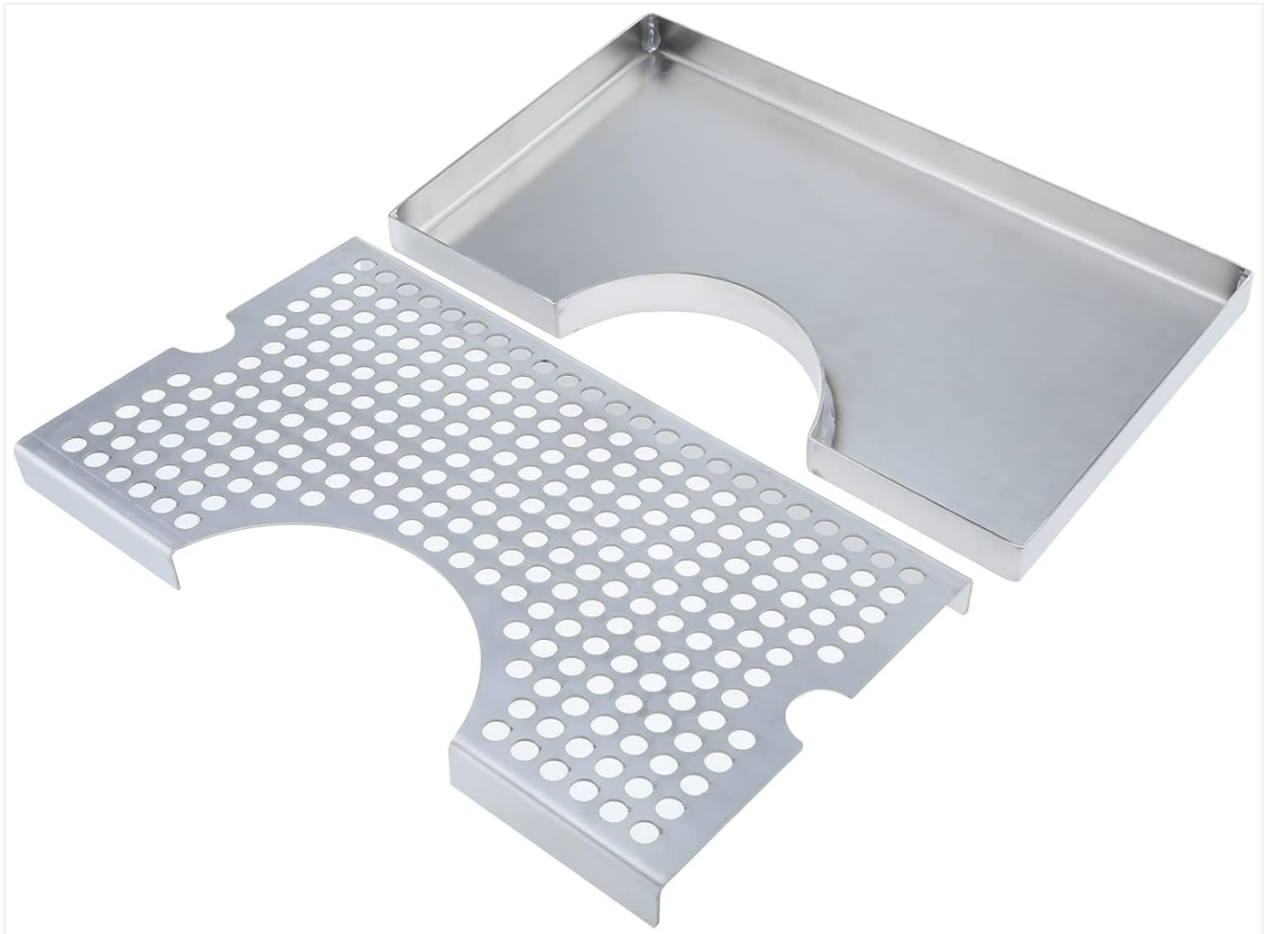
Image: The drip tray disassembled, showing the removable perforated top grate and the solid base tray, highlighting its easy-to-clean design.