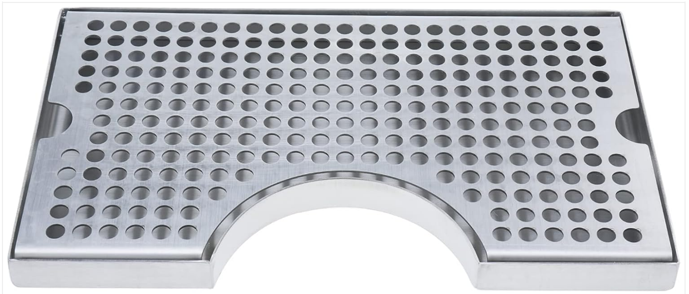
Image: Top view of the LuckyHigh Stainless Steel Cut Out Drip Tray, showcasing its perforated surface and the semi-circular cut-out designed to accommodate a beer tower.

Constructed from high-quality, corrosion-resistant, and anti-rust stainless steel, this drip tray offers both durability and an elegant, shining appearance. Its thoughtful design includes a removable cover, making cleaning exceptionally convenient.