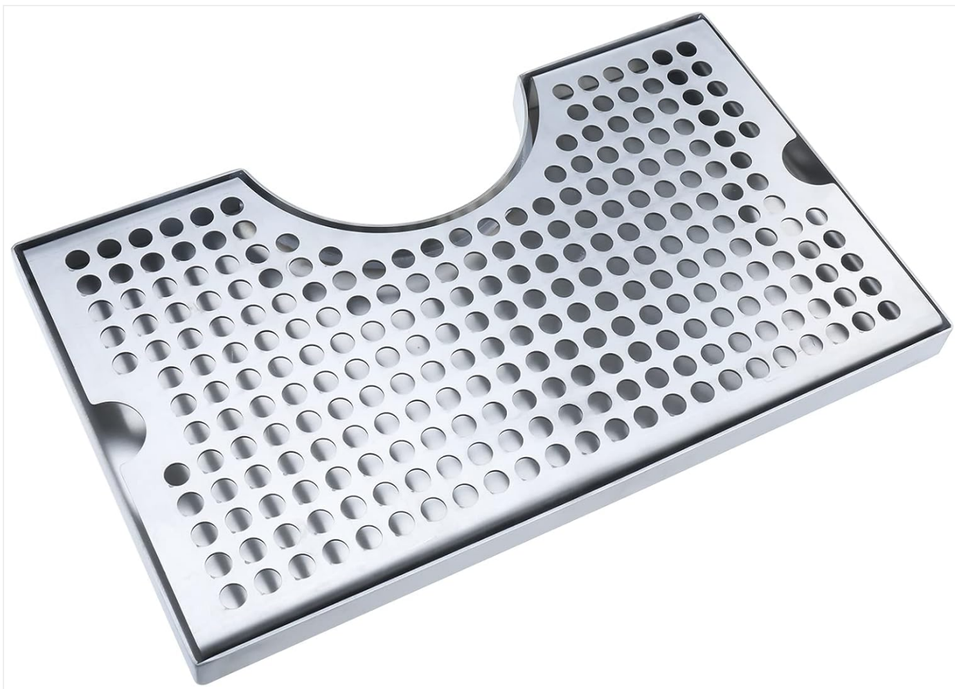
Image: A close-up view of the perforated grate, showing the individual holes designed to allow liquid to pass through while retaining larger debris, emphasizing its functional design for easy cleaning.