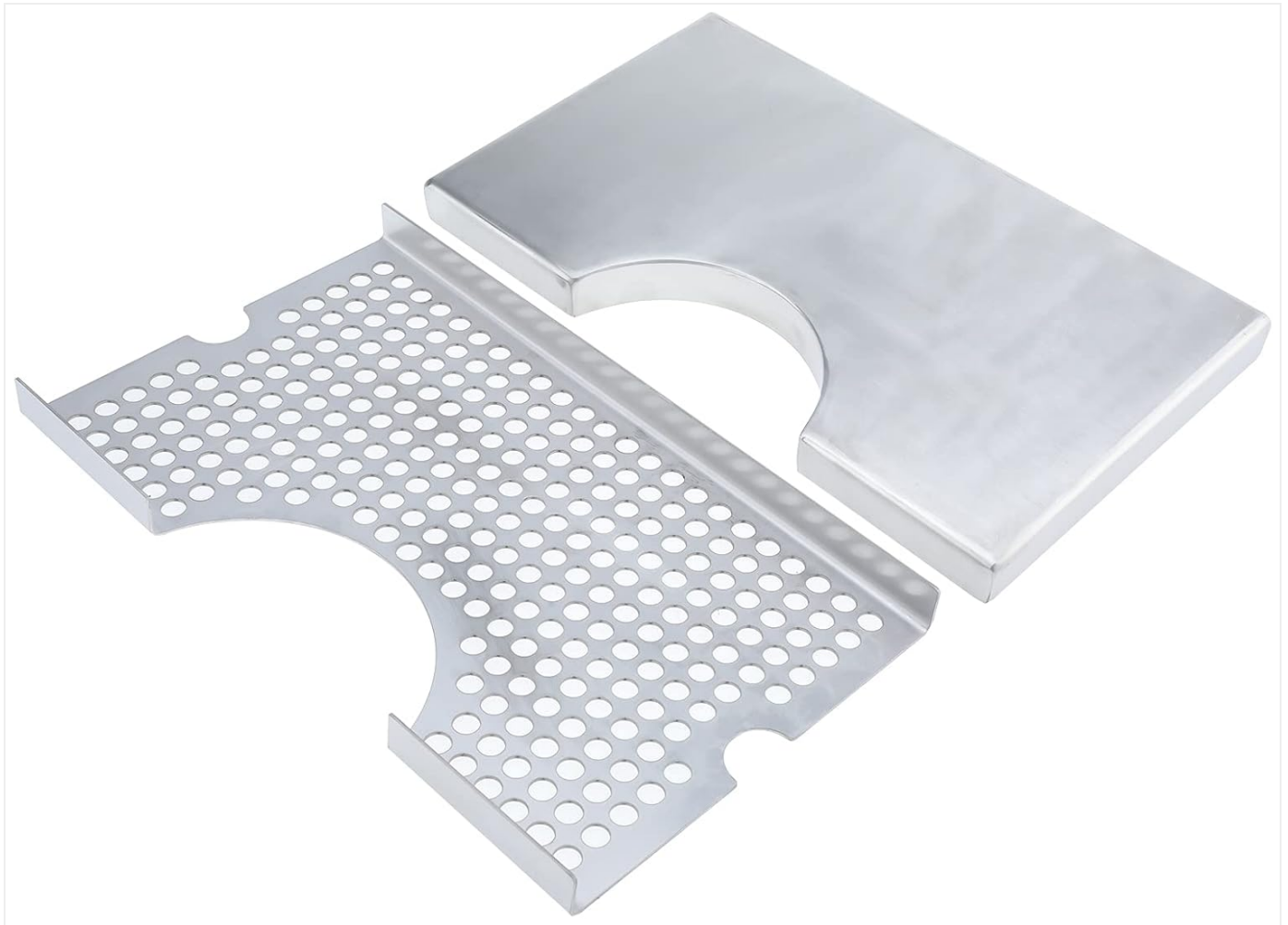
Image: A view demonstrating how the perforated grate fits into the base tray, illustrating the simple assembly process.

5. Verification: Confirm the tray is stable and correctly positioned to catch any drips or spills from the tap.