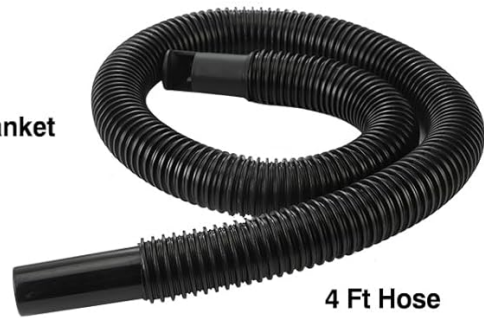
4 Ft Hose