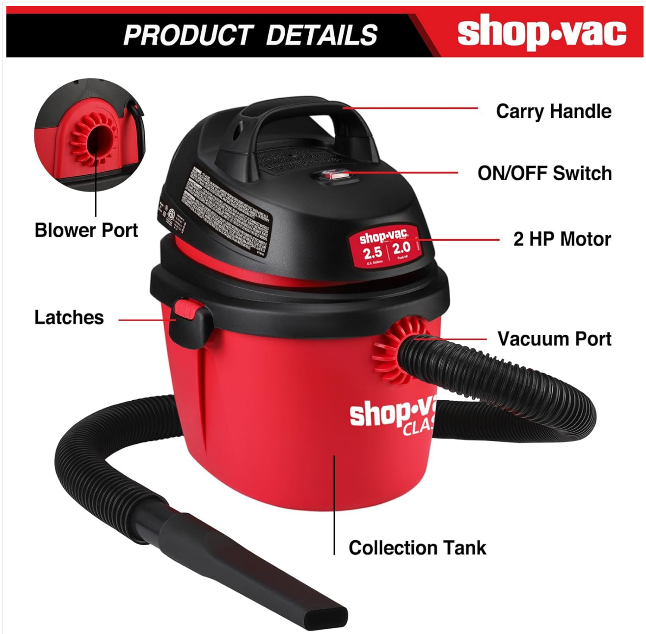
Figure 4.1: Key components and ports of the Shop-Vac unit.