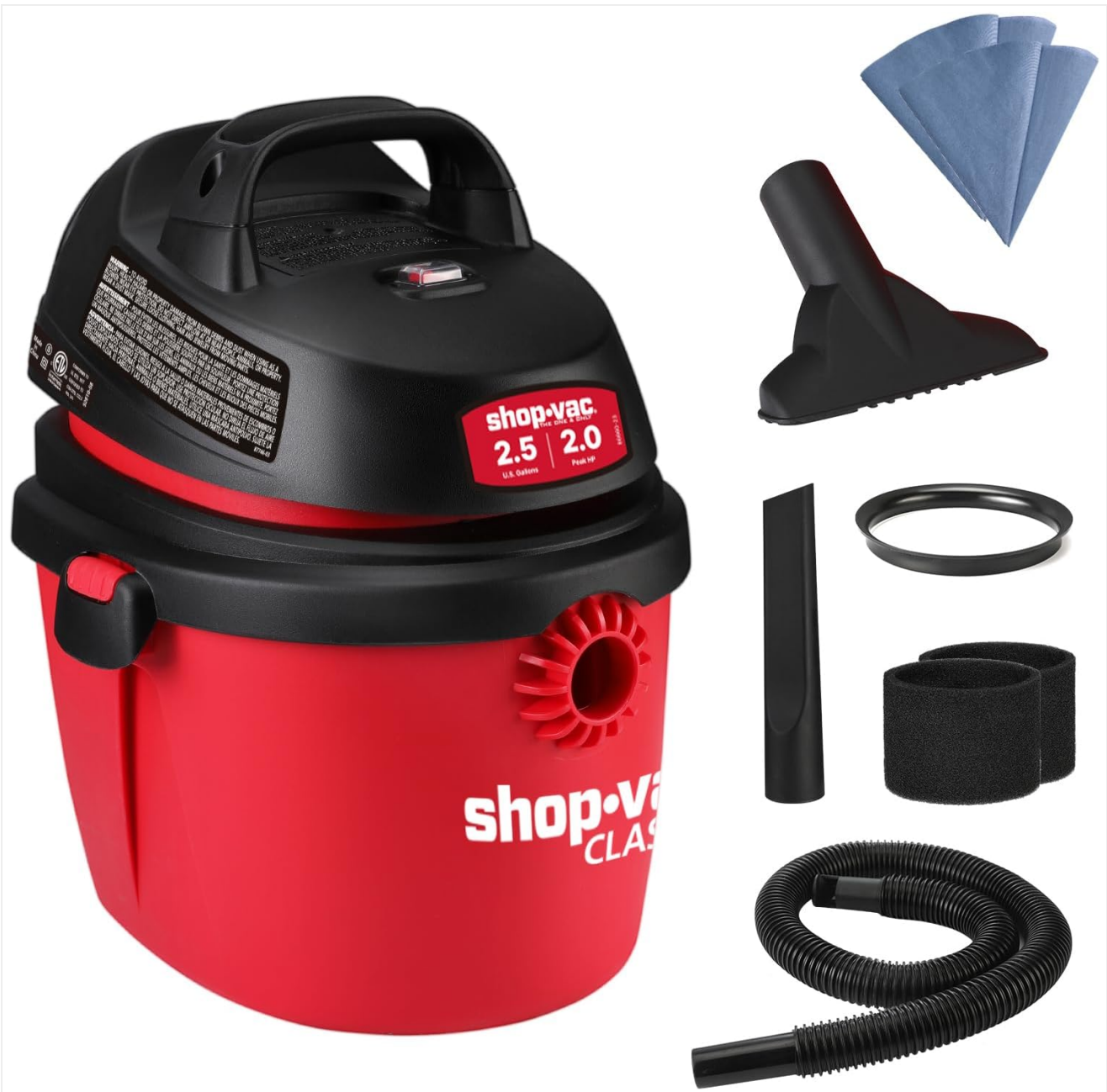
Figure 1.1: Shop-Vac 2.5 Gallon Wet/Dry Vacuum and its accessories.