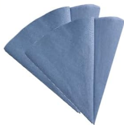
2x Filter Paper