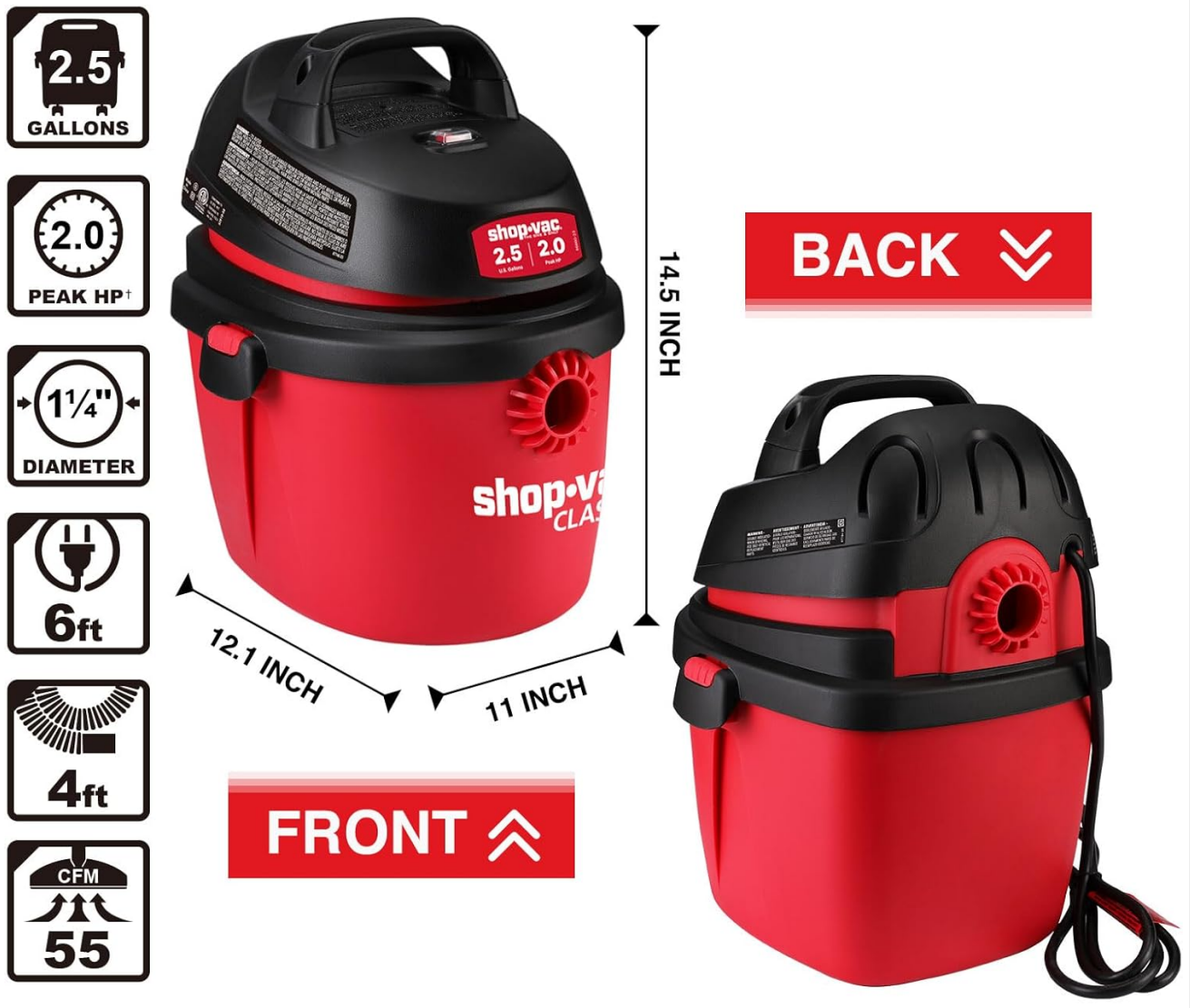
Figure 8.1: Dimensions of the Shop-Vac 2.5 Gallon Wet/Dry Vacuum.