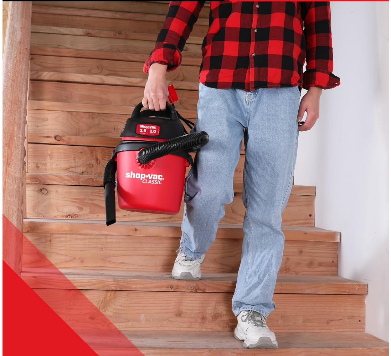
Figure 3.1: The compact design and top handle make the Shop-Vac easy to carry.