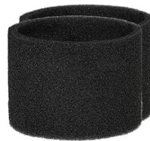
2 x Foam Sleeve