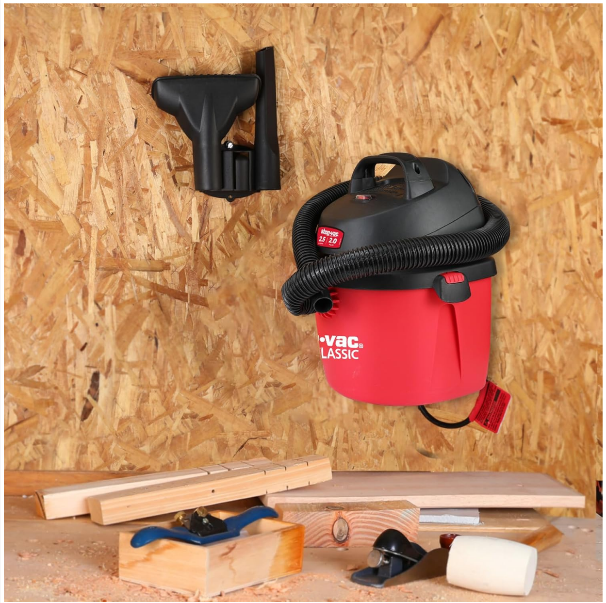
Figure 3.2: The wall-mounted design provides convenient storage.