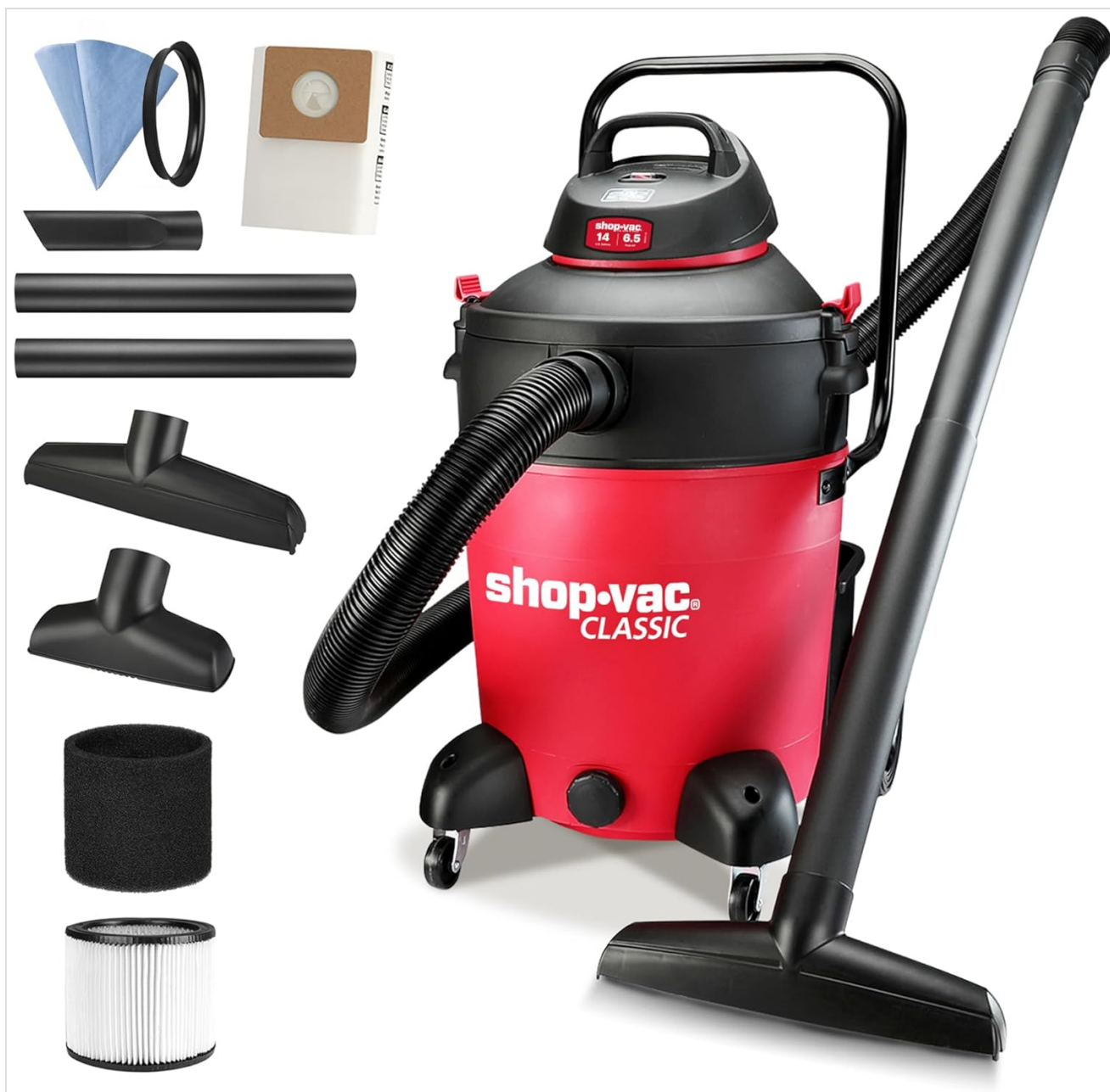
The Shop-Vac 14 Gallon 6.5-Peak HP Wet/Dry Vacuum, shown with its complete set of accessories including hose, wands, nozzles, and filters.