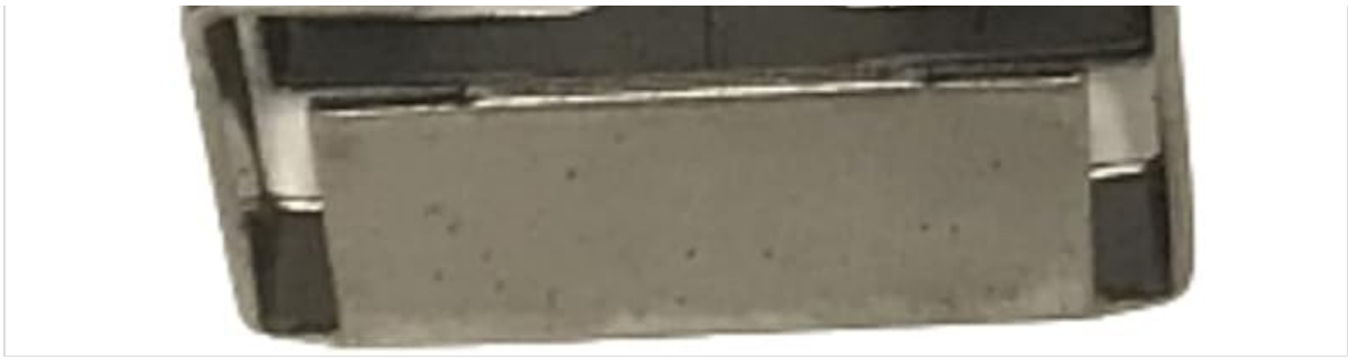
Image 2: Side view of the Owigift Oven Range Burner Igniter, illustrating the ceramic body, the heating element within, and the electrical leads extending from the base.