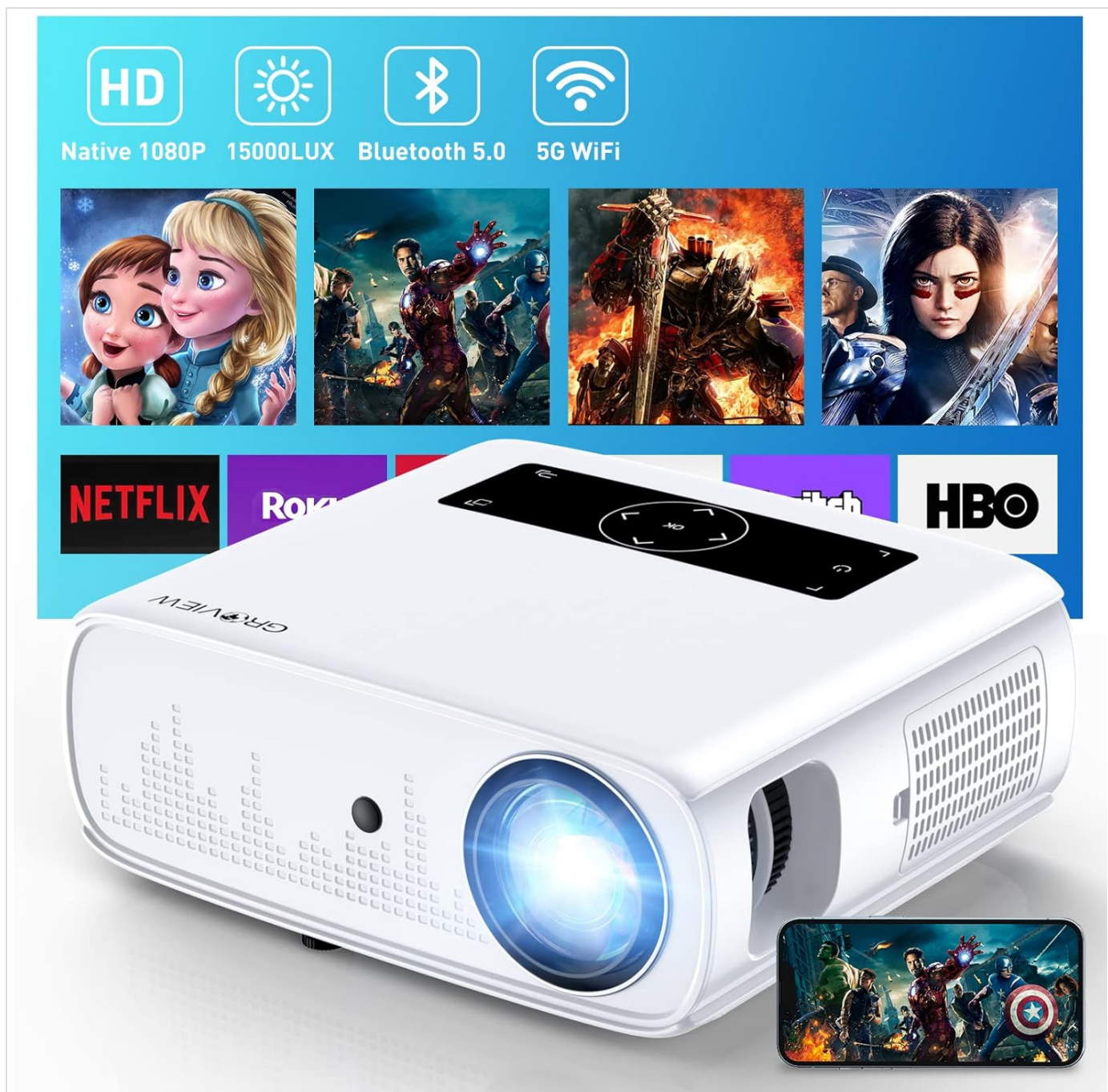
Image: The GROVIEW JQ818C Projector shown with its remote control, AV cable, HDMI cable, and power cord.