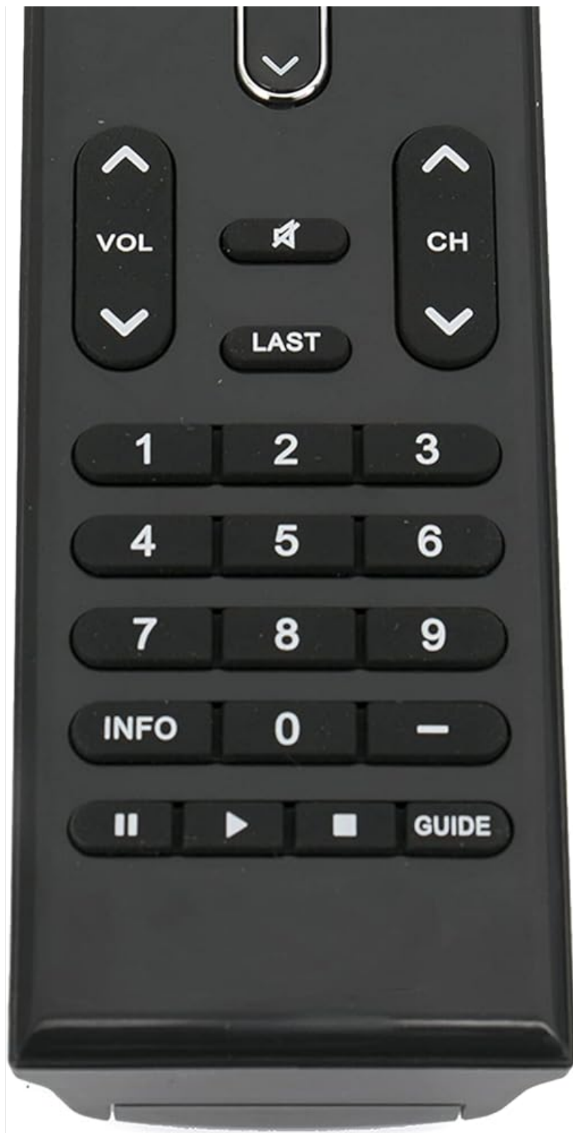
Image 1.1: Front view of the VINABTY VR10 Remote Control, showing all buttons and their labels.