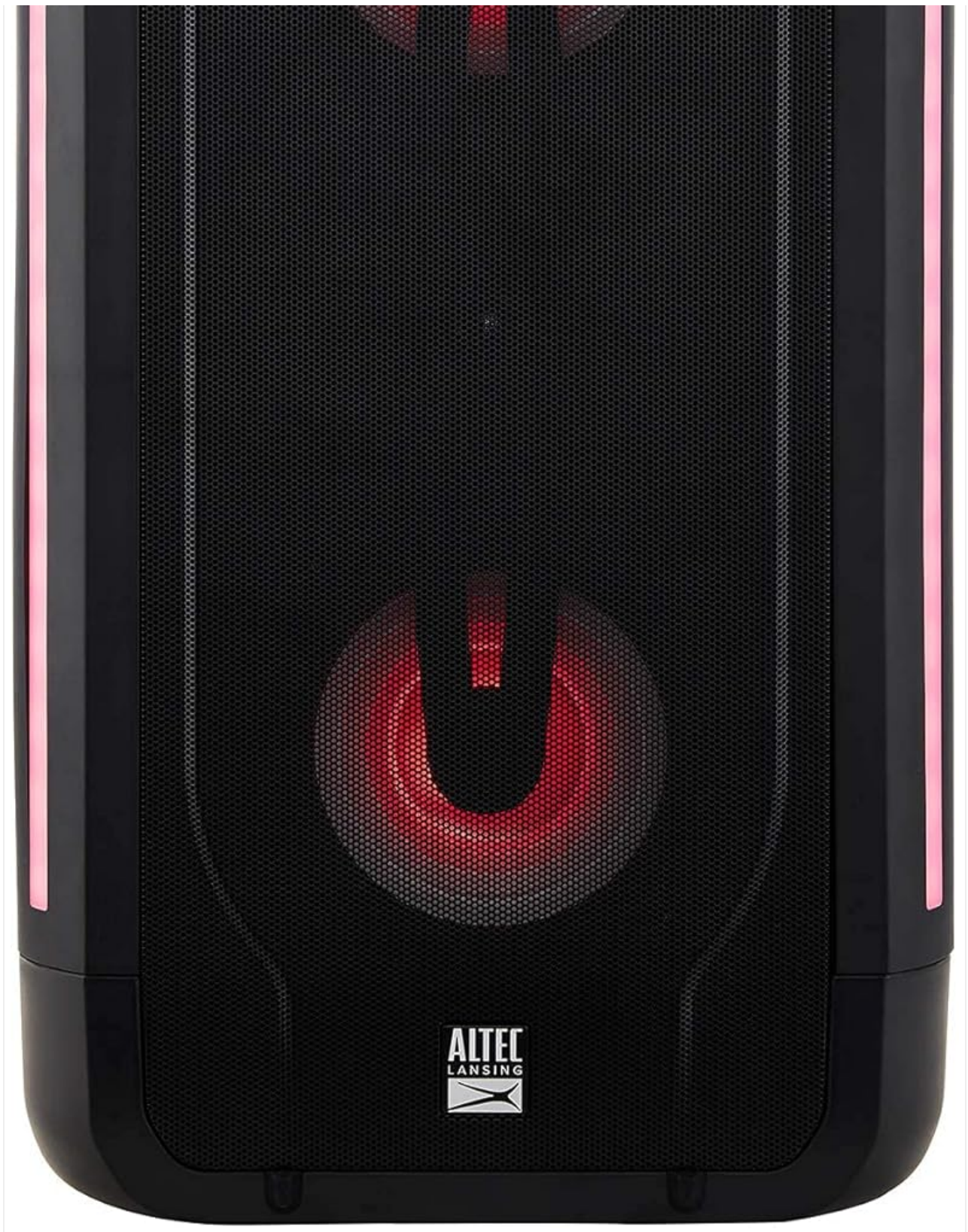
Image: The Altec Lansing Shockwave speaker illuminated with red LED lights, demonstrating one of its multi-light party modes.