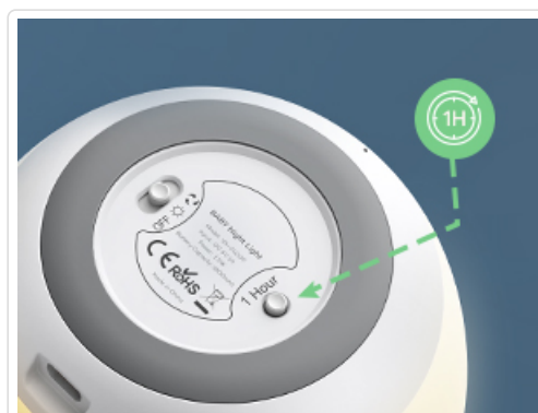
Figure 7: Close-up of the bottom of the night light showing the 1-hour timer switch.