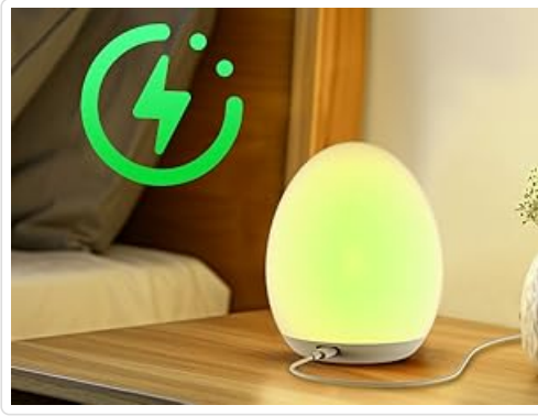
Figure 3: The night light connected to a USB charging cable.