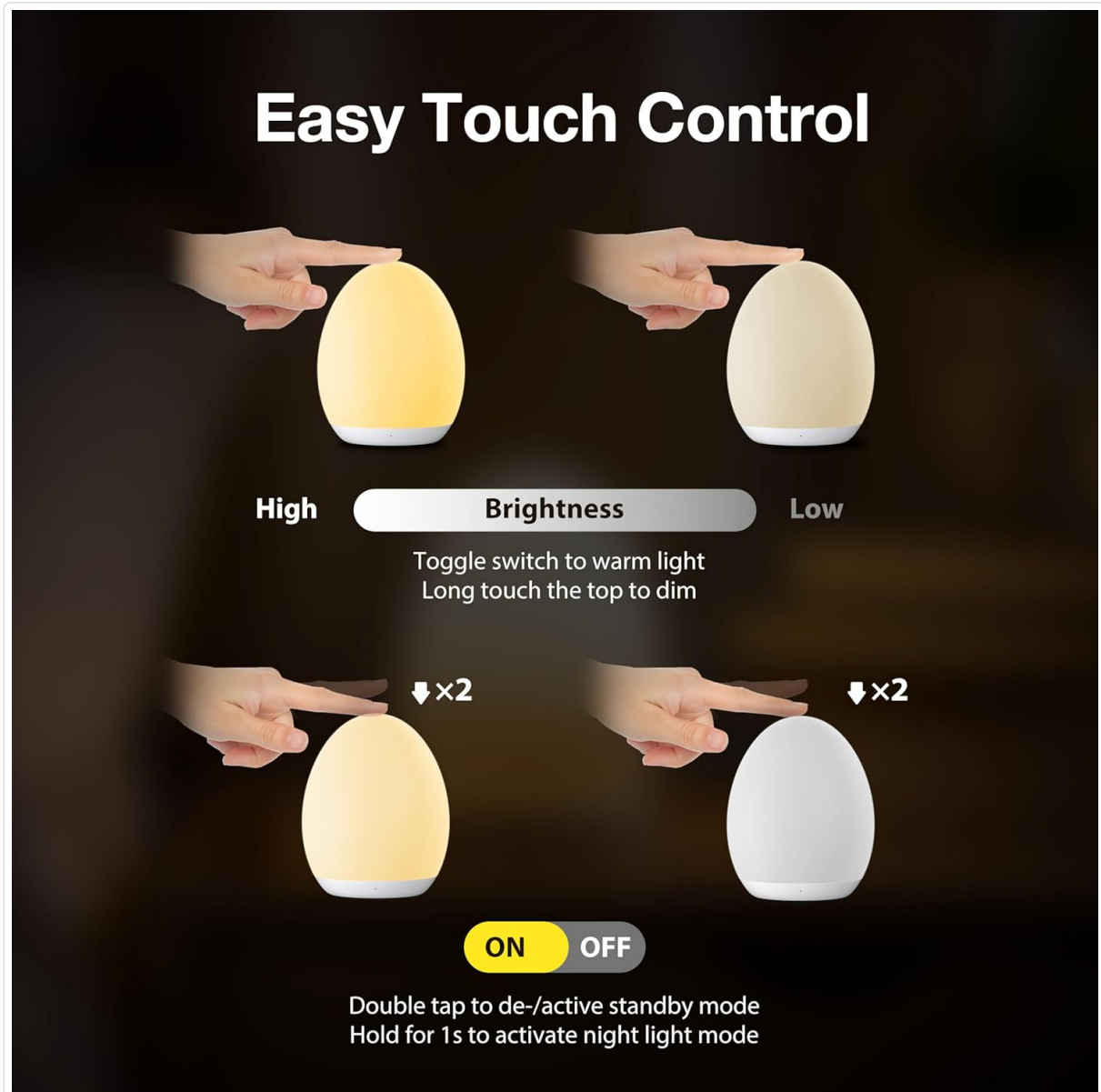
Figure 5: Demonstrating touch control for adjusting brightness from high to low.