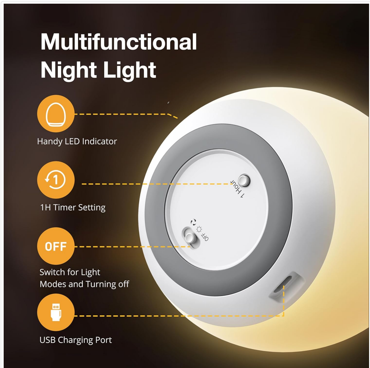
Figure 4: Bottom view of the night light, highlighting the USB charging port, 1-hour timer switch, and the main ON/OFF switch.