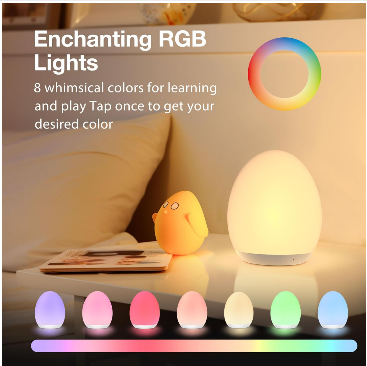
Figure 6: The night light displaying various enchanting RGB colors.

8 whimsical colors for learning and play Tap once to get your desired color