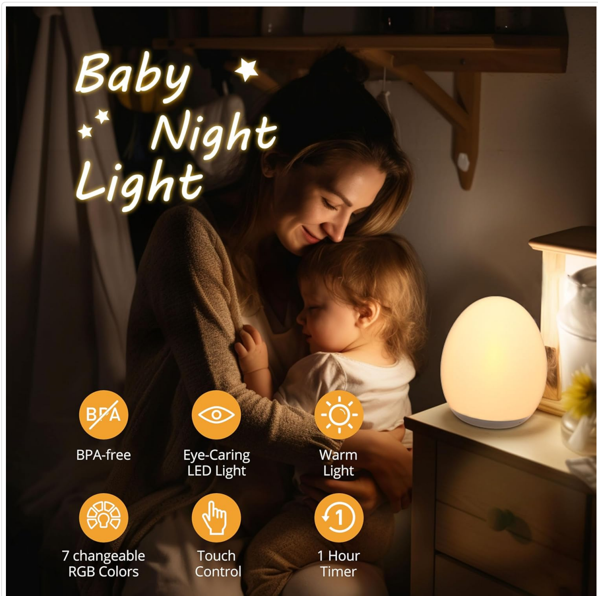
Figure 2: Overview of JolyWell Night Light's main features including BPA-free material, eye-caring LED, warm light, 7 RGB colors, touch control, and 1-hour timer.