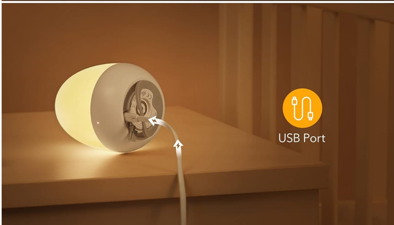
Image: Illustration showing two charging methods: placing the night light on its charging base, or plugging a USB cable directly into the night light's bottom port.