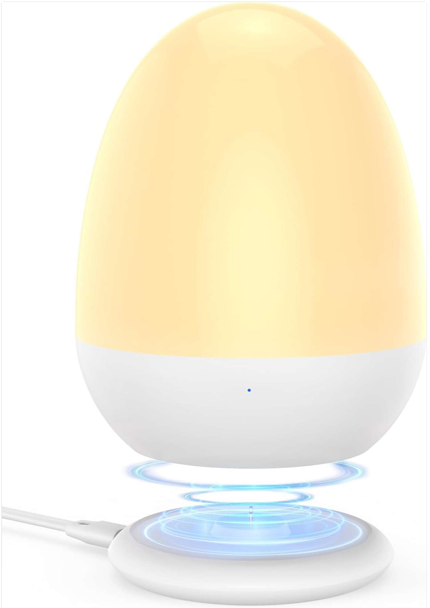
Image: The JolyWell CL001 Baby Night Light, an egg-shaped device, resting on its circular charging base, emitting a warm glow.