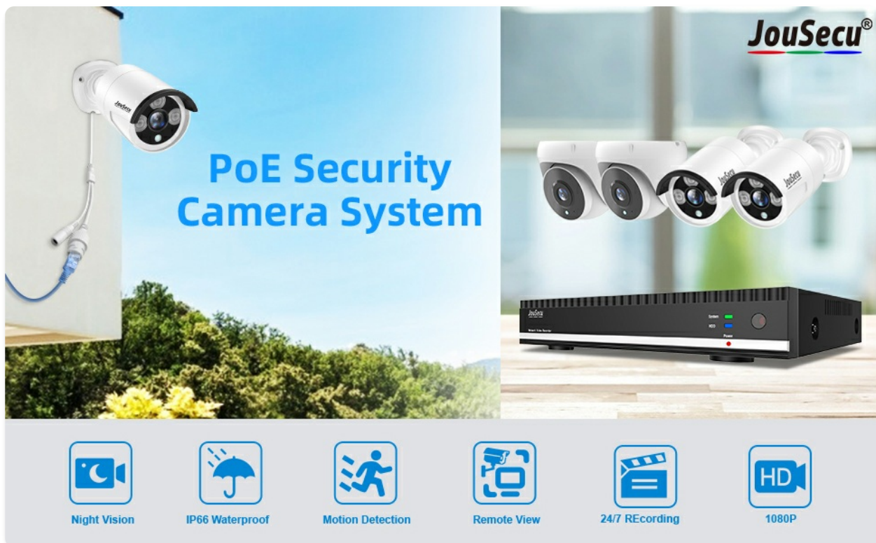
Figure 1.2: Key Features of the PoE Security Camera System

The system offers easy installation with PoE connectivity, high-definition video capture, motion detection with smart notifications, and remote viewing capabilities via mobile and PC clients. Its IP66 weatherproof cameras ensure reliable performance in various outdoor conditions.