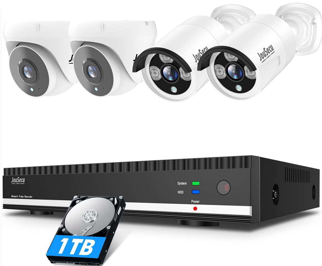
Figure 1.1: JouSecu Home Security Camera System Overview

This manual provides detailed instructions for the installation, operation, and maintenance of your JouSecu Home Security Camera System. This system includes a Power over Ethernet (PoE) Network Video Recorder (NVR) and 3MP HD IP cameras, designed for reliable 24/7 surveillance.