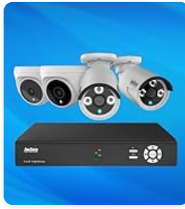
Figure 2.1: Package Checklist

For a visual guide on the package contents, please watch the video below: