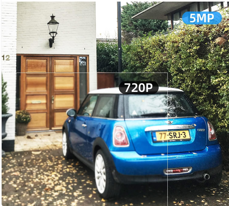
Figure 4.4: 5MP Super HD Image Quality