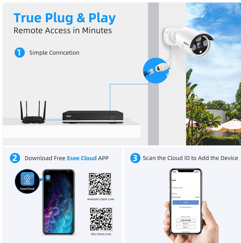
Figure 3.1: True Plug & Play Connection Diagram

Watch this video for a step-by-step guide on connecting your system: