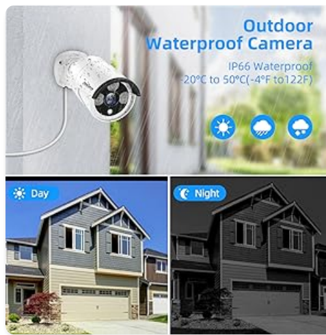
Figure 4.2: 24/7 Recording Coverage