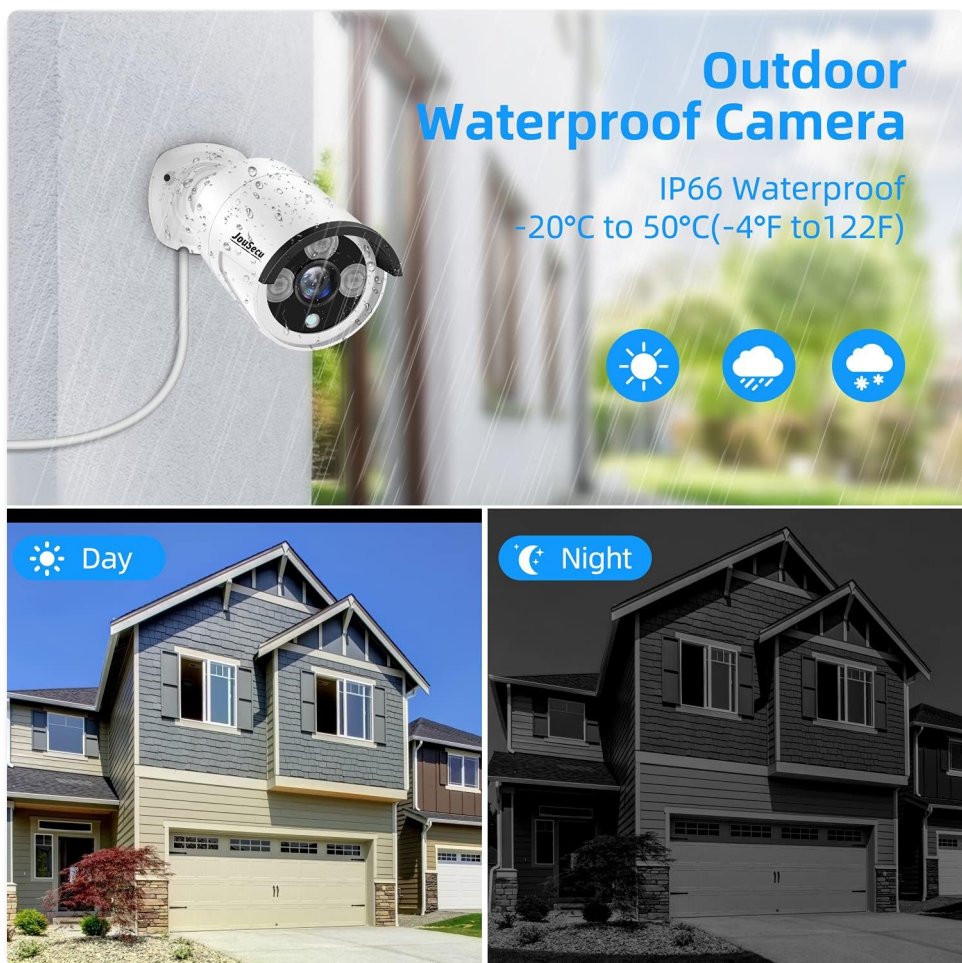
Figure 4.5: Outdoor Waterproof Camera with Day/Night Vision