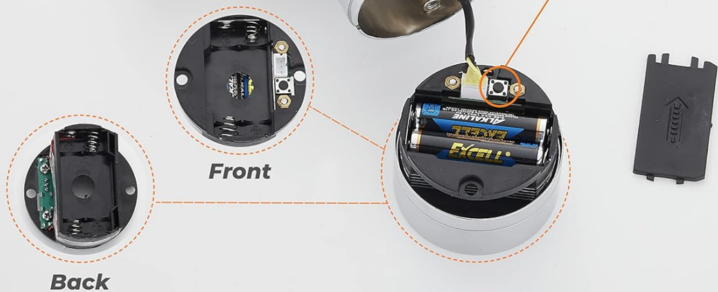
Figure 4: Battery compartment and reset button location.

When passwords are forgotten, press and hold the reset button of the lock for 10 seconds to reset the lock to the factory settings.