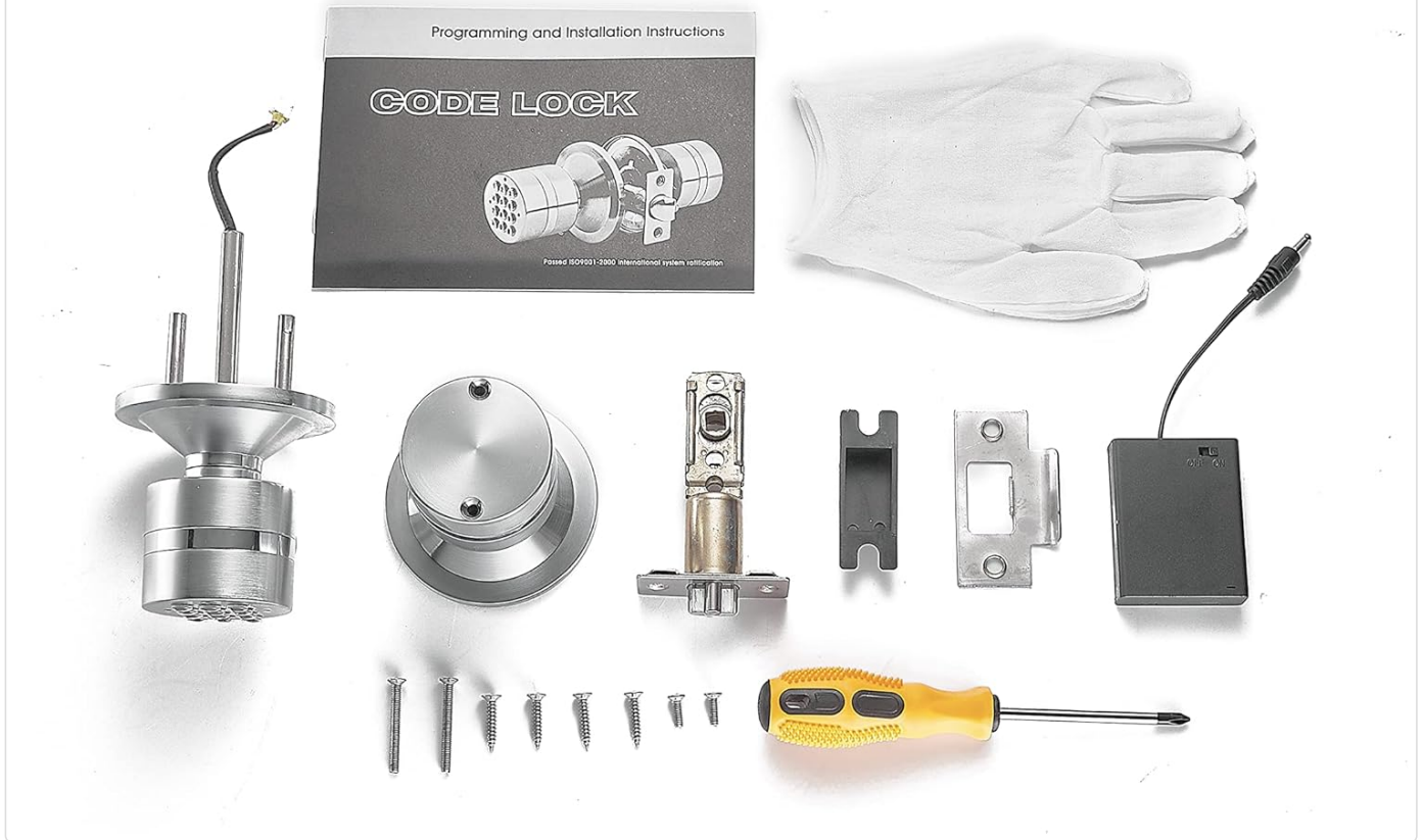
Figure 2: Packaging contents including door knob components, screws, and manual.