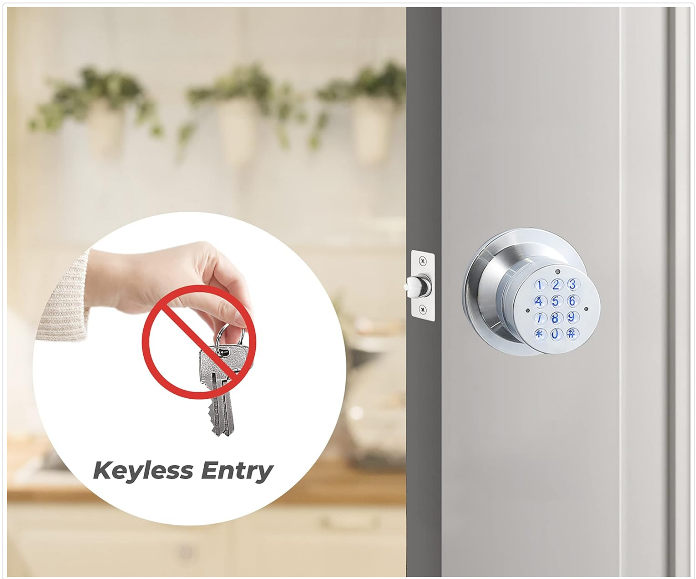
Figure 6: Demonstrating keyless entry convenience.