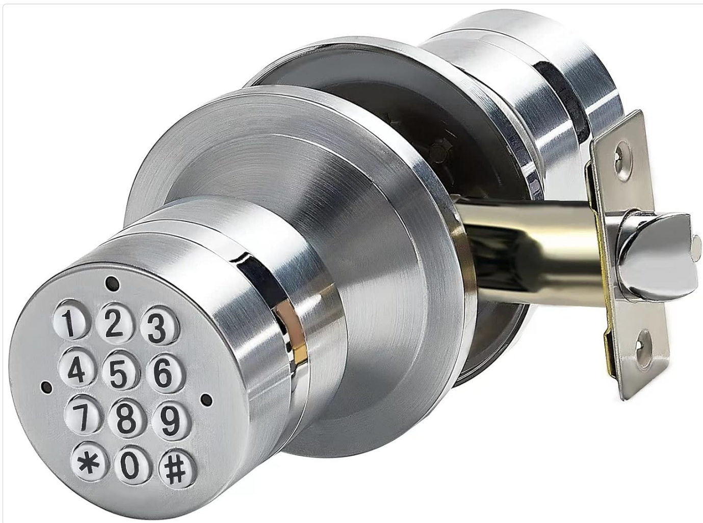
Figure 1: Overview of the YL-99 Keyless Electronic Door Knob.