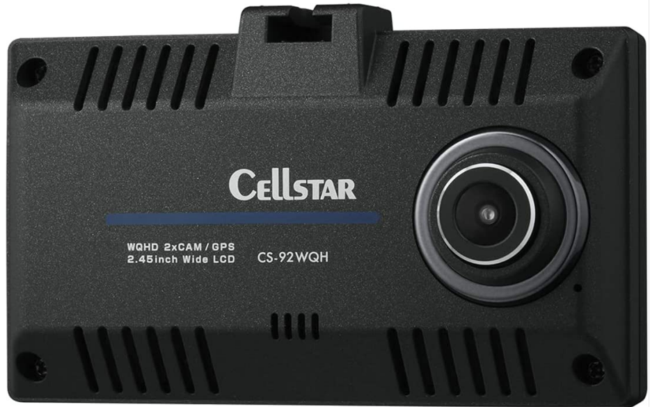
Image: The main unit of the CELLSTAR CS-92WQH drive recorder with its display showing a road scene, alongside the compact rear camera.