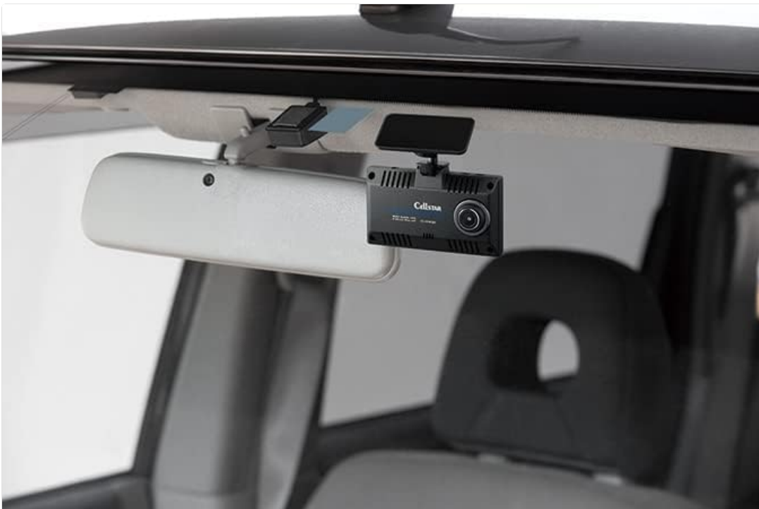
Image: The drive recorder main unit is shown installed on the inside of a car's windshield, positioned discreetly behind the rearview mirror.

The drive recorder uses an adhesive mounting type. Ensure the installation location provides a clear view of the road and does not obstruct the driver's vision. The rear camera should be mounted to provide an unobstructed view of the rear.