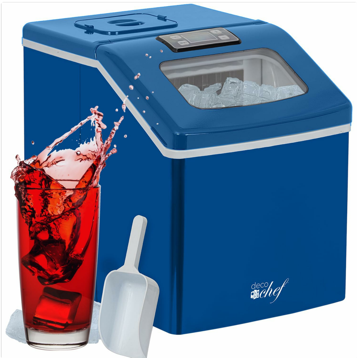
Image: Deco Chef Countertop Ice Maker in blue, shown with a glass of iced beverage and an ice scoop. This illustrates the product's primary function and included accessory.