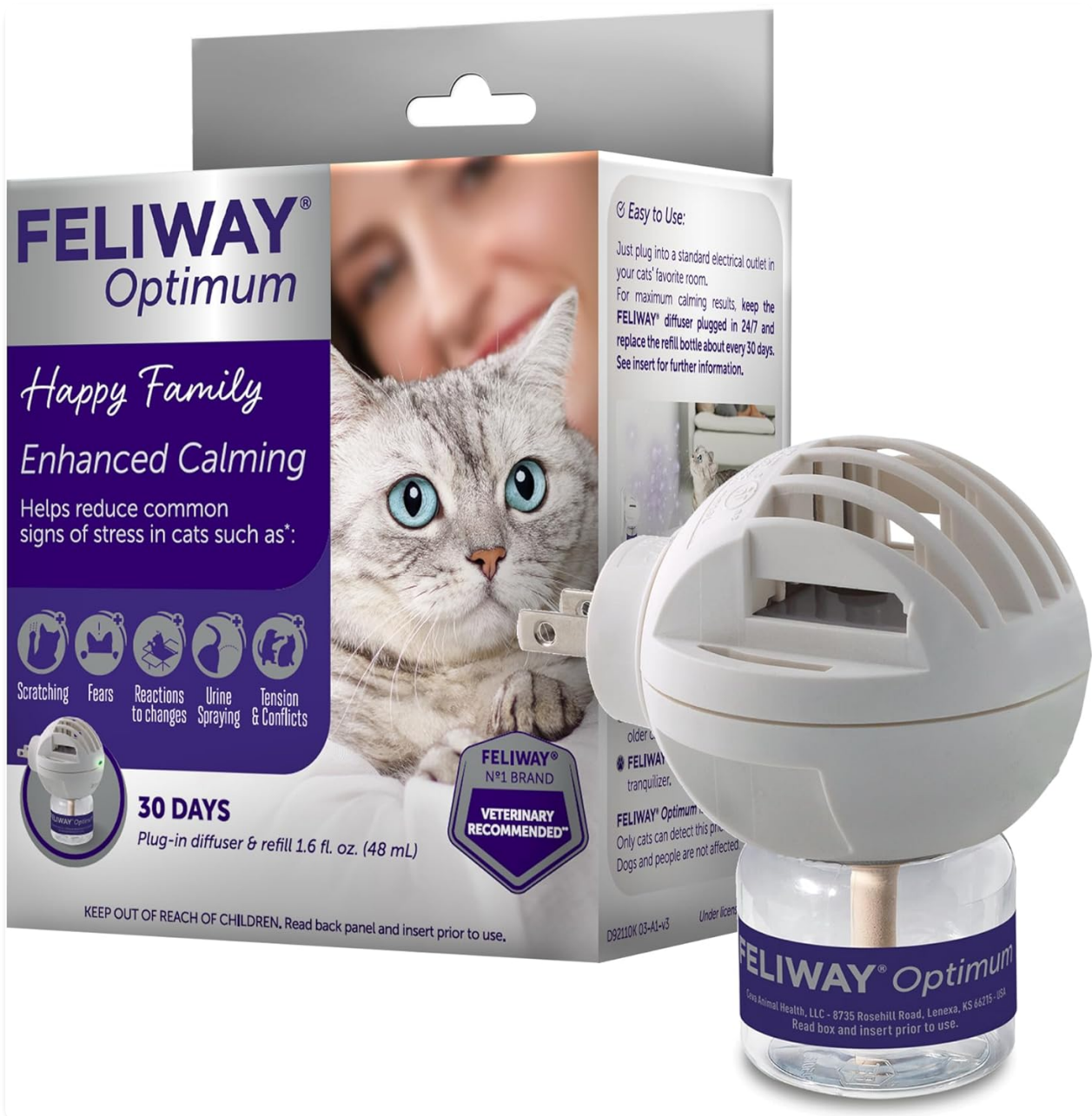
Image: FELIWAY® Optimum Diffuser Starter Kit, showing the diffuser unit and refill bottle alongside its packaging.