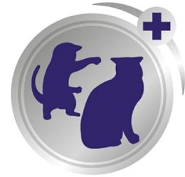
Tension & Conflicts