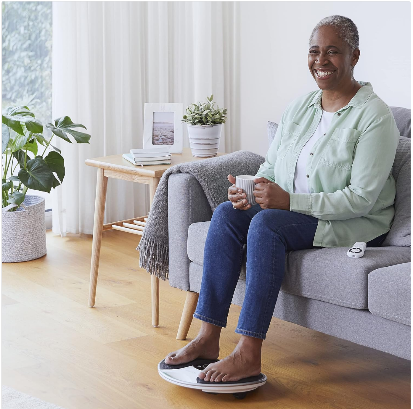
Image: A woman sitting on a sofa with her bare feet placed on the REVITIVE Medic Circulation Booster, demonstrating typical use.