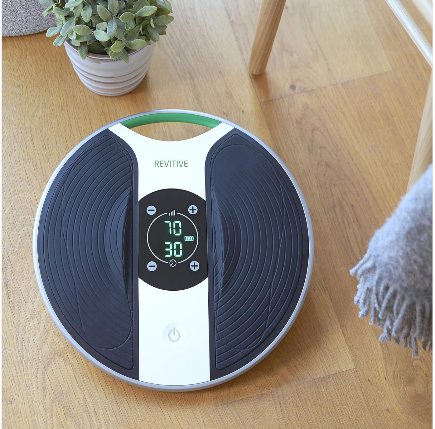
Image: The REVITIVE Medic Circulation Booster positioned on a wooden floor, ready for use, with a small plant in the background.