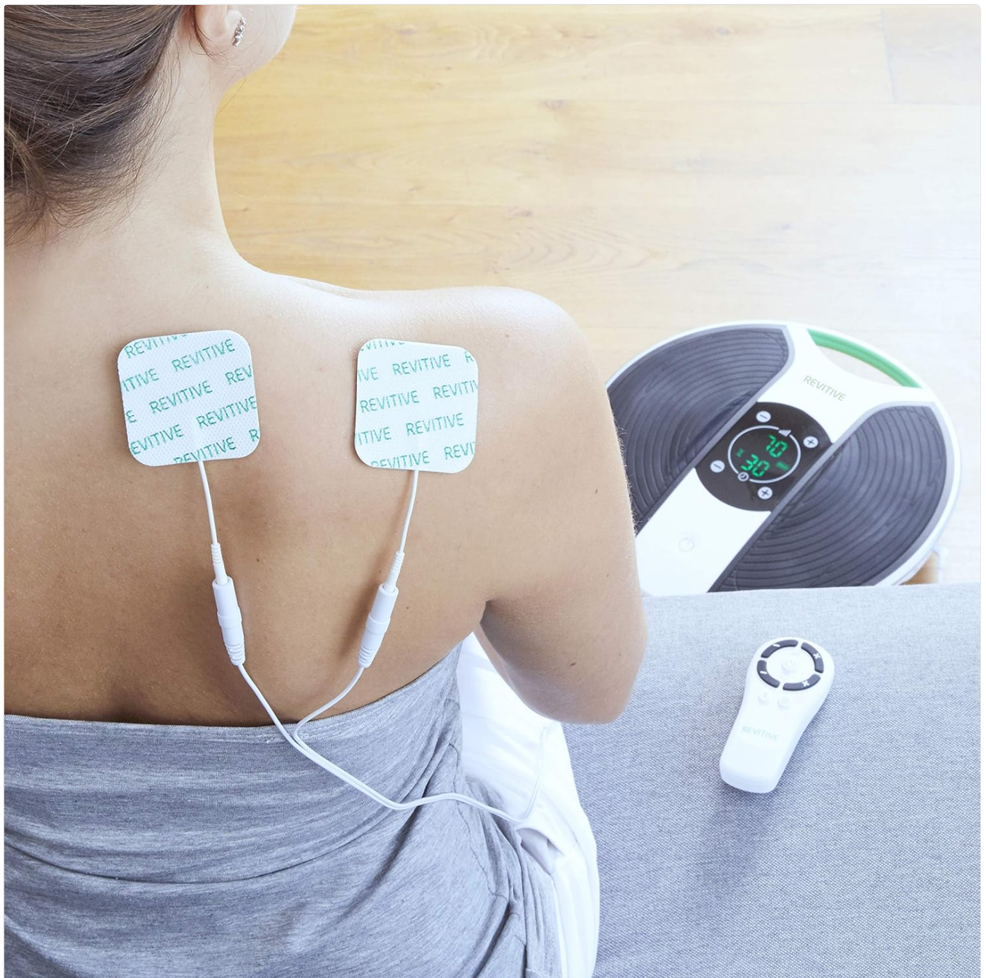
Image: The REVITIVE Medic Circulation Booster device, its remote control, and a set of body pads, laid out on a surface.