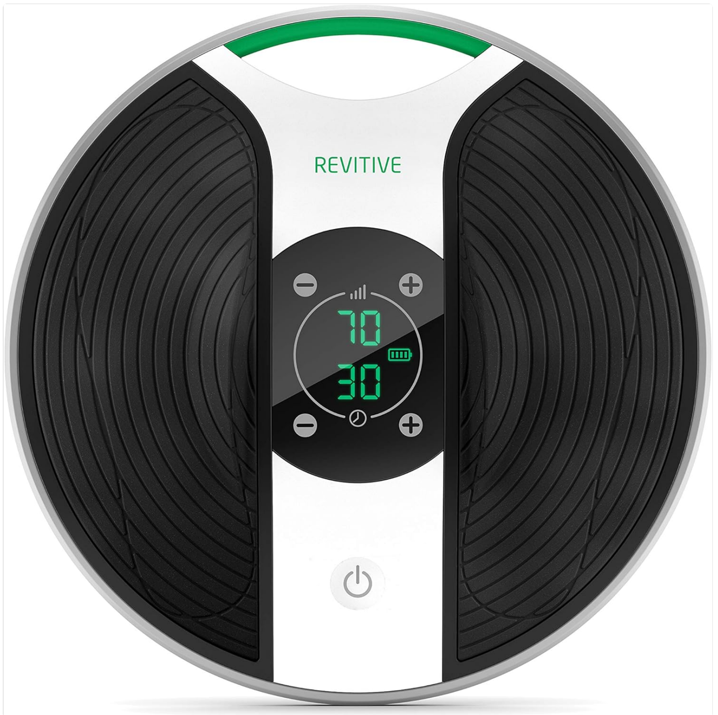
Image: The REVITIVE Medic Circulation Booster, a circular device with footpads and a central display, shown from a top-down perspective.