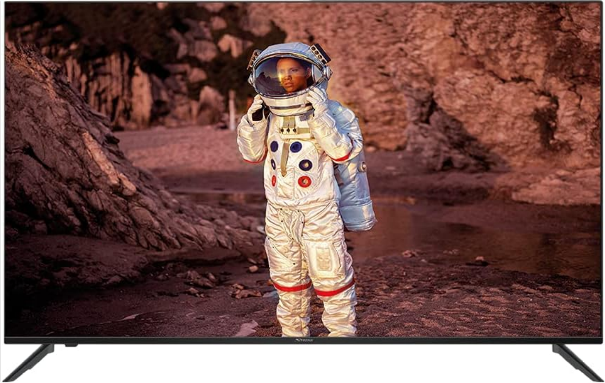
Image 3.1: Front view of the STRONG SRT43UC6433 4K UHD Android TV, showing the attached stand.

If you are not wall-mounting the TV, attach the included stand feet. Place the TV face down on a soft, clean surface to prevent screen damage. Align each stand foot with the corresponding slots on the bottom of the TV and secure them with the provided screws.