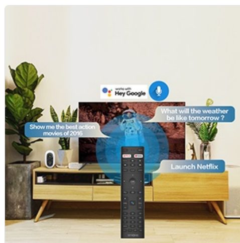
Image 4.2: An illustration demonstrating the use of Google Assistant for voice commands, such as asking for movies, weather, or launching applications like Netflix.