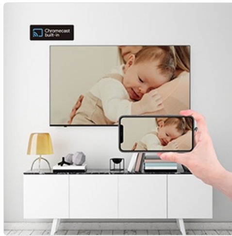
Image 4.3: The Chromecast built-in feature, allowing users to cast content from a mobile phone to the television screen.