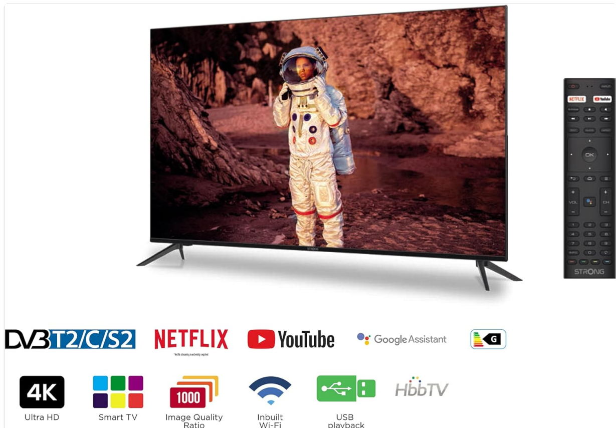
Image 1.1: The STRONG SRT43UC6433 4K UHD Android TV with its remote control, showcasing key features like DVB-T2/C/S2, Netflix, YouTube, Google Assistant, 4K Ultra HD, Smart TV, Image Quality Ratio 1000, Inbuilt Wi-Fi, USB playback, and HbbTV.