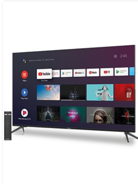
Image 4.1: The Android TV home screen displaying various applications like YouTube, Netflix, and Google Play, alongside the remote control.

Your STRONG SRT43UC6433 runs on the Android TV operating system, providing access to a wide range of applications and services.