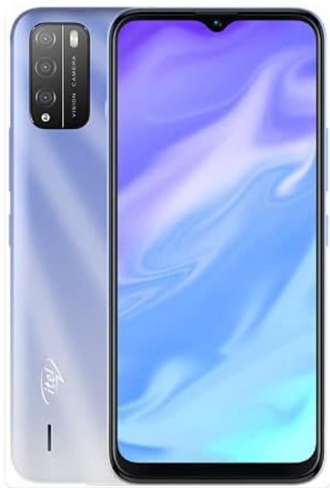
Image 1.1: Front and back view of the Itel Vision 1 Pro L6502 smartphone. The front displays the screen with a teardrop notch, and the back shows the triple camera setup and fingerprint sensor.

This manual provides essential instructions for the safe and efficient use of your Itel Vision 1 Pro L6502 smartphone. Please read this guide thoroughly before operating your device to ensure optimal performance and longevity. Keep this manual for future reference.